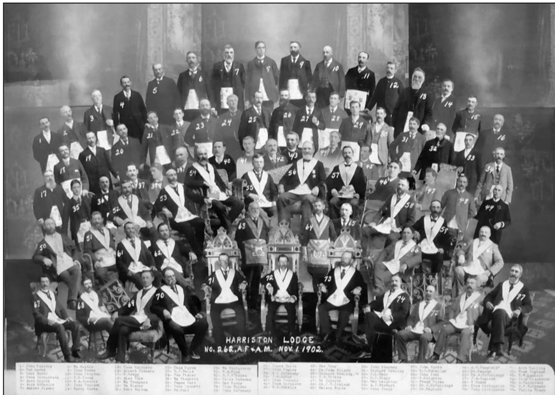
Members of AF&AM Lodge #262

be fined one dollar or any member of No. 1152 disobeying the committee on the 12th of July be fined one dollar. 43 Three years later, this fine was quintupled. 44