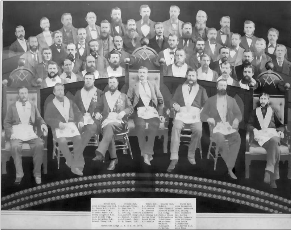
Members of AF&AM Lodge #262, 1879.

dian Order of Foresters). These records consist primarily of personal data collected about each man when the lodge membership considered their candidacy for admission, as well as minutes of meetings, and some financial records. Information was also drawn from census reports, voters' lists, community tax assessment records, county gazetteers, and business directories. AF&AM Lodge #262 also provided generous access to historical materials.