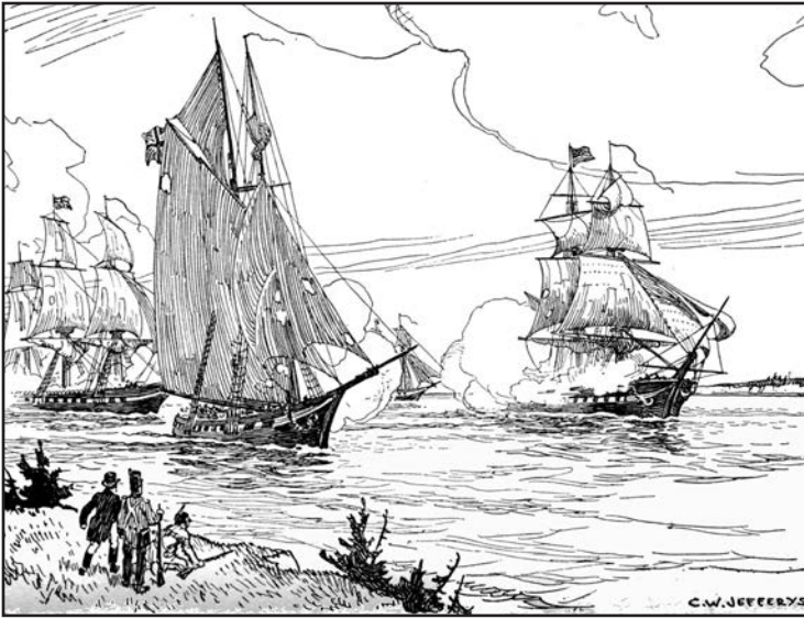
Naval action on Lake Ontario, 1813, by C.W. Jeffreys.