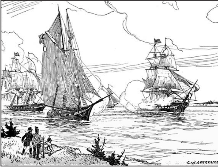
Naval action on Lake Ontario, 1813, by C.W. Jeffreys.