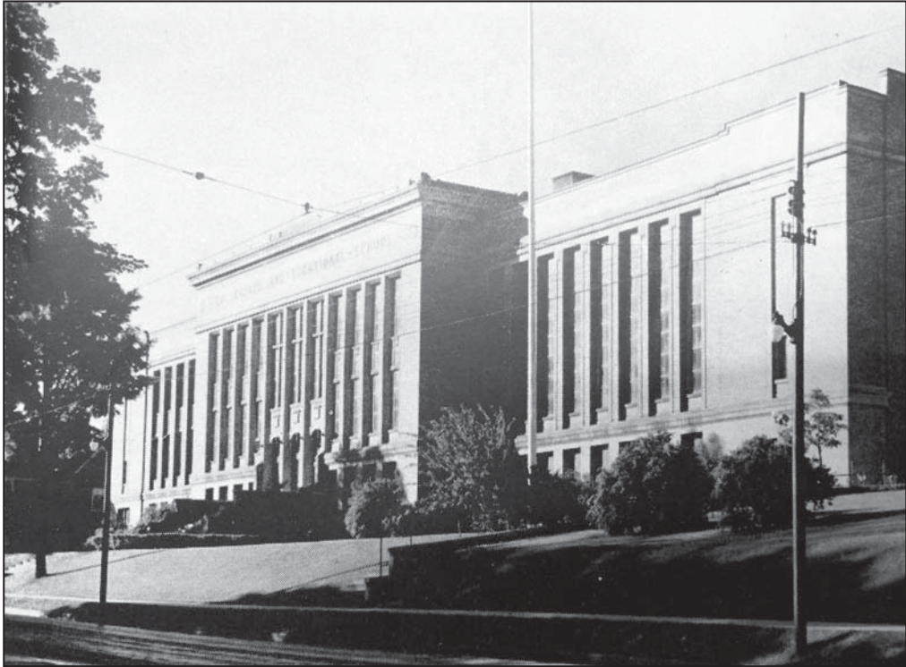
Figure 1: Photo of K.C.I. from the Grumbler , 1945-1946.

strengthened their character and prepared them for becoming productive Canadian citizens. Through an in-depth study of K.C.I. during the Second World War, examining student magazines and local newspapers, this article explores the wartime dynamics and experiences within one Canadian high school.