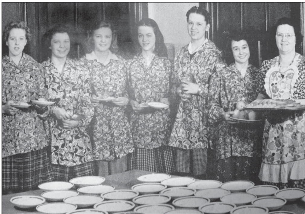
Figure 7: Female students at K.C.I. baking for the war effort. Grumbler , 1945-1946.

the arts, and were enrolled in classes to prepare them for becoming wives and mothers in the home. However, the war augmented their role within the school to include taking the lead on many organizations and initiatives for the war effort. Female students at K.C.I. organized the Junior Red Cross committee, raising money through weekly collections that taught girls to keep track of money. 52 Another activity of the Junior Red Cross was sewing and knitting as a group every week on Tuesday nights. Students practiced these important tasks that all girls were expected to know, while making