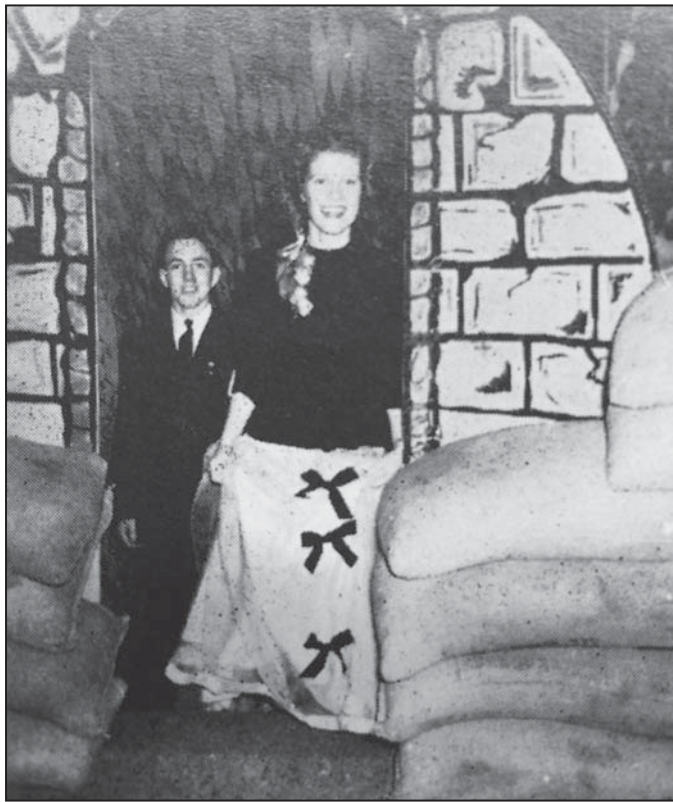
Figure 4: K.C.I. students at the "Blisskrieg Ball" in December 1941. Grumbler , 1941-1942.

the war effort. A leading example of this is the monthly tea dances that took place, with proceeds donated to the Red Cross. Figure 4 shows two K.C.I. students at a 'Blisskrieg Ball' themed Christmas dance in 1941. These dances were very popular among students, and their success was praised for demonstrating "the patriotic spirit of K.C.I." 37 In this way, students at K.C.I. were able to engage in many activities of interest to their generation, while also showing their commitment to the war effort and, therefore, their school community.