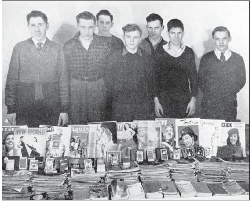
Figure 8: Male students at K.C.I. organizing donations for the Navy. Grumbler , 1944-1945.

prominent roles in traditional female wartime activities, girls began to take on more leadership positions within the student government and on the Grumbler executive. However, these changes were neither abundant nor long lasting, as younger male students were often the first choice to fill the