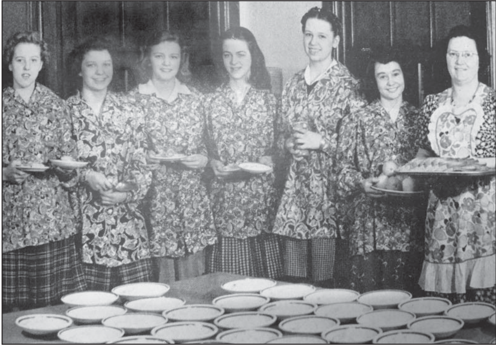
Figure 7: Female students at K.C.I. baking for the war effort.

the arts, and were enrolled in classes to prepare them for becoming wives and mothers in the home. However, the war augmented their role within the school to include taking the lead on many organizations and initiatives for the war effort. Female students at K.C.I. organized the Junior Red Cross committee, raising money through weekly collections that taught girls to keep track of money. 52 Another activity of the Junior Red Cross was sewing and knitting as a group every week on Tuesday nights. Students practiced these important tasks that all girls were expected to know, while making