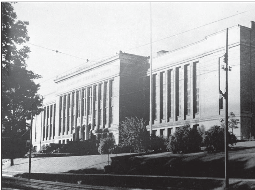
Figure 1: Photo of K.C.I. from the Grumbler , 1945-1946.

strengthened their character and prepared them for becoming productive Canadian citizens. Through an in-depth study of K.C.I. during the Second World War, examining student magazines and local newspapers, this article explores the wartime dynamics and experiences within one Canadian high school.