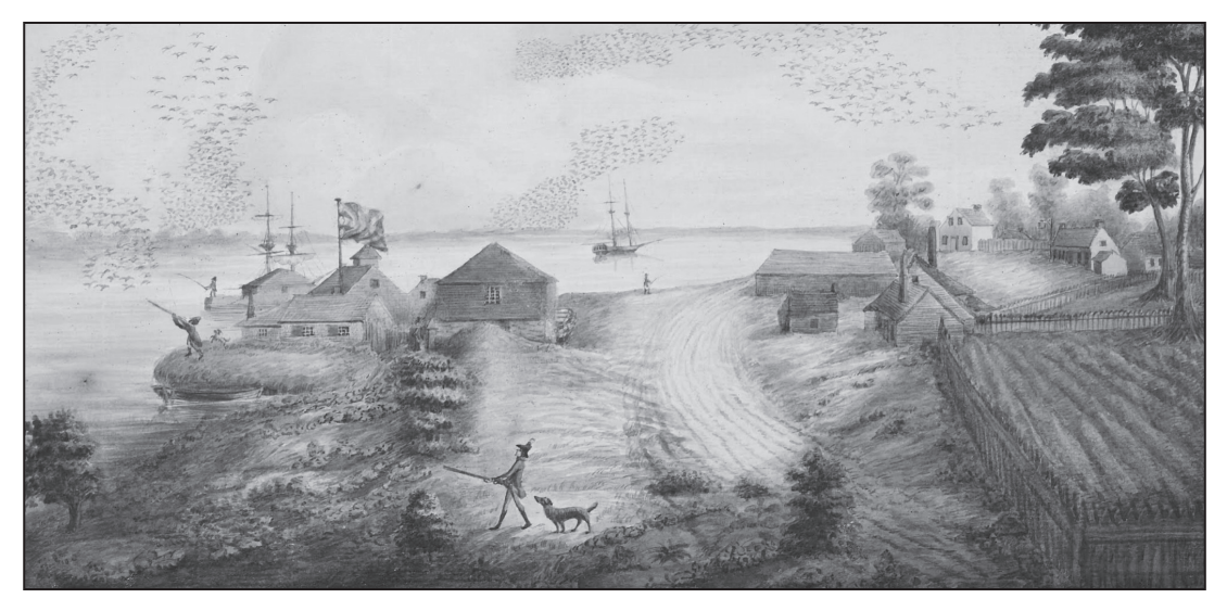
Figure 1: Edward Walsh, Old Fort Erie. Note the officers fishing in the background, the officers shooting in the foreground, and the vegetable garden to the right. (Royal Ontario Museum).

cultivate the necessary vegetables, which by any other means they would not be able to procure."<sup>27</sup> Similarly, Brock noted how, in 1803, soldiers at Fort George were employed to make a vegetable garden.<sup>28</sup> One osteoarchaeological study reiterates that British soldiers did, in fact, consume vegetables.<sup>29</sup> Vegetables were clearly consumed by British soldiers in Niagara and perhaps beyond, but what they ate specifically is much more un-