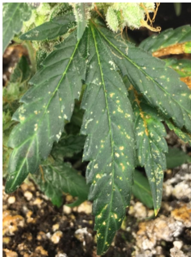
Figure 3. Example of leaf damage observed on the experimental plants and on production plants in the facility

infestation levels and final fresh yields, in addition to a possible reduction of total THC levels under high infestation. This study was preliminary and should motivate further experiments. As chemical means of control are very limited for indoor-grown cannabis, we recommend strict monitoring programs for indoor cannabis producers to avoid economic losses. We show that thrips potentially represent a major threat to product quality and yields. In this way, we suggest more research on cannabis pests to identify all pest species in various growing settings, including the range of damage they can cause and their economic thresholds. Only this can subsequently lead to the development of management programs and the development of safe and affordable control methods.