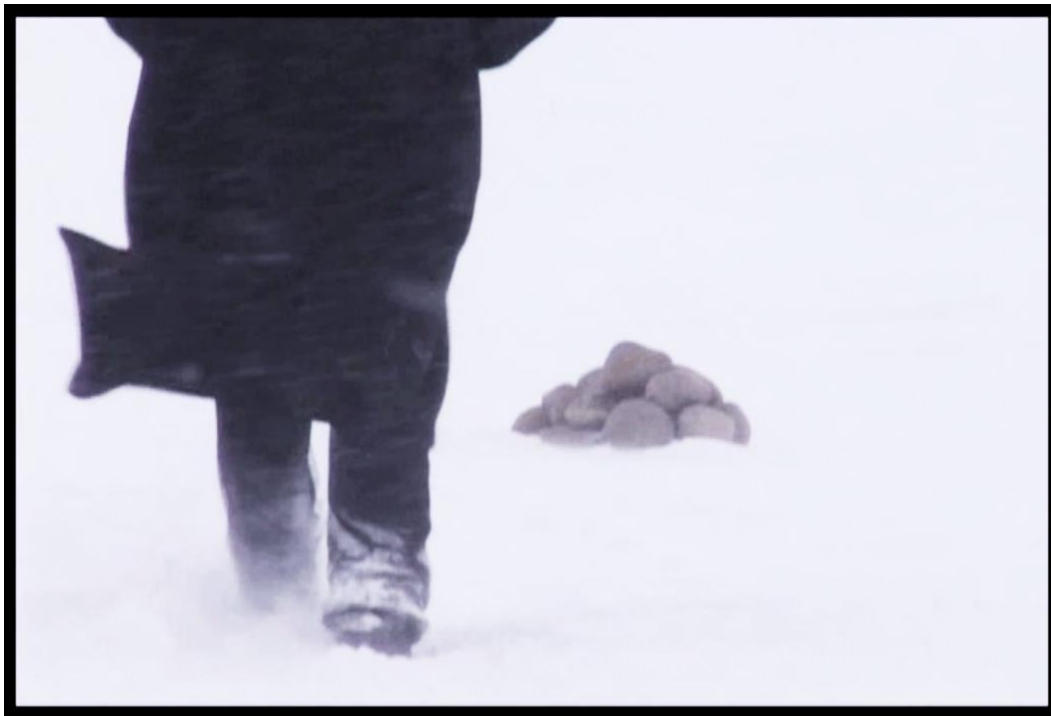
Leah Decter, Imprint (performance documentation) (2006).

The rectangle I pace traces my presence and labour and references the colonial process of reworking Indigenous land into property through imperial cartography, the staking of claim, and logics of possession. Scottish anthropologist Tim Ingold characterizes such delineations as “lines of occupation” inscribed by imperial powers “across what appears to be in their eyes . . . a blank surface” (2016, 81). Demarcations onto the land, envisioned as empty through the conceit of terra nullius , remain charted with purpose in settler states. These ideologically driven mappings are embedded within the terrain of Western culture as it has been imposed in these lands from the onset