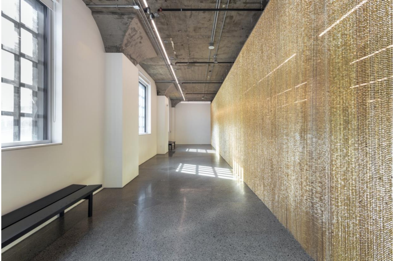
Felix Gonzalez-Torres, “Untitled” (Golden), 1995, installation view, MOCA Toronto. Copyright Felix Gonzalez-Torres Foundation. Courtesy of MOCA Toronto.