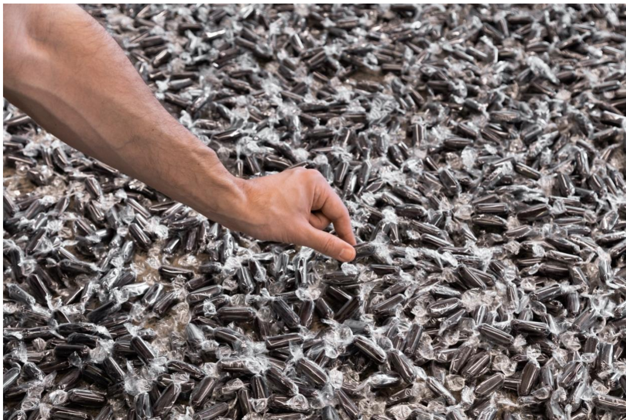
Felix Gonzalez-Torres, "Untitled" ( Public Opinion ), 1991, detail view, MOCA Toronto. Copyright Felix Gonzalez-Torres Foundation.

LMC. I'm so fascinated by the tension that might lie within the works. For example, what might it mean by having "Untitled" ( North ) and "Untitled" ( Public Opinion ) in the same sightline or having both Summer and Winter as iterations of the exhibition. When I was visiting here in May, I also noticed a theme or maybe a tension between light and dark in the show. I'm thinking about how "Untitled" ( Golden ) refracts natural light and has its own metallic glimmer or how "Untitled" ( North ) harnesses electricity and emits light itself. Even "Untitled" 1989 has a reflective sheen to it. Then, you pair that luminosity with "Untitled" ( Public Opinion ) and "Untitled" ( Shield ). While these pieces have a sparkling quality due to their plastic wrap, they are the two pieces that aren't inherently metallic or luminescent—"Untitled" ( Public Opinion )'s onyx-like candy base and "Untitled" ( Shield )'s matte finish, where even the beige background appears a bit more dull in contrast with the stark white museum walls. Perhaps, in contrast with the other pieces, these two pieces are a bit darker in hue and maybe even in affective tonality.