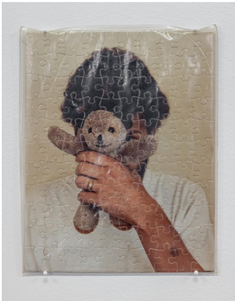
Felix Gonzalez-Torres, "Untitled" (Shield), 1990, installation view, MOCA Toronto. Copyright Felix Gonzalez-Torres Foundation.

LMC. Something you said during our first meeting really stuck with me: that death and grief can be life-affirming. Not only do I understand that personally, but that's so touching with regard to Felix's work. How might the phrase that death and grief can be life-affirming help us negotiate the presence of such deep loss in his work?