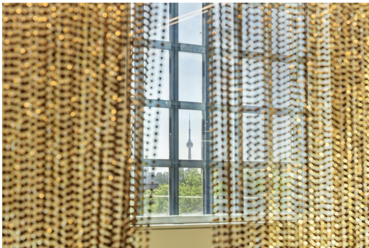
Felix Gonzalez-Torres, “ Untitled (Golden) ”, 1995, detail view, MOCA Toronto. Copyright Felix Gonzalez-Torres Foundation. Courtesy of MOCA Toronto.

LMC. In these pieces that blur the public and the private, communal and individual feeling, I wonder what belongs just to Felix and what belongs to the spectator, and as a curator, in organizing and curating the show, what might you want from the spectator for Felix?