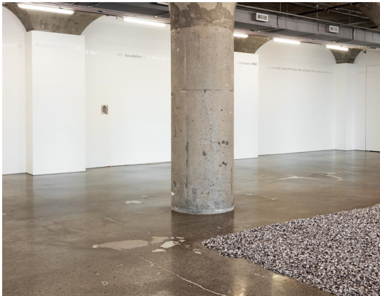
Felix Gonzalez-Torres, Summer , installation view, MOCA Toronto. Copyright Felix Gonzalez-Torres Foundation.

the light from the windows, the other pieces, and the above fluorescent fixtures reflect off the cellophane wrappers.