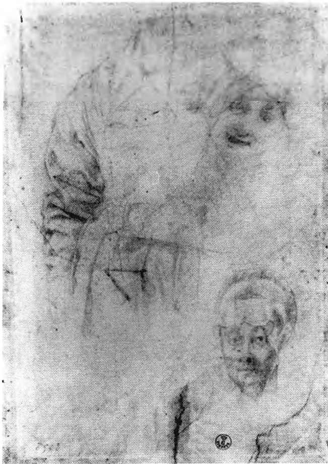
Figure 5. Pontorno (Jacopo Carucci), Maria Salviati , ca. 1543. Drawing, red chalk, 26.5 x 18.8 cm. Florence, Uffizi, Gabinetto Dis. e St. no. 6503F (Photo: from Edward S. King, "An Addition to Medici Iconography," Walters Journal , III (1940), Fig. 7).

by a retrospective ducal commission, about 1537-43, 37 it seems illogical that the propagandistic Duke would have had himself portrayed in childhood as sheltered, poorly dressed or anxious.