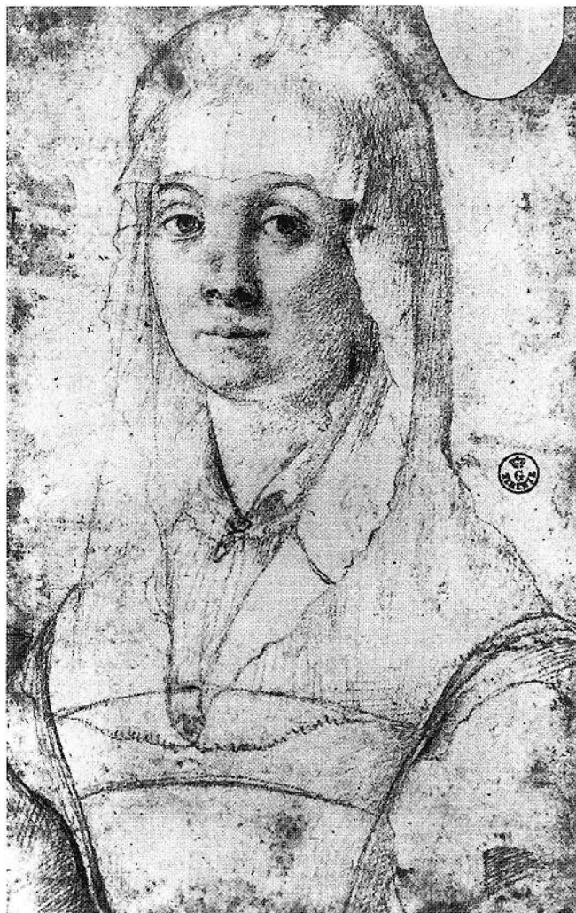
Figure 4. Agnolo Bronzino, Maria Salviati as a Young Widow, ca. 1527-30. Drawing, black chalk, 20.2 x 12.3 cm. Florence, Uffizi Gabinetto Dis. e St. no. 6680F.

the earliest date that can be proposed for the Baltimore portrait—exposing him for two years to powerful European interests. He was received officially by the Doge, the Papal Legate and the Venetian Council, and was presented to the ambassadors of France and England. 34 Cosimo's exile with her in Bologna shortly after allowed him to witness Clement's historical coronation of Charles V in 1529. 35 When the frugal Maria hesitated to attend the marriage of Caterina de' Medici in Marseilles in 1533, her father, Jacopo Salviati, urged her not to forgo this opportunity to keep Cosimo at the forefront of European interests. 36