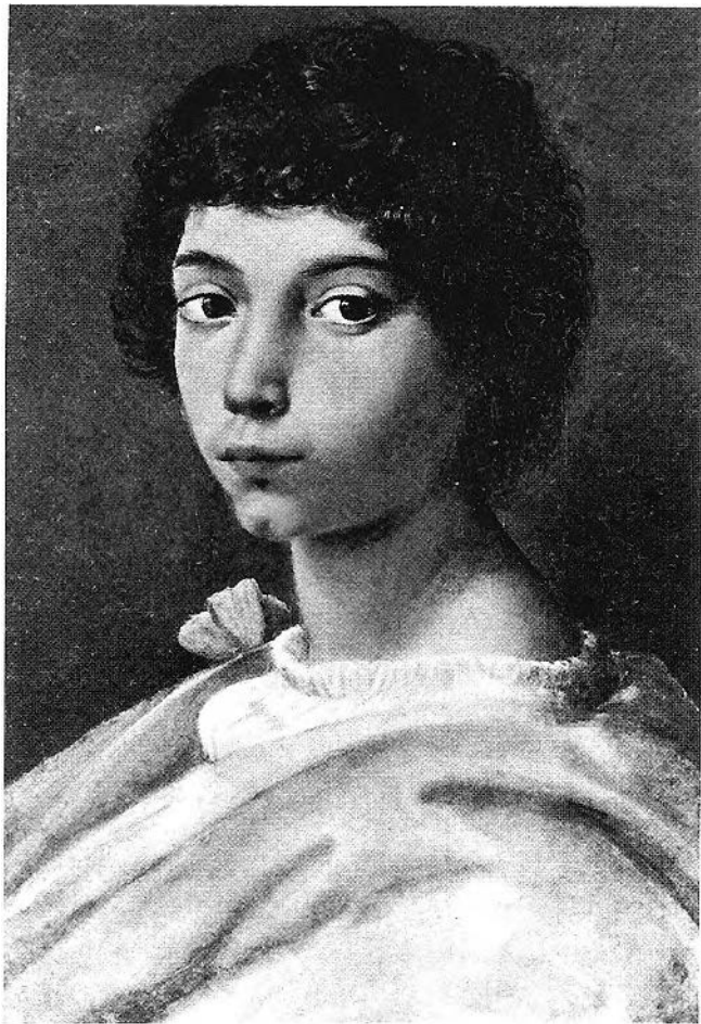
Figure 10. Giulio Romano?, Alessandro de' Medici as a Youth, ca. 1525. Oil on panel, 44 x 29.5 cm. Madrid, Thyssen-Bornemisza Collection, no. 330.

orphan. Her hand, reaching to Maria's, accords with Vives's directive to supply the guidance of an older matron for newly orphaned children. 97 Maria, as in Vasari's tondo, is portrayed in her role as mother of the Duke. Her pose and expression express her protective role over her charge.