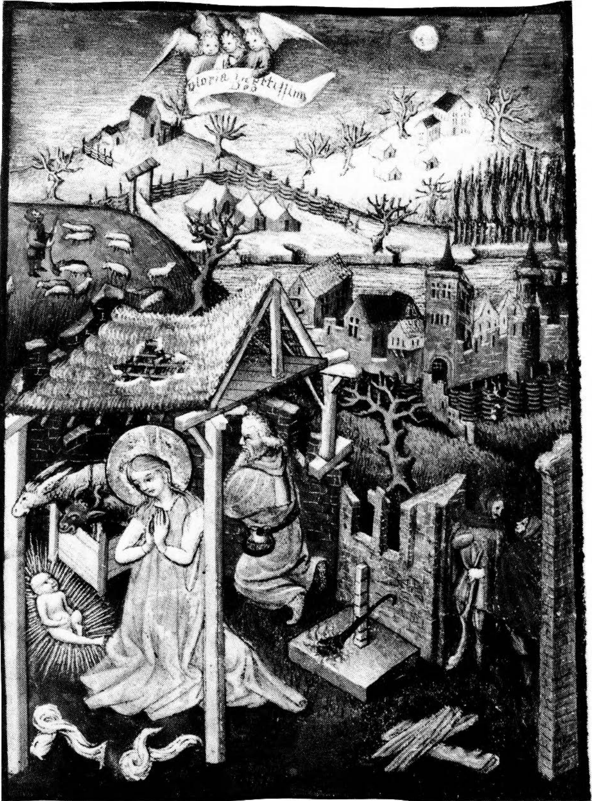
FIGURE 3. Nativity . Brussels, B.R., ms. IV 483, no. 2.