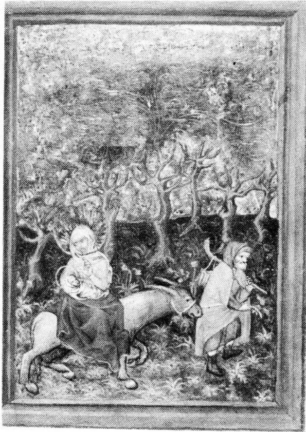
FIGURE 7. Flight into Egypt . Brussels, B.R., ms. IV 483, no. 5.

trees, travelling over a meadow whose flora is distinguished only by three thistle plants in bloom. Now, a lovely medieval legend tells of a stubborn ass who was tired and had not been fed once during the journey. 28 He is furious and complains bitterly to the Christ child. After hearing the beast out, Jesus bends down, breaks a thistle plant, and holds it up to the animal — to whose great astonishment the thistle tastes like honey clover and the finest herbs. Although it is unlikely that this story is represented in the Brussels illumination, the thistle in this Flight into Egypt may allude to the Passion. Similar symbolism is evident in a tapestry cushion from the Lower Rhine (Fig. 8), possibly Cologne, in which the framing of its central medallion is fashioned of thick intertwined stems from which thistle leaves and blooms grow, gradually increasing in size towards the edge of the