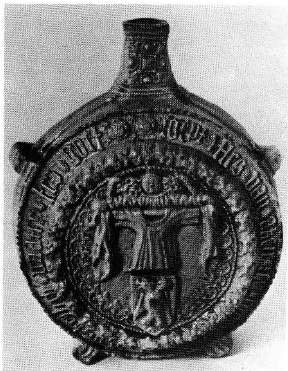
FIGURE 5. Pilgrim's flask . Schloss Cappenberg, Museum für Kunst- und Kulturgeschichte Dortmund.

Arbor vitæ and Lignum vitæ . It would go beyond the scope of this study to trace the subtly conflated and complex imagery back to its roots in the description of the tree of knowledge and the tree of life growing in paradise (Genesis, 2:9). Later they are interpreted as symbols of sin and redemption respectively. The Greek church father Irenæus (died ca. 202) preached: "In arbore perivimus, in arbore redempti sumus; in ligno mors, in ligno vita pependit" (Sermo 84,3). Four hundred years later Venantius Fortunatus (died ca. 600), like Irenæus living for a time in Gaul, wrote the verses of the hymn Pange lingua , familiar to all through its use in the liturgy. The "doctor seraphicus," St. Bonaventura (1221-74), meditates in his Lignum vitæ on Christ's sacrifice whereby the tree of the cross becomes identical with the tree of life. His treatise was especially loved by the German mystics and drawn upon for their sermons. In his well known hymn Laudismus de Sancta Cruce he calls it the raft of salvation, the tree of life, the sacred wood. The Franciscan movement, which also clearly did most to promote devotional Marian hymnody, put forward with great zeal the concept of the compassio Mariæ , of Mary's own share in the suffering of Christ's Passion and death.