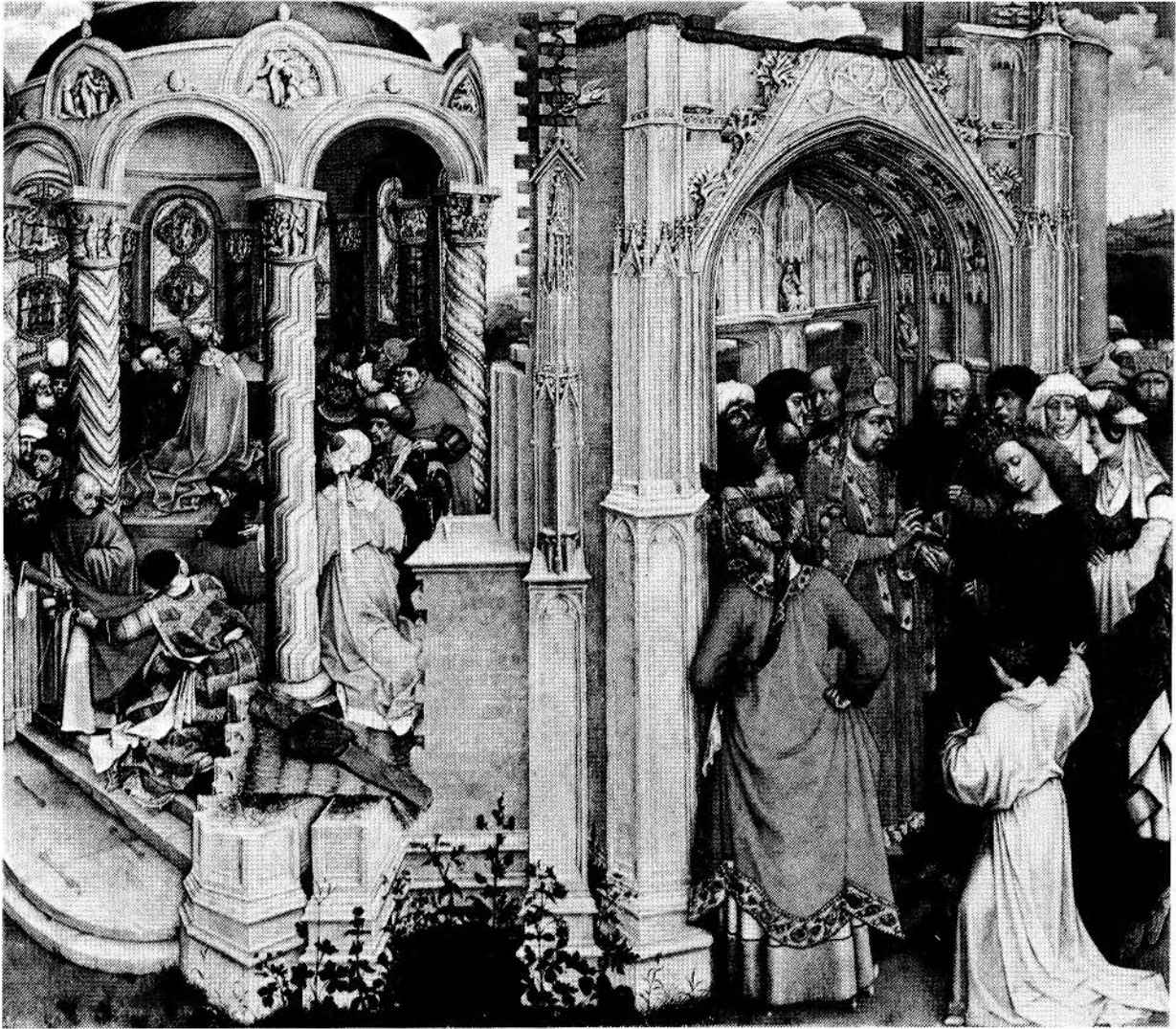
FIGURE 6. Robert Campin, Betrothal of the Virgin . Madrid, Prado.

I also suggest that the Virgin (not turned towards her husband during the marriage ceremony but rather in the direction of those symbols, and standing on their level of depth in the picture) expresses an inner awareness of the destiny of her yet unborn son. The representation of the symbols, disguised but visually prominent, is quite similar in the Brussels Nativity . 27