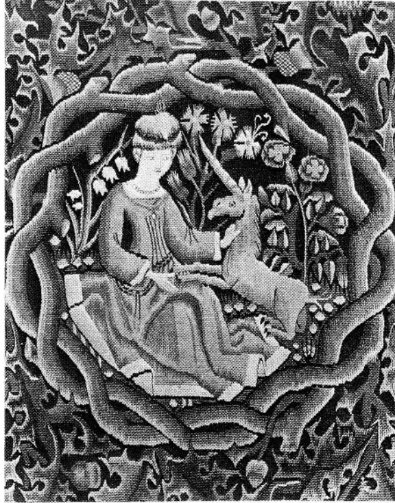
FIGURE 8. Unicorn Cushion . Berlin, Schlossmuseum.

and beast in the medallion, support the interpretation: lilium convallium and rosa inter spinas are the trusted attributes of the Virgin Mary, but the three blooming pinks between them rather allude to the nails of the Crucifixion (and are so used by Hugo van der Goes in the Portinari Altarpiece). Furthermore, their German name is Naeglein , meaning little nail. Thus, the connection between thistle, Passion, and Mary becomes clear. Assuming that it also stands behind the plants in the Brussels Flight into Egypt , one understands why the Virgin points to her son with such a