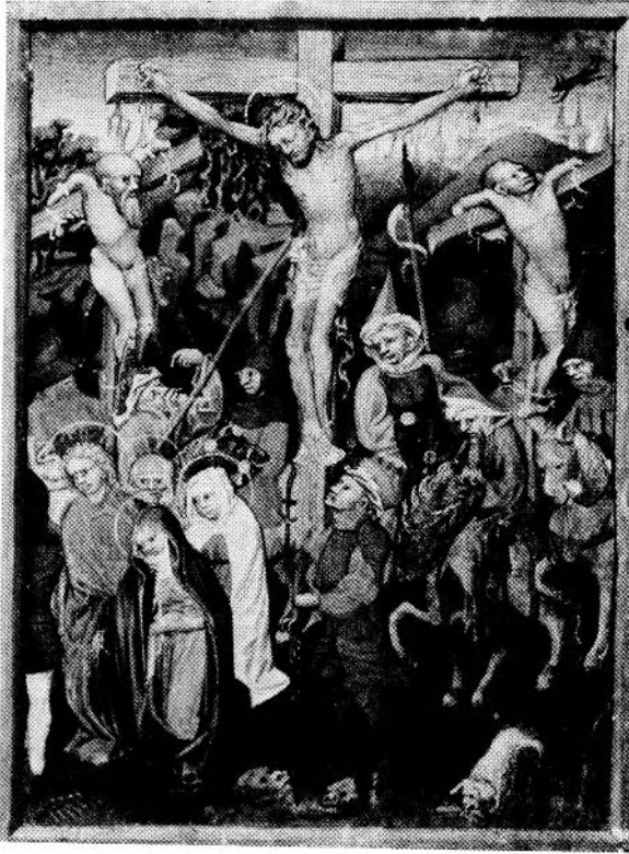
FIGURE 1. Crucifixion . Brussels, B.R., ms. IV 483, no. 22.

ment Apocrypha, the Meditations on the Life of Christ of the Pseudo-Bonaventura (J. de Caulibus?), 7 and the Revelations of Saint Birgitta of Sweden, there are elements which seem to point out that the artist of the miniatures was partly inspired by contemporaneous passion plays. A two-storey brick and timber structure is quite unusual for a depiction of the Massacre of the Innocent Children, but it accords well with the theatre practices of the time. 8 Christ before Annas and the Flagellation (Fig. 2) feature ruined architecture behind which a crane or pulley appears, and it is well known that such hoisting mechanisms were used in the staging of contemporaneous mystery plays. In the page of the Noli me Tangere one notices in a relatively well rendered landscape a picket fence