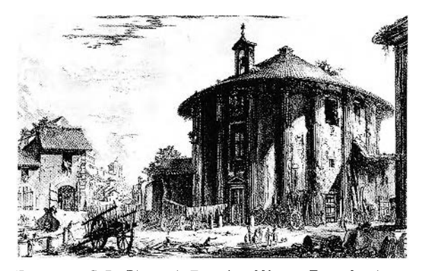
FIGURE 1. G.B. Piranesi, Temple of Vesta. From Levit.

The prints of Giovanni Battista Piranesi combined the archaeologist's passion for accurate observation with a love of grandeur, mystery, and fantasy. Herschel Levit chose forty-one plates by Piranesi, largely from his Vedute di Roma (1748 ff.), and photographed the same views in order to contrast eighteenth-century Rome with the contemporary city. The etchings and the photographs are reproduced side by side with comments by the author. They are introduced by a brief biography of Piranesi and notes on his style and methods of work.