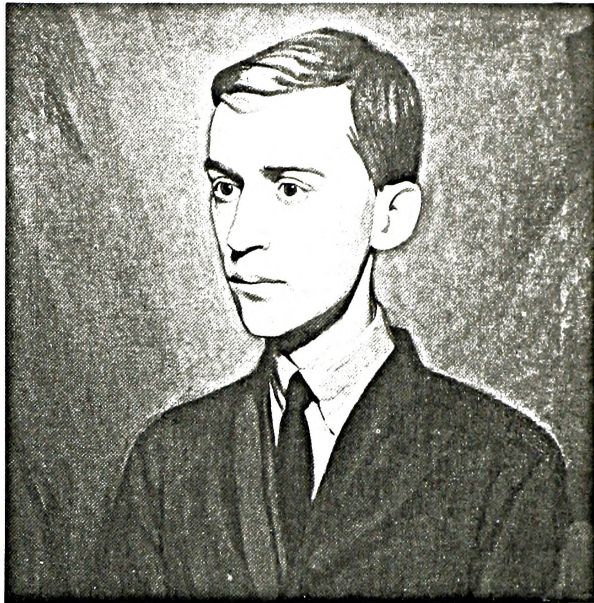
FIGURE 5. Lawren Harris, Thoreau MacDonald , ca. 1920. West Palm Beach, Collection Mr. E.R. Hunter.

face, the austere colour scheme, and the large unbroken area of green against which the figure is silhouetted. No drawings or preliminary sketches are known. The troubled gaze is that of a man who once in a sermon applied to himself the words of St. Paul: 'When I was persecuted in one city, I fled to another.' 19 The face absorbed in thought and the eyes looking far away could be said to express the vision of the author of The New Christianity , who argued that the distinctive task of the age was to abolish modern capitalism in order that democracy be fully realized. 20 The portrait is certainly a most successful attempt at representing the whole man, his character, and his historical significance.