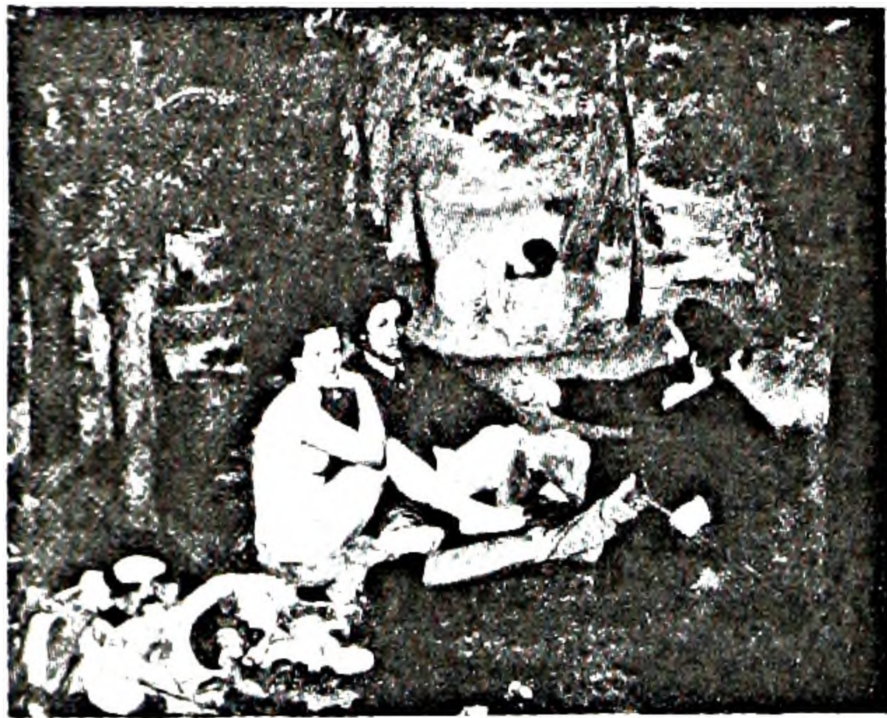
FIGURE 1. Manet, Le Déjeuner sur l'herbe.

been rendered respectable by time became a marvellous 'incongruity' when put into Manet's own era. Manet's wit and satiric spirit, referred to by his contemporaries, too rarely come into art historical considerations of his work.