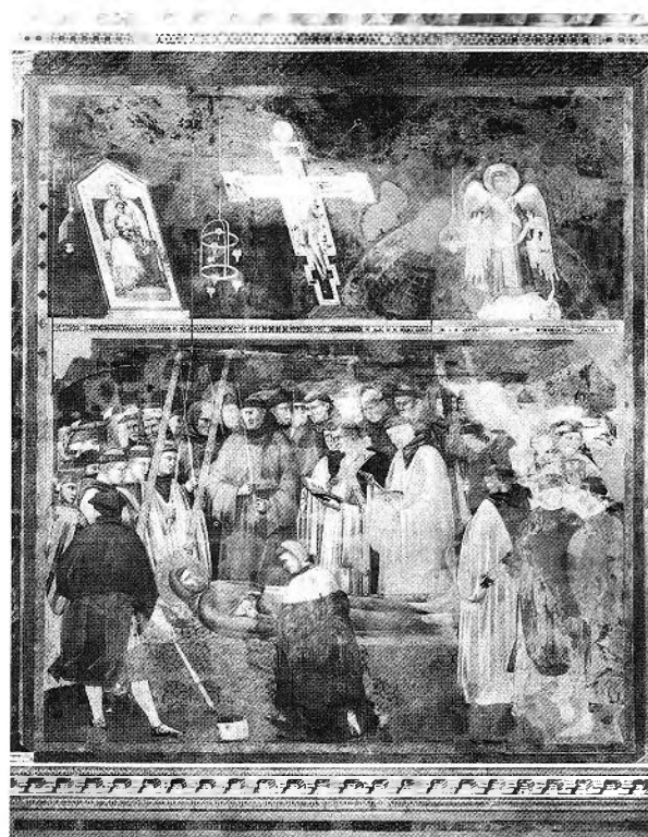
FIGURE 2. Verification of the Stigmata of St. Francis , late 13th century. Assisi, San Francesco.

Cut-away crucifixes have traditionally been associated with the fifteenth century and their origin with Lorenzo Monaco. 3 In the Cortona panel, however, we discover an example that is