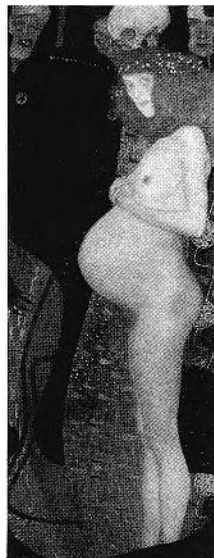
FIGURE 2. Gustav Klimt, Hope I, 1903. Ottawa, National Gallery of Canada.