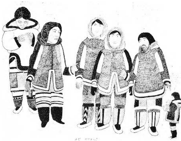
FIGURE 3. Peter Pitseolak. Untitled (reconstruction of past family event). Graphite, coloured pencil, and felt pen on paper, 50.7 × 65.5 cm. Cape Dorset (Baffin Island), West Baffin Eskimo Co-operative.

watercolours were Inuit figures with magazine photograph faces pasted on in a most amusing way; in both media, repetitiveness became a hallmark, not because Pitseolak was lazy, but because, uninfluenced by our notions of artistic creativity, he believed that if he 'got it right' in one composition, the same image would serve in the next.