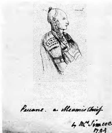
FIGURE 3. Paccane, a Meamis Chief. Reputedly drawn and etched by Elizabeth Posthuma Gwillim Simcoe, 1793-94. Not in exhibition. Ottawa, Public Archives of Canada.