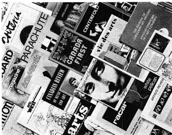
FIGURE 2. The Art and Pictorial Press in Canada . Montage of magazines, used as a display panel and as the cover of the publication.

section showed some nineteenth-century illustrated magazines (most were not art magazines at all, such as the British American Cultivator and the Canadian Illustrated News ); another had 40 titles from Québec (Fig. 3; why isolate one province? – the division was geographical, not linguistic); others presented specialty magazines: 13 artists' journals, 6 publications of museums and art galleries, 11 on photography, and 17 on architecture. Finally, a catch-all section unexplicably titled 'An alternative space' showed 38 titles, including such diverse publications as RACAR , Artmagazine (a glossy journal of contemporary art), Canadian Forum (a general-interest magazine), and The Beaver (a publication on northern affairs). This selection underscored the basic confusion of the exhibition. By displaying the art and pictorial presses side by side, the organizers ensured ample representation but lost coherency.