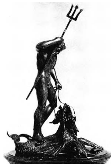
FIGURE 5. Neptune on a Sea Monster, bronze, hollow cast, H. to top of figure 33.9 cm. Italian, early 16th century, by Severo da Ravenna, The Frick Collection, New York, Inv. 16.2.12.

The Toronto bronze also seems to have some characteristics, such as the simplified modelling of the limbs, common to the numerous Neptune figures attributed to Severo di Ravenna. The best among these is that from the Frick Collection in New York (Fig. 5). 11 Its boneless forearms and smooth untextured hands appear in an even more summary manner in the St. Jerome and in the workshop Neptunes such as the one from the Museo Nazionale, Florence, referred to in a recent article by Bertrand Jestaz. 12 There are some further points of comparison between the St. Jerome and a bronze St. Christopher in the Louvre which Jestaz attributed to Severo in the same article. These are most evident in the treatment of details of hair and beard, the modelling of limbs and, to a certain degree, the drapery styles. Such generic similarities are normal to the style of a given workshop, but when individual bronzes are examined in terms of the specifics of their modelling and casting, one sees slight differences and variations which may indicate different