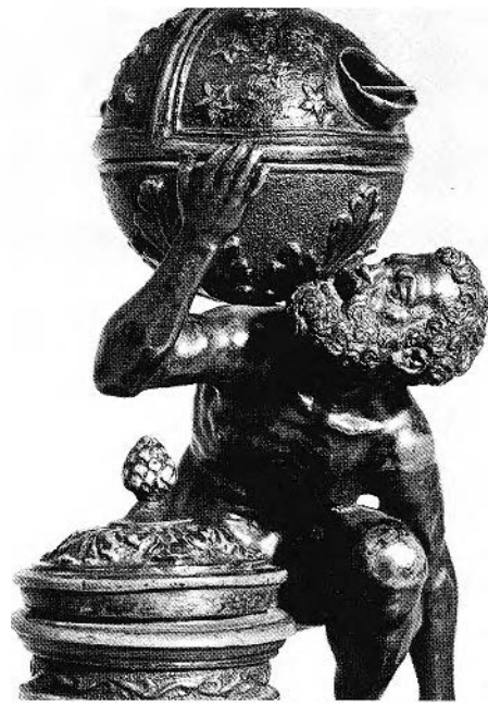
FIGURE 6. b) Atlas Supporting the Globe of Heaven (Detail of Figure 6 a).

R.O.M.'s figure is more comfortably accommodated among those bronzes which are now generally, though as yet by no means conclusively, grouped around Severo di Ravenna. It is possible of course that some works among them may be related to a distinguishable if anonymous workshop hand. It is interesting in this light to be aware of some similarities apparent between the St. Jerome and a group of Atlas figures supporting the globe of heaven, which, although considered to derive from a Riccio model, could equally well have been cast in another workshop. 16 The tension in the pectoralis major muscles of the Atlas figures, as well as the ridge-like stylisations of the latissimus dorsi muscles find an echo in the coarser musculature of the torso of the St. Jerome . The protruding eyeballs of the Atlas bronzes, the stylisation of anatomical features within the arms, hands, chest and back are all perhaps as close to bronzes now attributed to the Severo workshop as to Riccio's. This is seen in the details of the Frick Atlas (Fig. 6 a-b) whose stand, for example, has ornamental details of the same form and style as those associated with writing caskets, such as that in the Cleveland Museum of Art, now attributed to Severo. 17 What is equally important is that the lid of the urn on the base of the Frick piece is of the same type as that appearing with the Museo