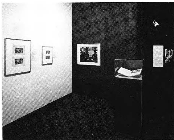
FIGURE 1. Reflections in a Quiet Pool , view of installation.

rubrics. Finally, and perhaps most problematically, Milne's art is evolutionary and intellectual in character: in style and in content it avoids emotion and narrative. Considered together these reasons explain the enigma of Milne's current status. Canadian art historians, the few that there are, usually agree that Milne is among the finest Canadian creators, although these historians often base their judgment on knowledge of a few works rather than detailed analysis of his oeuvre. Gallery-goers, on the other hand, are usually mystified by, indifferent to or ignorant of Milne's subtle formal pieces. This exhibition and attendant catalogue address these problems.