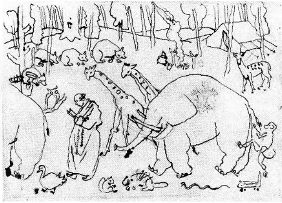
FIGURE 4. David Milne, The Saint (Milne?), 1944. Transfer drawing for an unpublished colour drypoint (cat. 84).

on which these colours and forms glow. These effects also appeared in his paintings and drawings, works Milne called 'memory pictures'. Done rapidly with the precise elements reduced to an absolute minimum such that they were 'furthest from the realistic,' Milne was still seeking 'a strong kick from the subject (p. 126).' Interestingly he never broke completely with nature as the source of his art; he never went completely abstract.