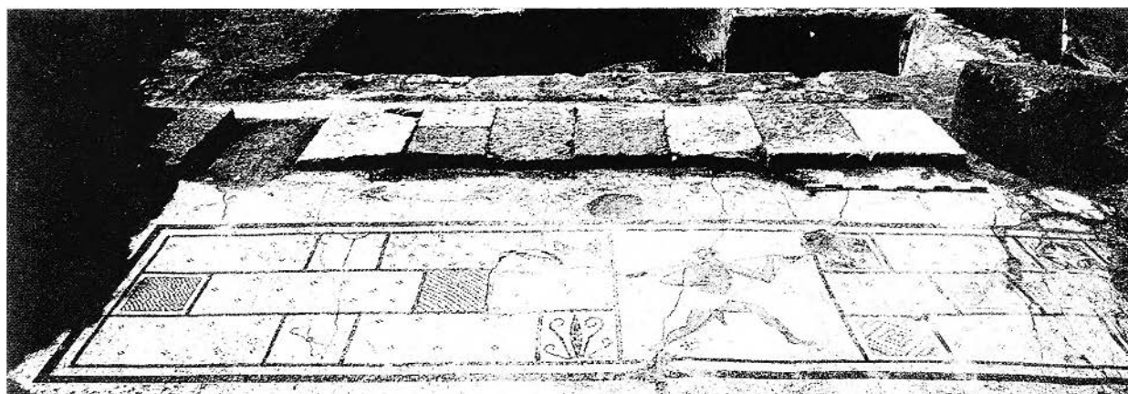
FIGURE 2. The House of the Calendar, Corridor of the Negro Fisherman, Antioch. (After D. Levi, Antioch Mosaic Pavements (Princeton, 1947), II, pl. 7a.

David Parrish, Purdue University, followed with The Mosaic Program of the Maison de la Procession dionysiaque at El Jem (Tunisia) . All four of the figural mosaics allude to Dionysos and/or the Four Seasons, with the personification of the year, Annus, included in one instance. The mosaics were discussed and the interpretation of the building by Louis Foucher as the site of a Dionysiac cult questioned. A close examination of the