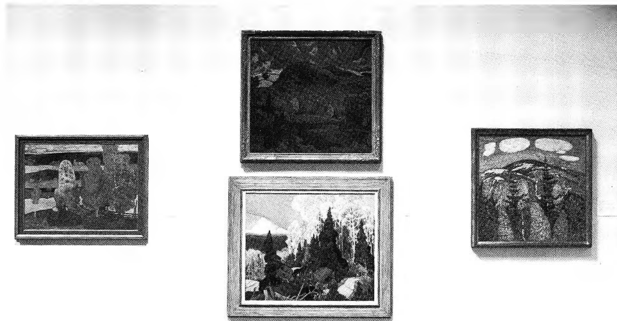
FIGURE 3. The Mystic North, works by Helmer Osslund (98/51), J.E.H. MacDonald (77/122), Franklin Carmichael (3/123) and Marsden Hartley (44/136).