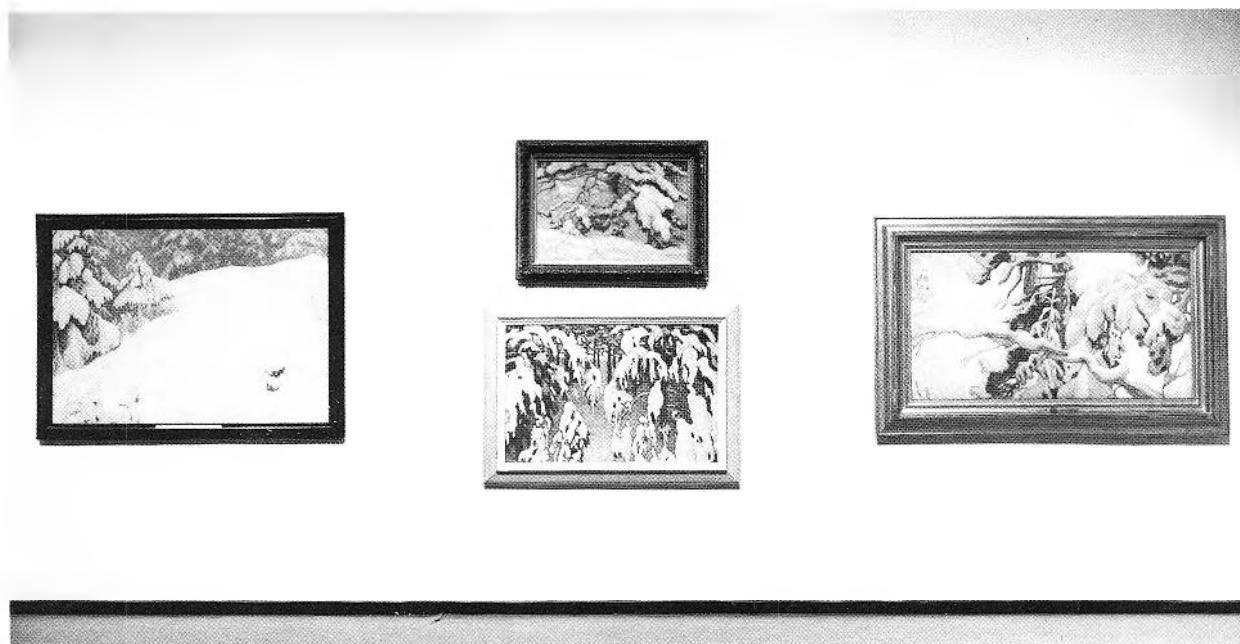
FIGURE 1. Installation view of The Mystic North, Art Gallery of Ontario. Works by Gustaf Fjaestad (19/45), J.E.H. MacDonald (69/108), Lawren Harris (37/109) and Akseli Gallen-Kallela (28/30). Numbers refer to the catalogue, followed by plate numbers corresponding to the publication.