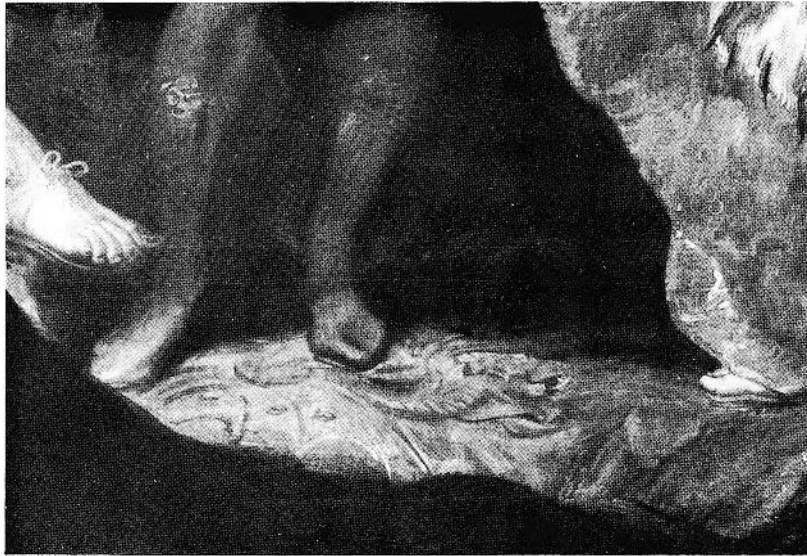
FIGURE 3. Van Dyck, The Continnence of Scipio (detail). Oxford, Christ Church Museum.

if van Dyck may not also have had another design in mind, viz. The Procession of the Doge in Venice , published in eight woodcut blocks after an anonymous designer by Matheo Pagano, Venice, ca. 1555-60 (cf. D. Rosand and M. Muraro, Titian and the Venetian Woodcut , 1976-77). The Venetian woodcut (Fig. 2), unlike the Gheeraerts etching, includes female spectators in loggie above the arches, as one sees also in the van Dyck.