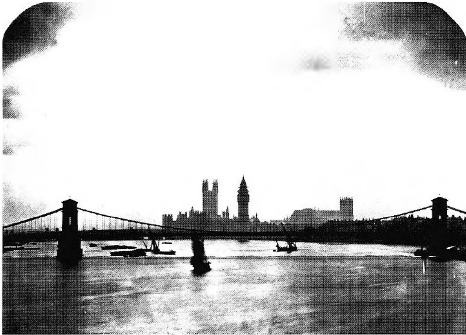
FIGURE 1. Roger Fenton, Houses of Parliament under construction. London, 1858(?).

States, Canada and France spoke on various topics: the photograph as part of the popular myth-making process; as a useful tool in architectural restoration and archaeology; and as part of recent campaigns such as the DATAR project in France, heir to the original 1851 Mission héliographique. Apart from simple problems of audibility due to the noise level of the simultaneous translation, the tone of the proceedings tended to be one of experts and initiates addressing one another rather than the general audience. One would have liked more discussion like John Szarkowski's about what constitutes 'good' architectural photography. Szarkowski contrasted the serendipitous 'Sunday' photographer of buildings with the professional whose 'Monday' shots are all in a week's work. Such an understanding – no doubt in part intuitive and oversimplified as presented by Szarkowski – was either not referred to at all or somehow taken for granted. Such issues so basic to an emerging area of scholarly interest must be continually defined and redefined. Nevertheless, the National Gallery is to be commended for the symposium and for distributing a sheet describing the technical photographic terms that can be so confusing to a novice. The glossary was available free of charge to visitors in the galleries.