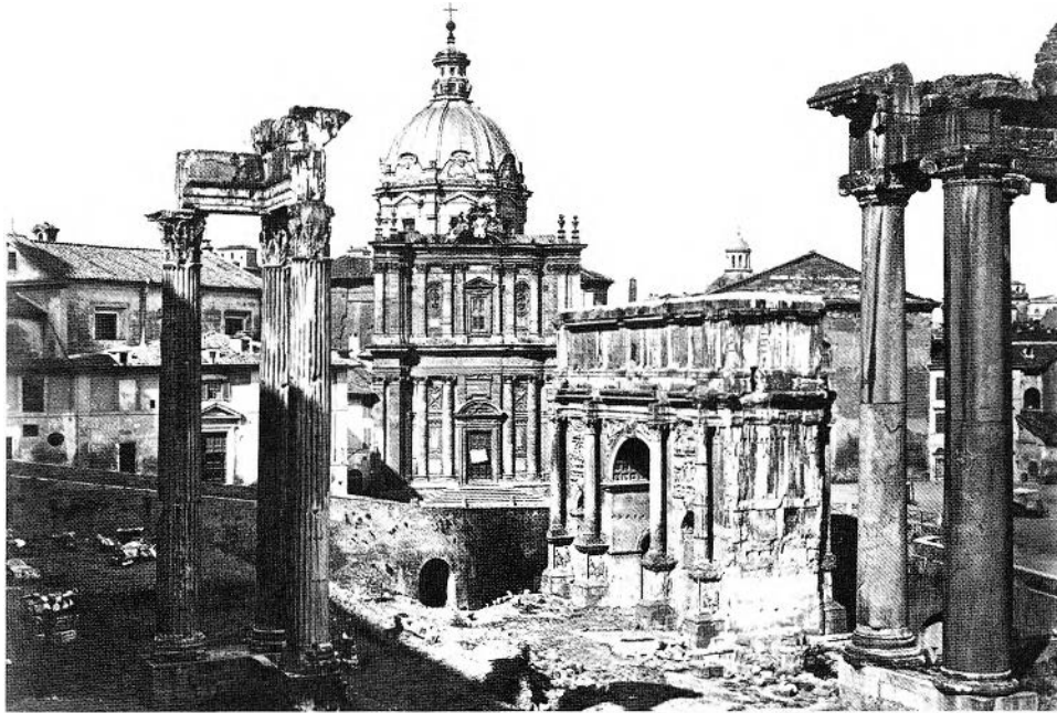
FIGURE 2. Auguste-Rosalie Bisson, Roman Forum and Church of SS. Luca e Martina . Rome, before 1864.

the focus of much photographic activity. A view by Auguste-Rosalie Bisson (Fig. 2), taken across the Forum Romanum to the Baroque façade of SS. Luca e Martina, is dense with historical information. It is as multi-layered in a horizontal sense as the archaeological strata shown descending vertically in the foreground of the composition. A zigzag overlapping of the colonnades and triumphal arch with the background forms an open invitation to explore the depths of the image – amazingly ‘legible’ right down to the proclamation nailed to the church door. Similarly, on the Athens Acropolis, the American William James Stillman recorded the north porch of the Erechtheion in the manner of a painting by Paolo Uccello. The way the beams form perspectival orthogonals into the picture plane reminded me of Uccello’s Battle of San Romano . But thanks to the new wet-collodion glass plate technique, Stillman could develop sharply etched tonalities of grey richer than any Renaissance grisaille. The cut-off marble beam ends have an almost palpable, brain-like texture to them. Excellent though the reproduction in the catalogue is (pl. 65), it is no substitute for the experience of entering into the silvery sheen of Stillman’s original albumen print. Here is what I take to be an exemplification of art historian James Ackerman’s definition of an ideal architectural photographer: ‘He should love buildings more even than he loves photography’ ( Art Bulletin , XLIII, 1961, p. 75).