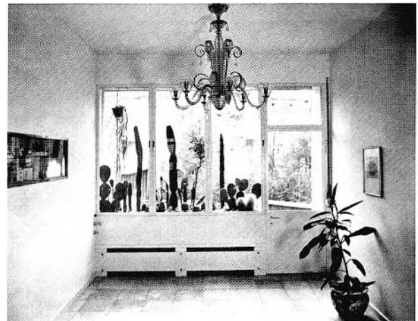
FIGURE 3. Werner Mantz, Villa, Maarenburg, Cologne . 1928 (Photo: Centre Canadien d'Architecture / Canadian Centre for Architecture, Montréal).

If the foregoing analyses tend to suggest that Photography and Architecture had a dated, sepia cast to it, let me choose another example for contrast (Fig. 3). It is twentieth-century in date, shows an interior rather than an