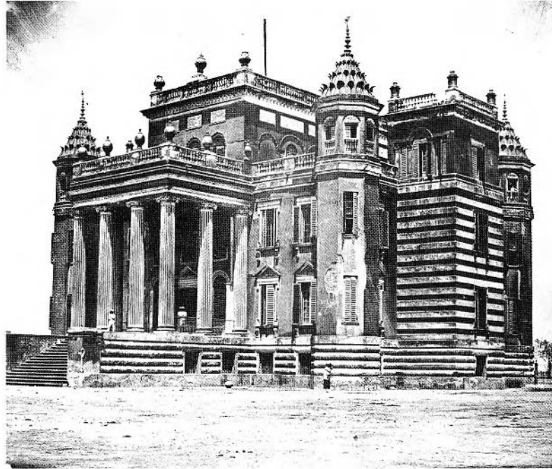
FIGURE 4. Felice Beato, The Dilroosha Palace, Lucknow . 1858. (Photo: Centre Canadien d'Architecture/ Canadian Centre for Architecture, Montréal).

geometric, 'primitive' shapes. They were among the favourite house plants of avant-garde architects. One sees them on the ledge of Walter Gropius' own living room in the Bauhaus complex at Dessau. What possible meaning can be attached to these spiky plants in such spartan settings? Obviously photographs can lead to interesting speculations that touch on social or psychological issues.