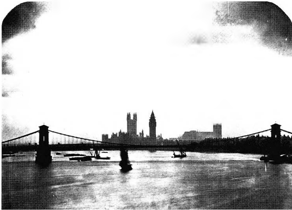
FIGURE 1. Roger Fenton, Houses of Parliament under construction. London, 1858(?).

States, Canada and France spoke on various topics: the photograph as part of the popular myth-making process; as a useful tool in architectural restoration and archaeology; and as part of recent campaigns such as the DATAR project in France, heir to the original 1851 Mission héliographique. Apart from simple problems of audibility due to the noise level of the simultaneous translation, the tone of the proceedings tended to be one of experts and initiates addressing one another rather than the general audience. One would have liked more discussion like John Szarkowski's about what constitutes 'good' architectural photography. Szarkowski contrasted the serendipitous 'Sunday' photographer of buildings with the professional whose 'Monday' shots are all in a week's work. Such an understanding – no doubt in part intuitive and oversimplified as presented by Szarkowski – was either not referred to at all or somehow taken for granted. Such issues so basic to an emerging area of scholarly interest must be continually defined and redefined. Nevertheless, the National Gallery is to be commended for the symposium and for distributing a sheet describing the technical photographic terms that can be so confusing to a novice. The glossary was available free of charge to visitors in the galleries.