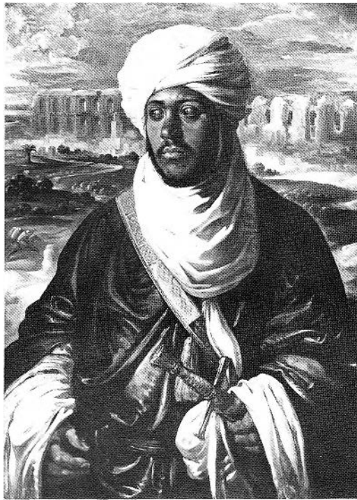
FIGURE 3. Peter Paul Rubens, The King of Tunis , ca. 1620. Canvas, 100.3 × 71.1 cm. Boston, Museum of Fine Arts.