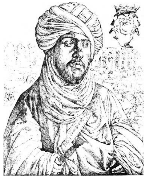
FIGURE 4. Jan Cornelisz Vermeyen, Muly Ahmad , ca. 1536. Etching, 495 × 377 mm. Amsterdam, Rijksprentenkabinet.

allowed him to escape. Charles then restored to his throne Muly Hasan, a notoriously cruel and corrupt ruler as well as an Infidel. Furthermore, Hasan's period of renewed tenure as vassal of Charles v was shortlived, for in 1542 his equally cruel son Muly Ahmad blinded and deposed him. 13