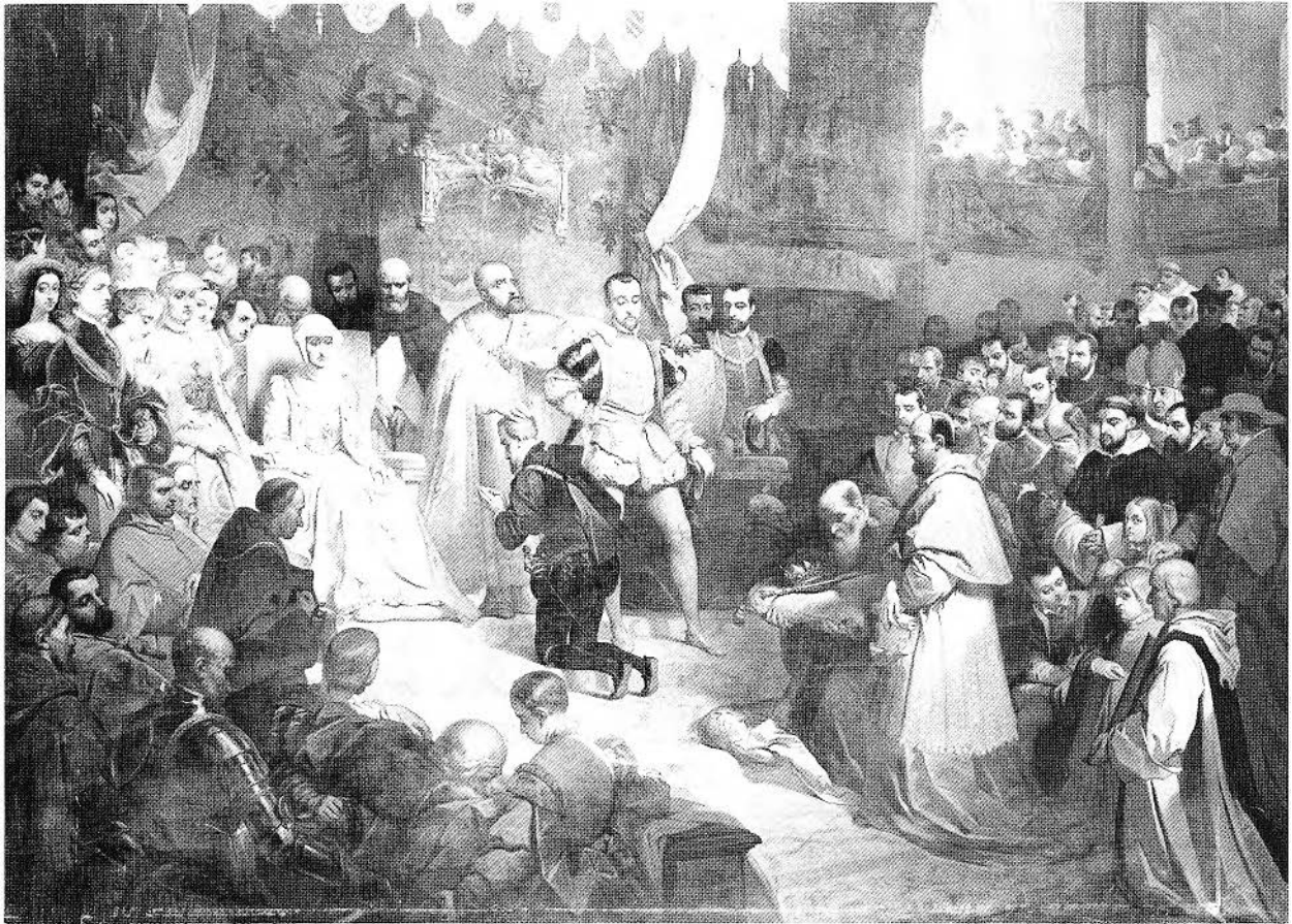
FIGURE 2. Louis Gallait, The Abdication of the Emperor Charles v. 1842. Canvas, 121 × 170 cm. Frankfort on the Main, Städtelsches Kunstinstitut.

of exotic objects and animals. The armadillo, for instance, is native only to South America. The three crowned women in the right background hold banners with the arms of the seventeen provinces of the northern and southern Netherlands, and of Charles' Spanish and Italian possessions.