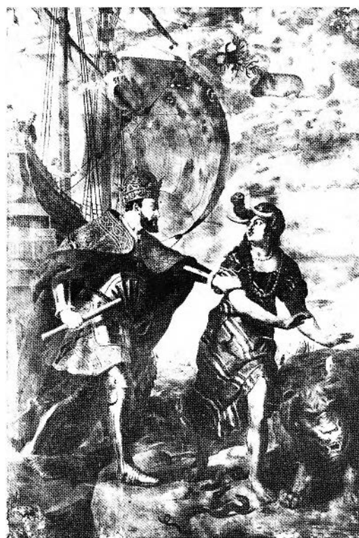
FIGURE 5. Gaspar de Crayer, Charles v Conquers Africa . 1635. Panel, 459 × 304 cm. Ghent, Museum van Bijloke.

In addition, the connection between Charles v and his great progenitor Scipio Africanus is spelled out by means of a depiction of the triumph of Scipio. Doubtless the hope expressed by these paintings was that Ferdinand would smile on Ghent and re-establish the unity and prosperity of the mid-sixteenth century, thus earning him a place in the ranks of such heroes as Charles and Scipio. 23