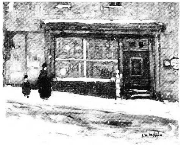
FIGURE 2. J.W. Morrice, The Barber shop , ca. 1905. Oil on canvas, private collection, Montreal.

Of the numerous canvases of the quays along the Seine there are only three examples (including the two from the Musée d'Orsay, Paris), yet this subject remained a constant fascination for Morrice throughout his career, and his treatment of it up to, and including, the loosely brushed bookstalls possibly painted after the First World War (Fig. 3) would have given us the occa-