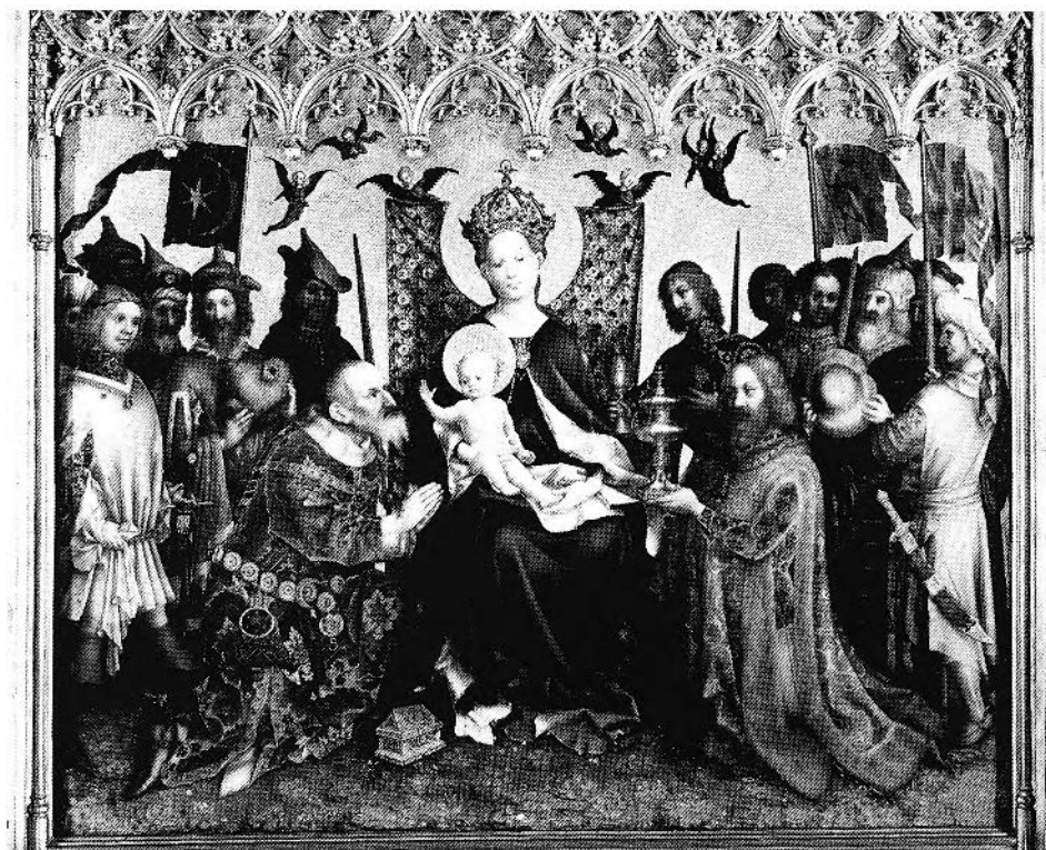
FIGURE 37. S. Lochner, Adoration of the Magi , centre panel, Cologne, Cathedral.