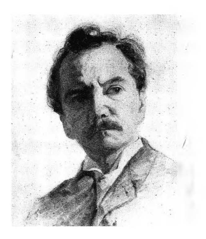
FIGURE 145. Samuel Joseph Bloom Varley, ca. 1912. Charcoal on paper, 38.1 × 37.0 cm., Ottawa, National Gallery of Canada. Reproduced courtesy of F. H. Varley Estate, Mrs. Donald McKay (Photo: National Gallery of Canada).