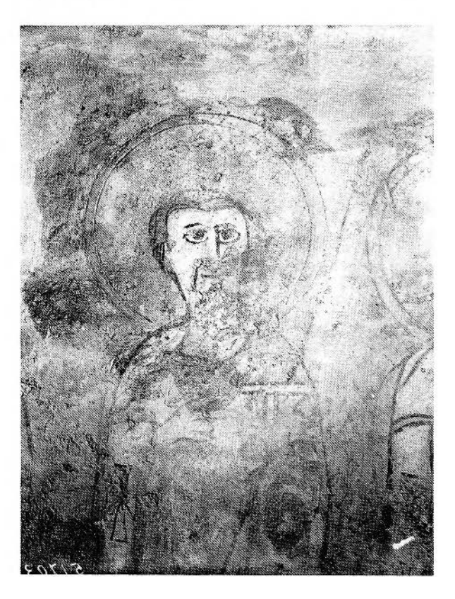
FIGURE 3. St. Lawrence, S. Maria Antiqua, Rome.