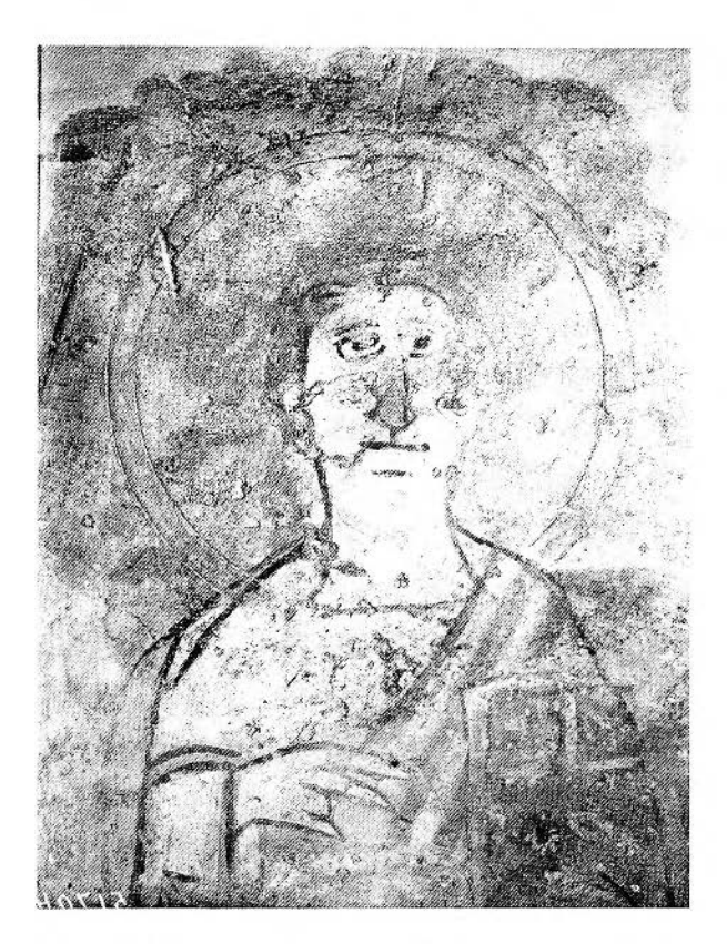
FIGURE 1. Anonymous saint, S. Maria Antiqua, Rome.