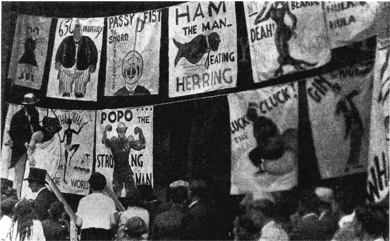
Figure 3. Workers Laboratory Theatre. A political side-show. Reproduced from Workers Theatre , II (August 1932), cover.

technique and artistry, on the one hand, and propaganda, on the other, continued to be debated. At a symposium on workers' theatre in 1931, it was reported that a discussion raised the issue of "art, aesthetics, expressionism and other high-falutin'isms" versus the utilitarian goal of workers' theatre, with the writer observing that "all the so-called arts of the theatre should be determined by this theatre [ sic ] utilitarianism." 52 The issue also appeared at the Spartakiade of 1932, where one workers' theatre group was criticized for having "sinned to some extent on the side of intellectual and poetic diction." 53 Similarly, a review of We Demand by the John Reed Club of Philadelphia, which won third prize in the competition, reveals the technical and artistic weaknesses that often typified agitprop productions: