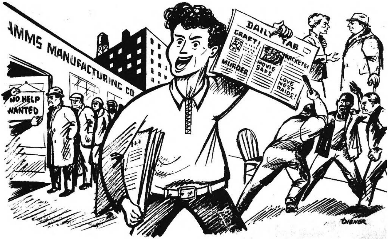
Figure 4. Impressions of Newsboy , staged by Workers Laboratory Theatre. Reproduced from New Theatre , 1 (March 1934), 9 (Courtesy of the author).

ter.” 56 Newsboy , the winning play performed by the Workers Laboratory Theatre, was described as employing visual counterpoint or montage, 57 as suggested by a drawing of the performance (Fig. 4).