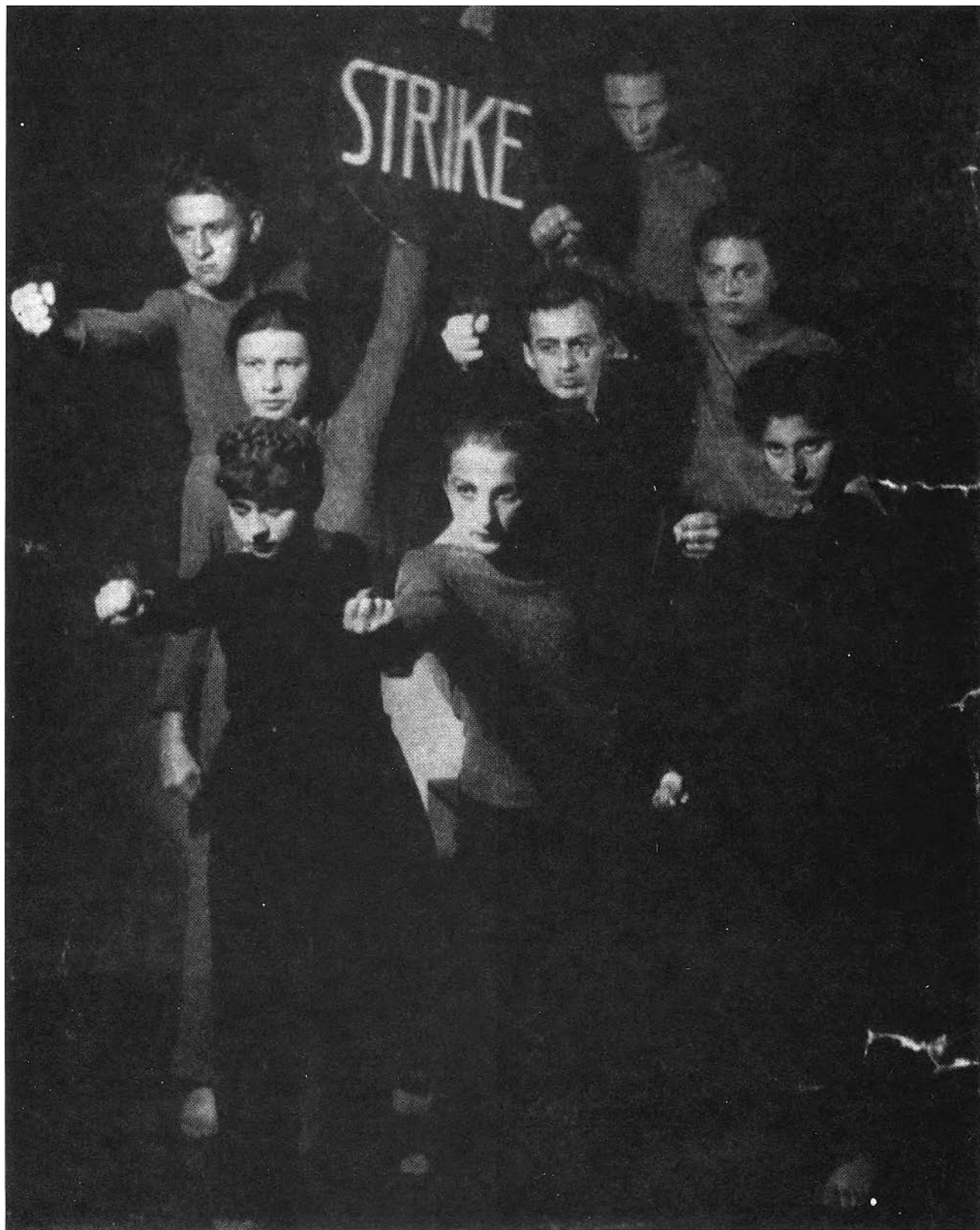
Figure 1. Workers Laboratory Theatre. Scene from Free Thaelmann! Reproduced from New Theatre , 1 (October 1934), cover (Courtesy of the author).