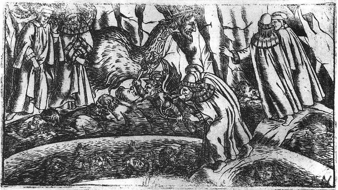
Figure 7. Inferno , Canto XVIII: The Malebolge with the Panderers and the Flatterers. 9.6 x 17.6 cm.