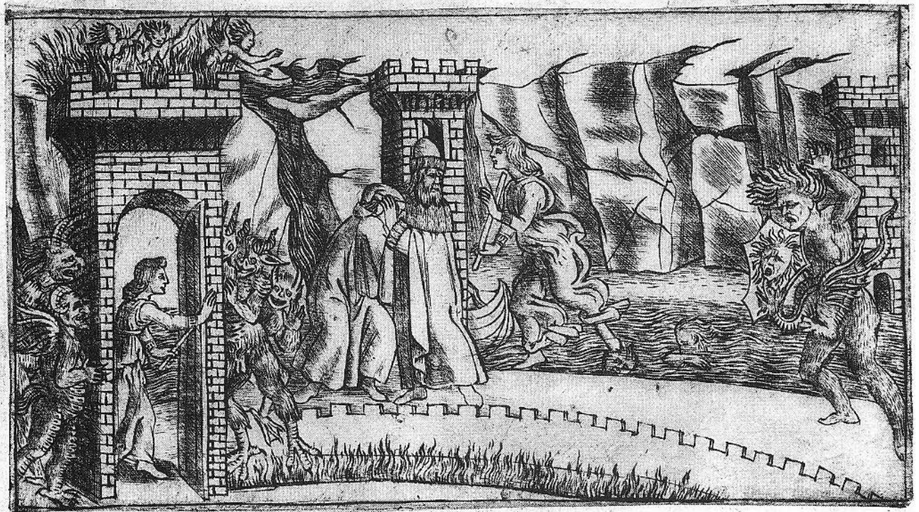
Figure 4. Inferno , Canto IX: The Styx and the City of Dis. 9.7 x 17.5 cm. (Photo: British Museum, London).

were stamped into the format of the book and the very letters of the poem.