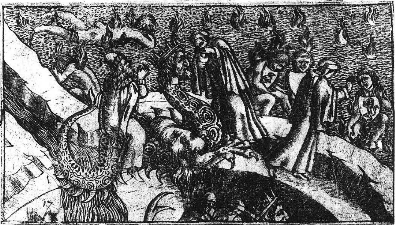
Figure 6. Inferno , Canto XVII: The Punishments of the Usurers. 9.7 x 17.5 cm. (Photo: British Museum, London).