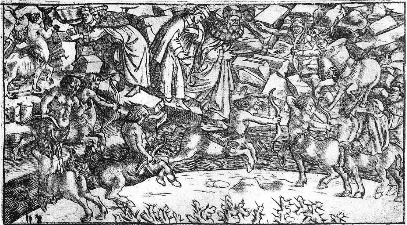
Figure 2. Inferno , Canto XII: The Punishments of the Murderers. 9.7 x 17.4 cm.

font, illustrations, disposition of text and images on the page, and inclusion of other texts to accompany the main work. The final element was the creative act of interpretation that appropriated the work in reading, so that a reader's understanding of a text was dependent on its content and presentation, but also on his or her imaginative reconstruction of the work through the deciphering of its visual and textual codes. This interpretation was obviously personal, but it is also true that any individual reader necessarily belonged to one or more "interpretive communities," that is groups of readers who shared the same reading styles and strategies of interpretation. 29