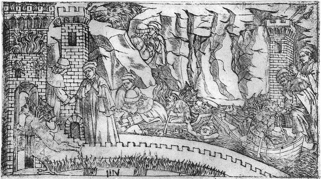
Figure 3. Inferno , Canto VIII: The Styx and the Punishments of the Wrathful. 9.6 x 17.6 cm. (Photo: British Museum, London).

that he felt it necessary to liberate “ el nostro cittadino ” from the barbarisms of non-Tuscan commentators and, through his efforts, to bring Dante’s exile to an end. About Tuscan, Landino adds: