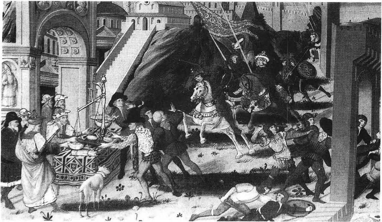
Figure 5. Zanobi di Domenico, Jacopo del Sellaio, and Biagio d'Antonio. The Morelli Cassone, central image, "The Gauls Defeated by Marcus Furius Camillus". 1472.

These illustrations must be considered another example of Florentine bravura, another attempt to outdistance technically all previous editions. But with their inclusion came a new complication, the necessity to position them in relation to the many visual representations of Dante and the Comedy which existed in the public sphere. Dante's history in Florence was not only oral and aural, it was also visual: frescoes based more or less exactly on the Inferno covered the walls of many churches, including the Strozzi Chapel in Santa Maria Novella. Even a more distant image like the fresco in the Pisa Camposanto was known through a variety of Florentine prints which circulated in the 1460s and 70s. 41 Obviously, if the poet and poem were to be distinguished from the culture of the masses, the illustrations could not be allowed to recall widely accessible images.