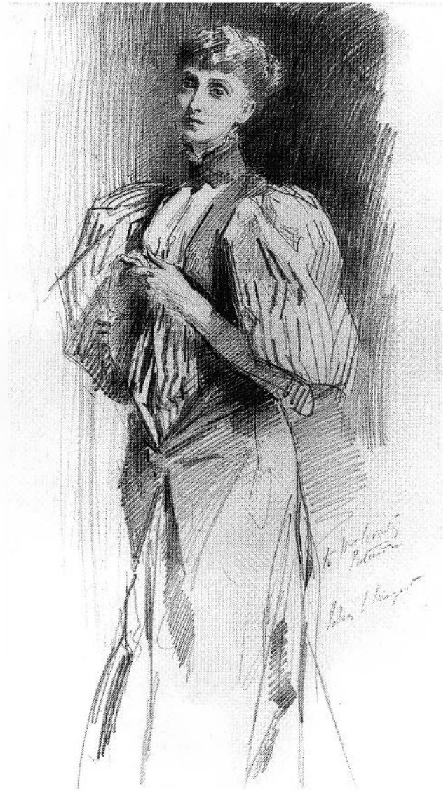
Figure 2. John Singer Sargent, Alice Meynell , 1894. Pencil, 36.2 × 21 cm. National Portrait Gallery, London.

for a book they wrote jointly and entitled Lithography and Lithographers , published in 1898.