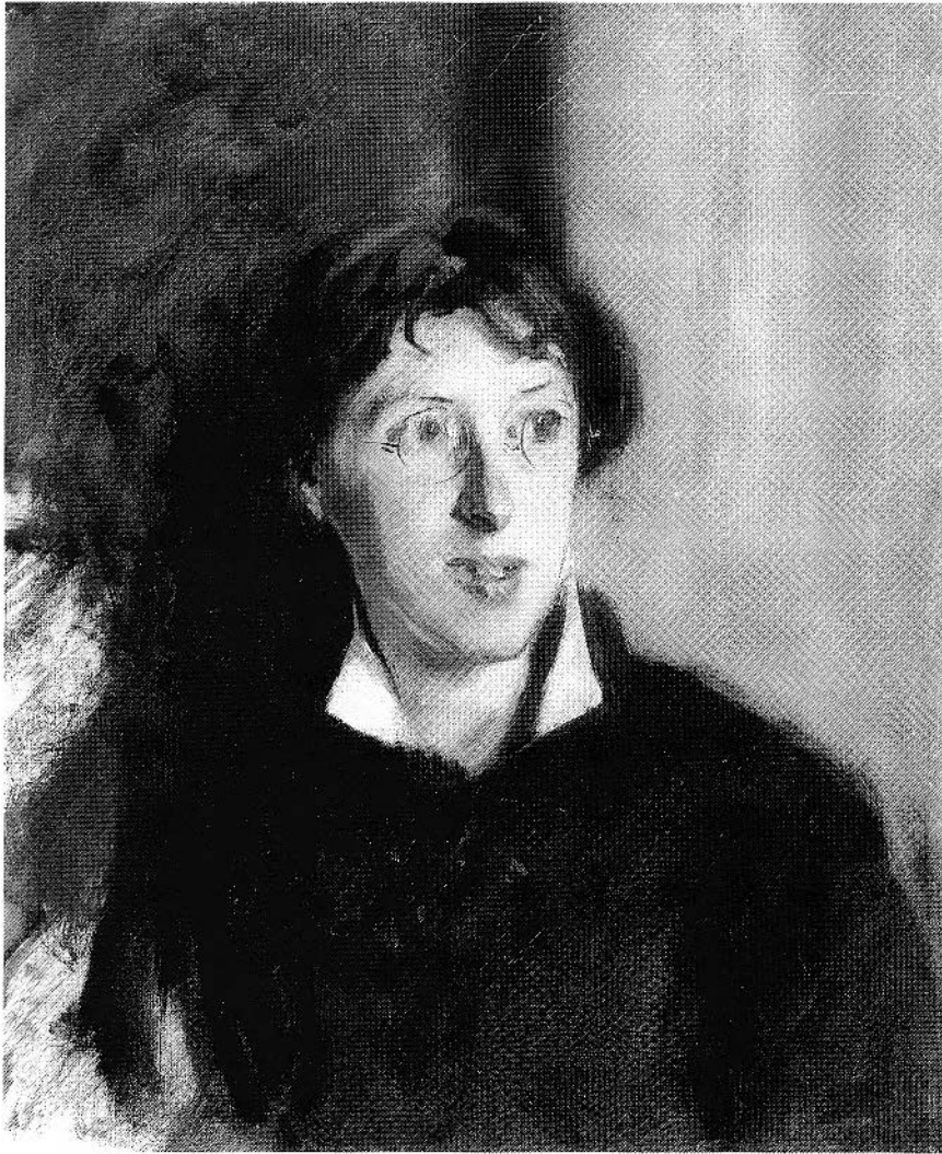
Figure 5. John Singer Sargent, Vernon Lee , 1881. Oil on canvas, 53.7 × 43.2 cm. Tate, London.

thereby also implying at least initially a private, gift-giving relationship.