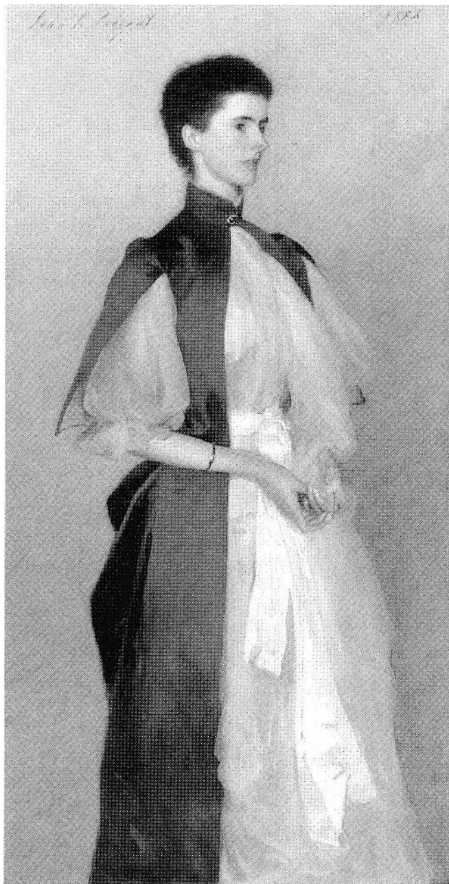
Figure 4. John Singer Sargent, Mrs. Robert Harrison , 1894. Oil on canvas, 157.8 × 80.3 cm. Tate, London.

images indicates their informality and indeed their mode of production in comparison to large studio portraits. At the same time, the fact that these are not large-scale portrait commissions for wealthy celebrities implies a different kind of social transaction. Although pencil on paper combines immediacy and portability, when framed the Sargent portrait grew in size substantially – it remains in what appears to be its original frame (74 × 61 cm), boldly surrounded by mottled red and brown. 11 The Whistler portrait inverts the professional studio setting,