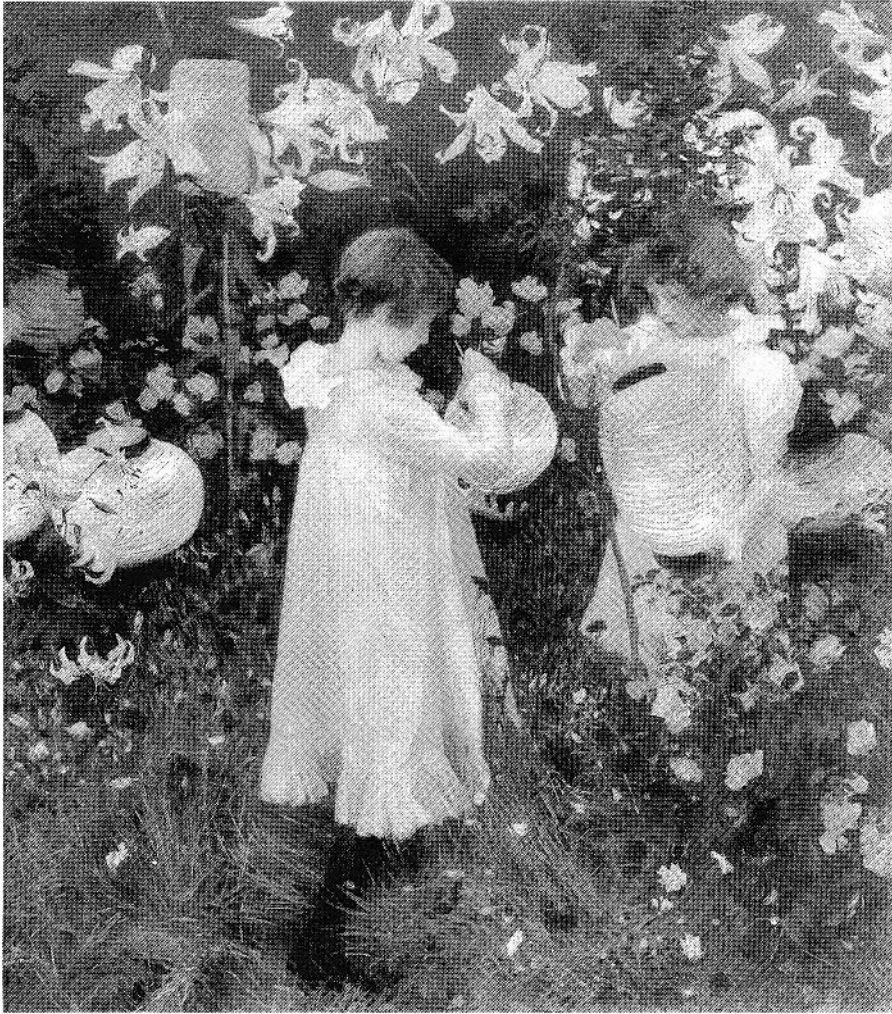
Figure 6. John Singer Sargent, Carnation, Lily, Lily, Rose , 1885–86. Oil on canvas, 164 × 153.7 cm. Tate, London (Photo: Tate, London, 2005).

and wilful – defiantly so in such passages as the painting of the rose in the dark-haired sister's dress and of the eyebrows in the fair-haired sister's intelligent forehead. The picture is fascinating, but it is altogether a little too extreme. 36