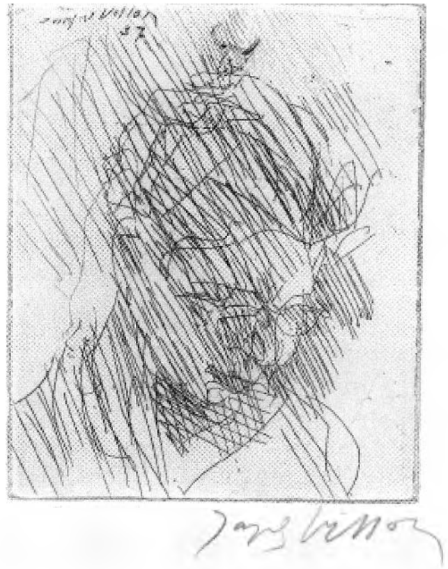
Figure 9. Jacques Villon, Portrait of Vincent Tovell , 1937. Etching on wove paper, 9.2 × 7.6 cm. Collection Vincent Tovell (© Estate of Jacques Villon / SODRAC, 2007; photo: Art Gallery of Ontario).

return to the image of Vincent and his recorder in the Eighth Bucolic Pastoral (fig. 11):