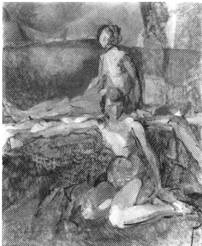
Figure 8. Jacques Villon, Les Jeunes Demoiselles , 1930. Oil on canvas, 73.0 × 60.0 cm. Toronto, Art Gallery of Ontario, Gift of Vincent Tovell, in memory of Jacques and Gaby Villon, 1979 (© Estate of Jacques Villon / SODRAC, 2007; photo: Art Gallery of Ontario).

In December 1929, the AGT presented an exhibition of late nineteenth- and early twentieth-century French paintings from the Kraushaar Galleries in New York, augmented with loans from private Toronto collections. It is hardly surprising that the Tovells proudly contributed their works by the Duchamp brothers. 32 In addition, they had just purchased from Kraushaar Delacroix's large painting The Return of Christopher Columbus (Toledo Museum of Art), which appeared under their name in the Toronto catalogue, and which was requested immediately for the major Delacroix retrospective organized by the Louvre in