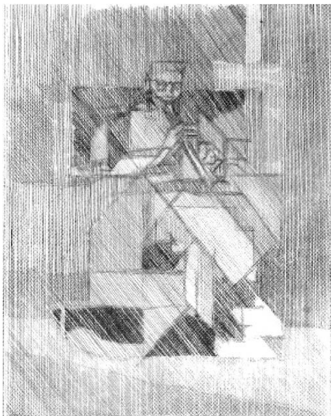
Figure 10. Jacques Villon, Le Joueur de Flageolet, 1938. Etching and drypoint, 20.2 × 15.8 cm. Print Department, Boston Public Library.