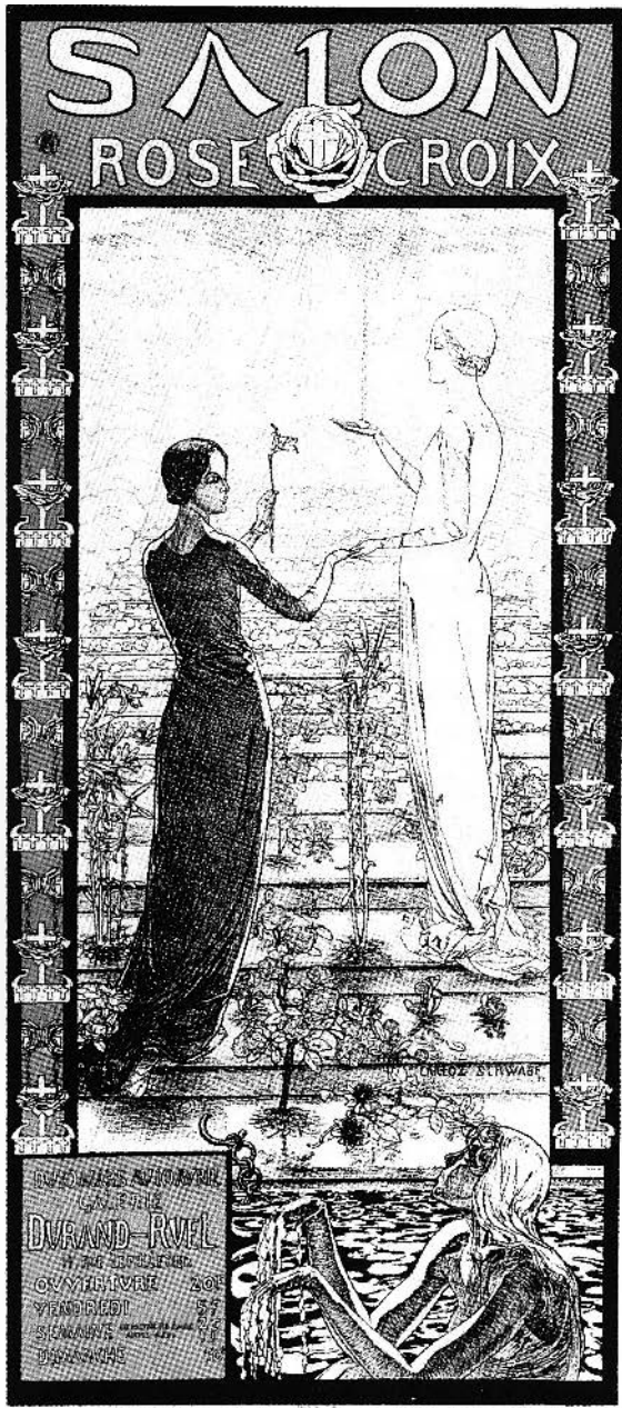
Figure 3. Carlos Schwabe, Poster for the First Salon de la Rose + Croix, 1892. Lithograph, 198 x 80 cm. Bibliothèque nationale de France.

We easily agreed that the time was not favorable for the constitution of a group of occult metaphysics, but that the fine arts, on the contrary, offered to our efforts a vast and useful arena, and that by aesthetic means we could make our spiritualist theories penetrate the frivolous brains of our contemporaries. 42