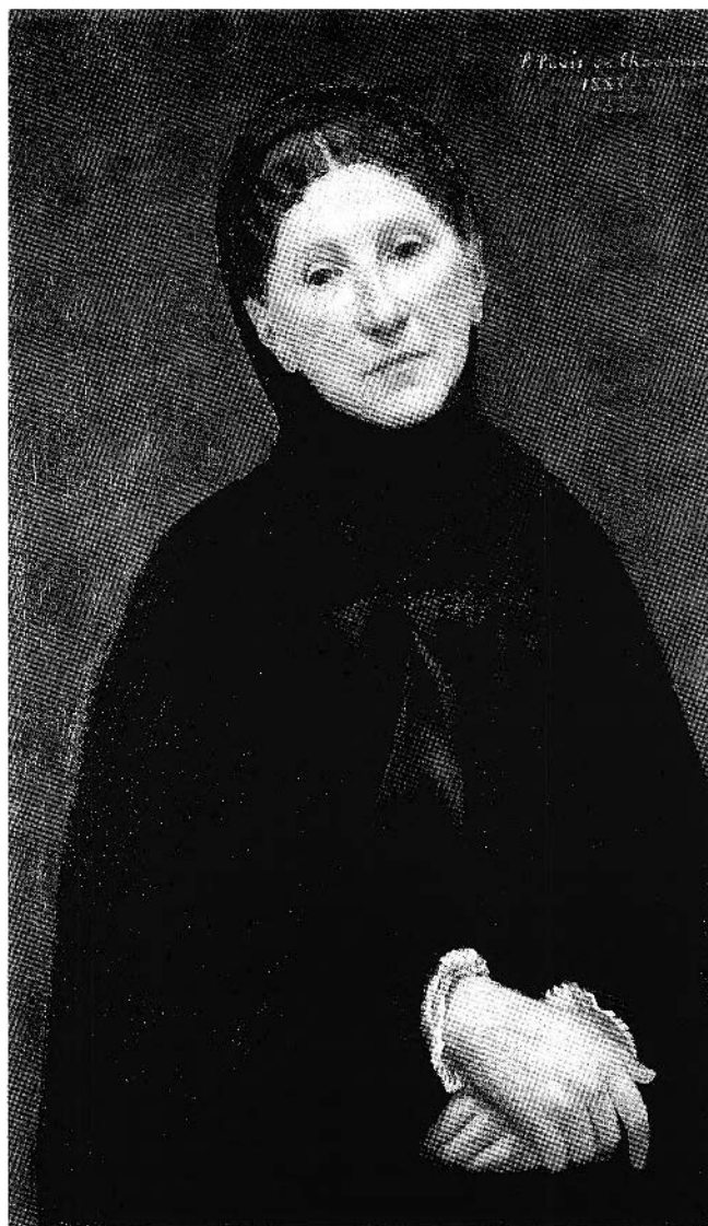
Figure 2. Pierre Puvis de Chavannes, La Princesse Marie Cantacuzène , 1883. Oil on canvas. 78 x 46 cm. Musée des Beaux-Arts de Lyon.

In explaining the alternative to contemporanéité , Péladan again chose highly charged, political language. He explained that the artist of a work that exhibits contemporanéité "translates...the text of reality word for word instead of making... 'un bon français.'" 20 This archaic expression, used to describe something of truly French character, exhibits the switching of