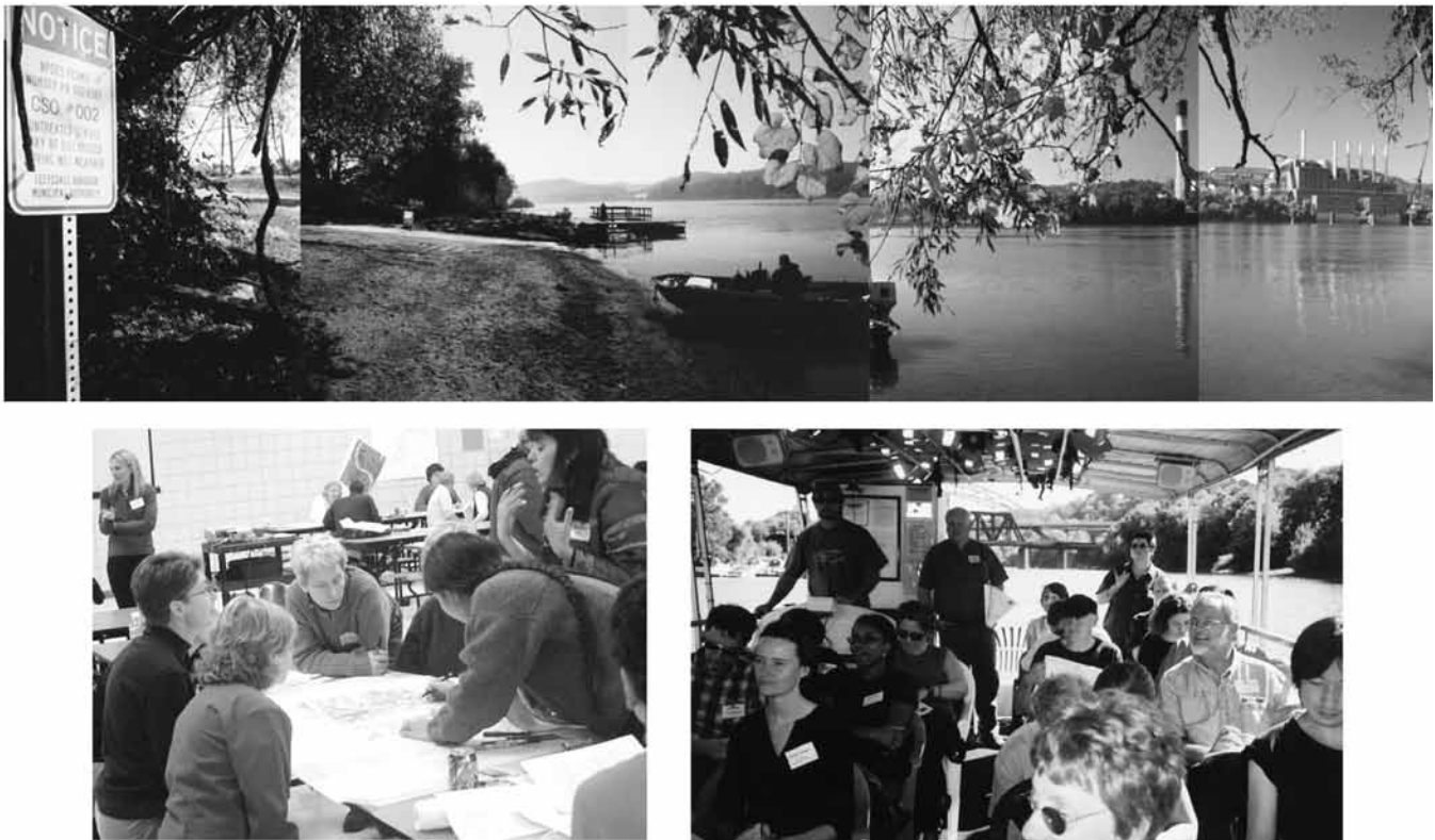
Figure 2. Images from 3 Rivers 2nd Nature: the post-industrial condition—dirty water and aging industrial infrastructure; interested parties and potential advocates on the rivers and at the public design tables.