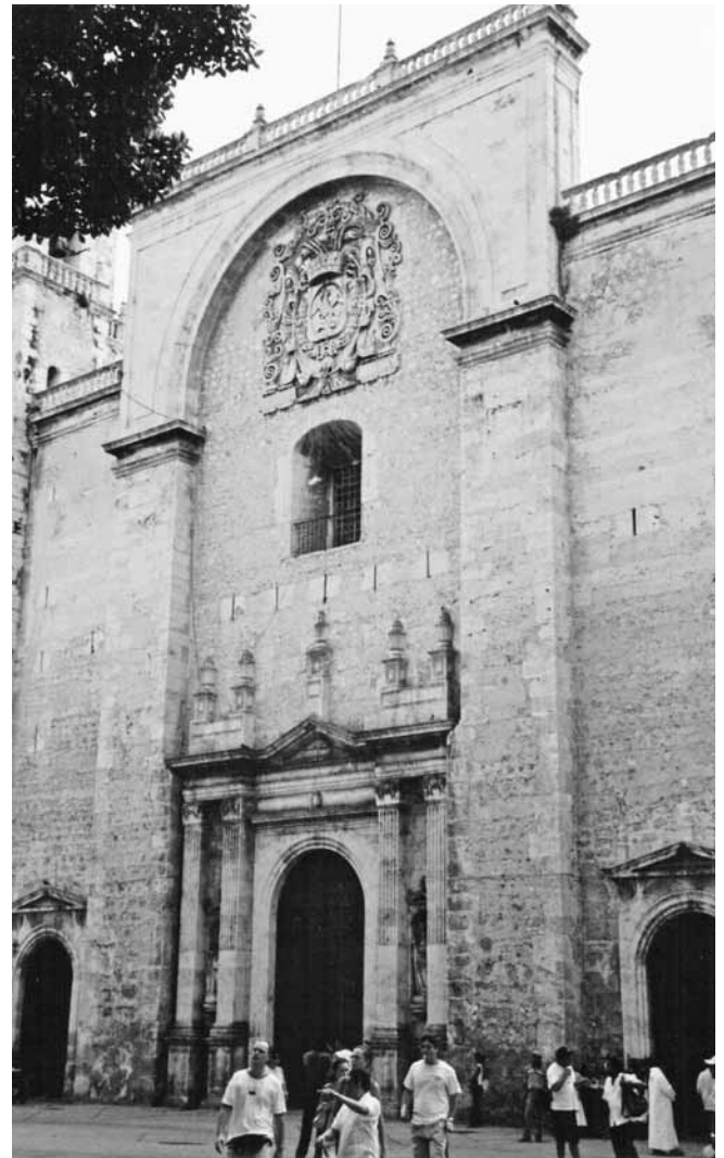
Figure 12. Cathedral of San Ildefonso, Mérida, Yucatán, ca. 1562–99.

This article evolved out of my 2007 dissertation and needless to say I owe much gratitude and thanks to all who have encouraged me along with this topic. Likewise, I wish to thank the reviewers at RACAR for their insightful feedback and suggestions. I also extend many thanks to my anonymous colleague who offered her time in reading this essay. Partial funding for this essay was provided by SSHRC Internal Research Awards at The University of Western Ontario.