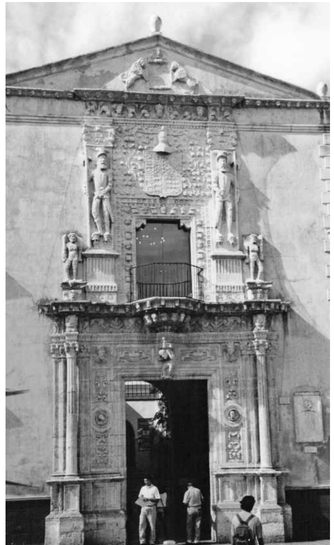
Figure 1. Casa de Montejo, Mérida, Yucatán, ca. 1542–49.