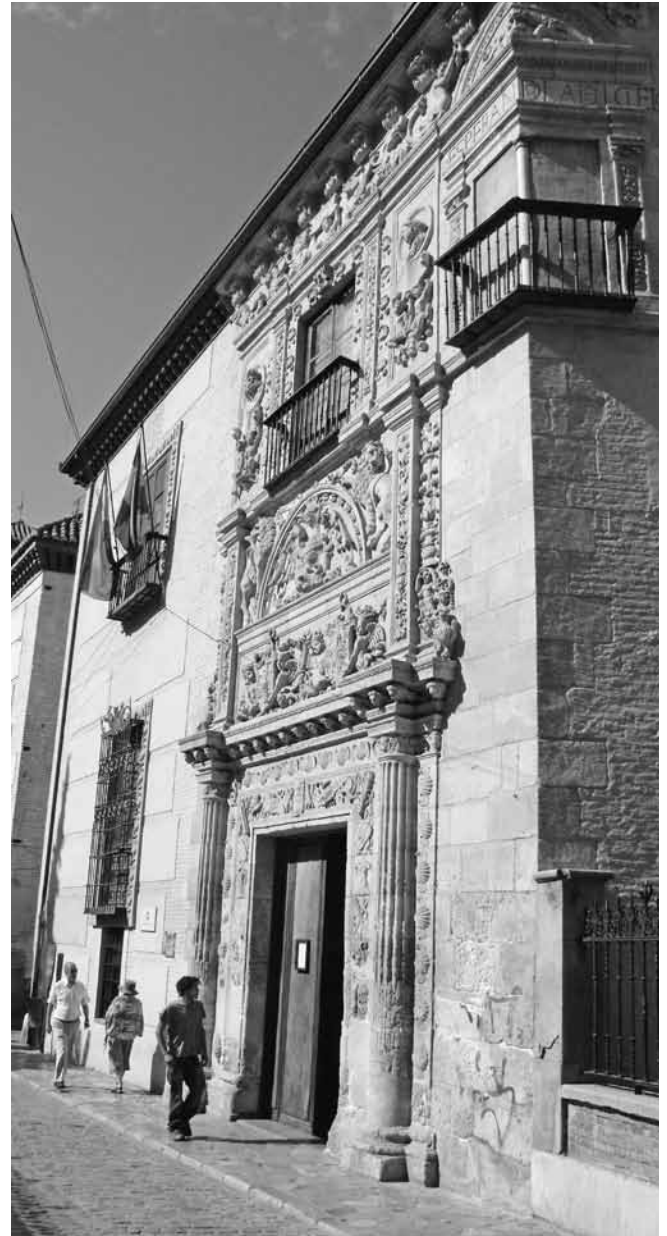
Figure 2. Casa de Castril, Granada, Spain, ca. 1539. Attr. Sebastián de Alcántra.

been able to offer documentary evidence to affirm his claim. 22 It is clear that an artist conversant in contemporary European idioms designed the facade since all the motifs in the sculptural program are European, but it is less certain that the artist was European.