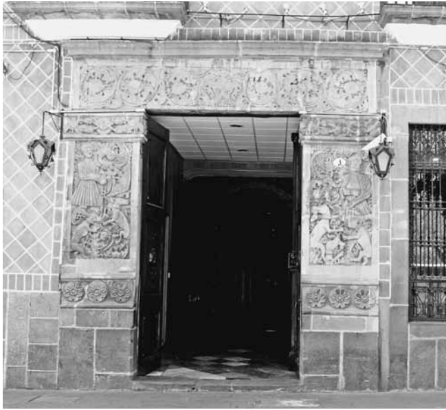
Figure 8. Casa del que Mató el Animal, Puebla, Mexico, ca. mid-sixteenth century.