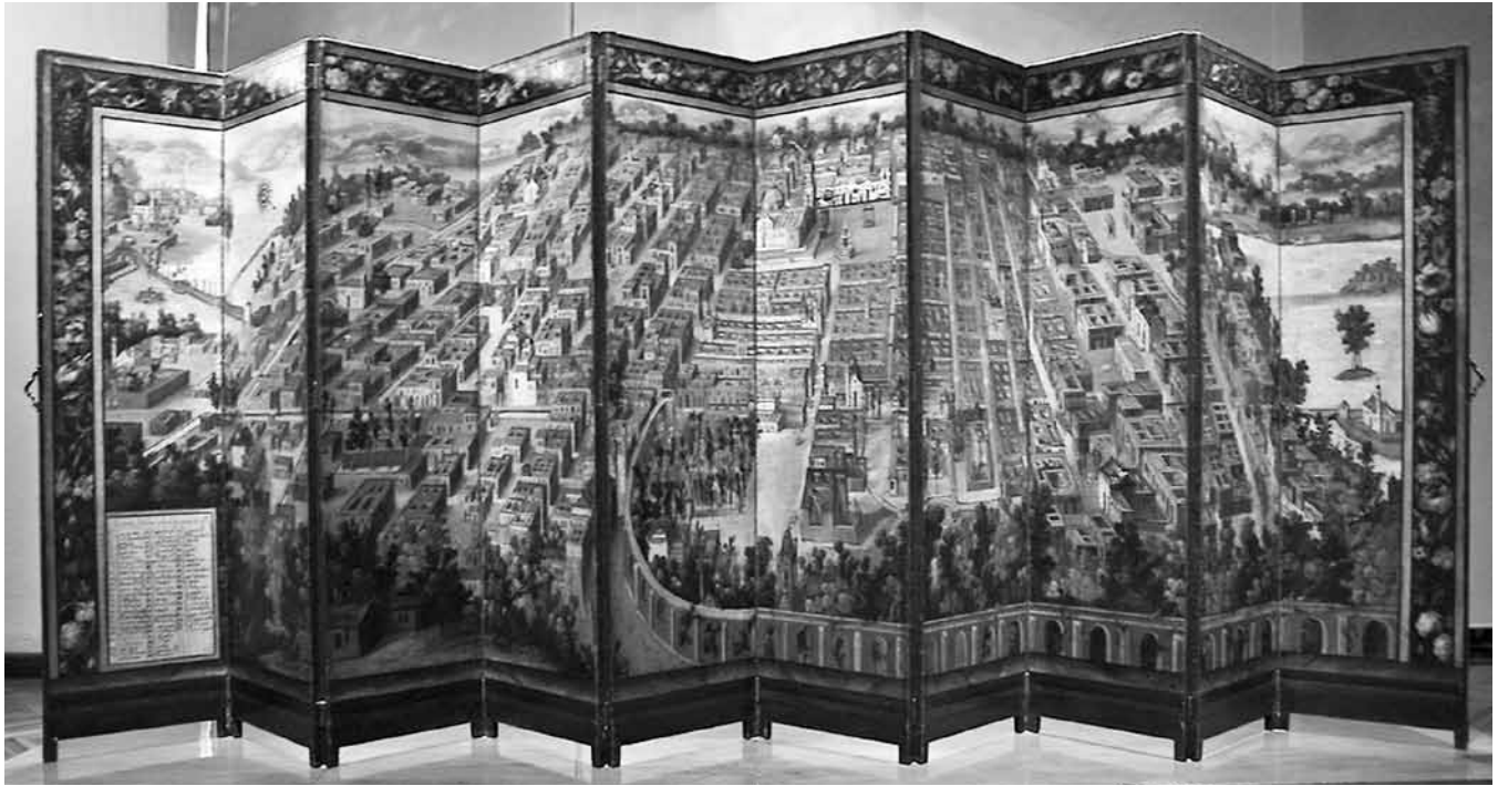
Figure 11. The Very Noble and Loyal City of Mexico City, biombo (folding-screen), late seventeenth century. Oil on canvas, 213 x 550 cm. Mexico City, Museo Franz Mayer.