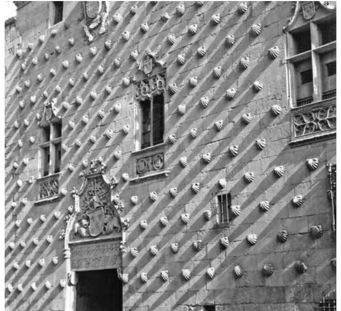
Figure 5. Casa de las Conchas (House of the Shells), Salamanca, Spain, ca. early sixteenth century.

The Casa de Montejo's facade also exhibits symbols of self-representation that are derived less from monarchical traditions