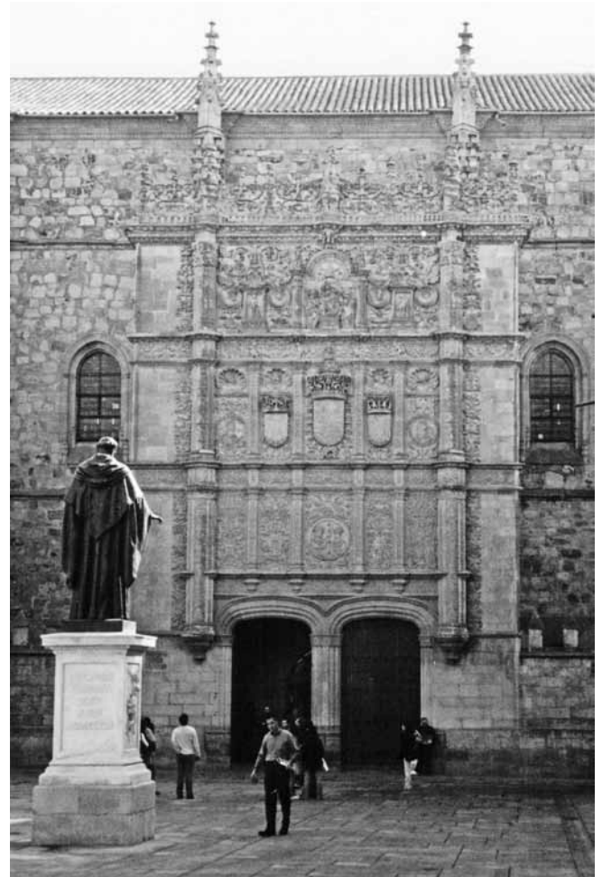
Figure 7. Universidad de Salamanca, Salamanca, Spain, ca. mid-sixteenth century.

The Plateresque lent itself to inflection, if not translation, in a colonial Hispanic American idiom. The incorporation of in-