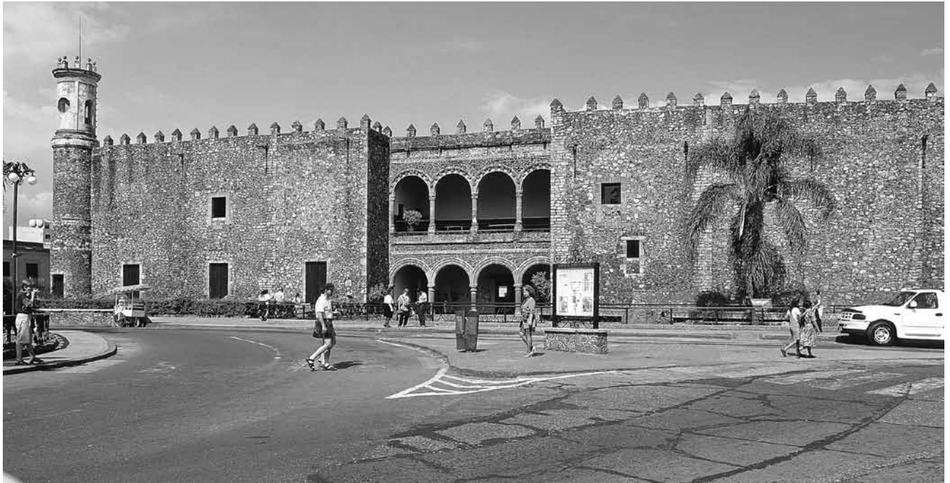
Figure 10. Palacio de Cortés, Cuernavaca, Mexico, ca. early sixteenth century (Photo: Archivision).