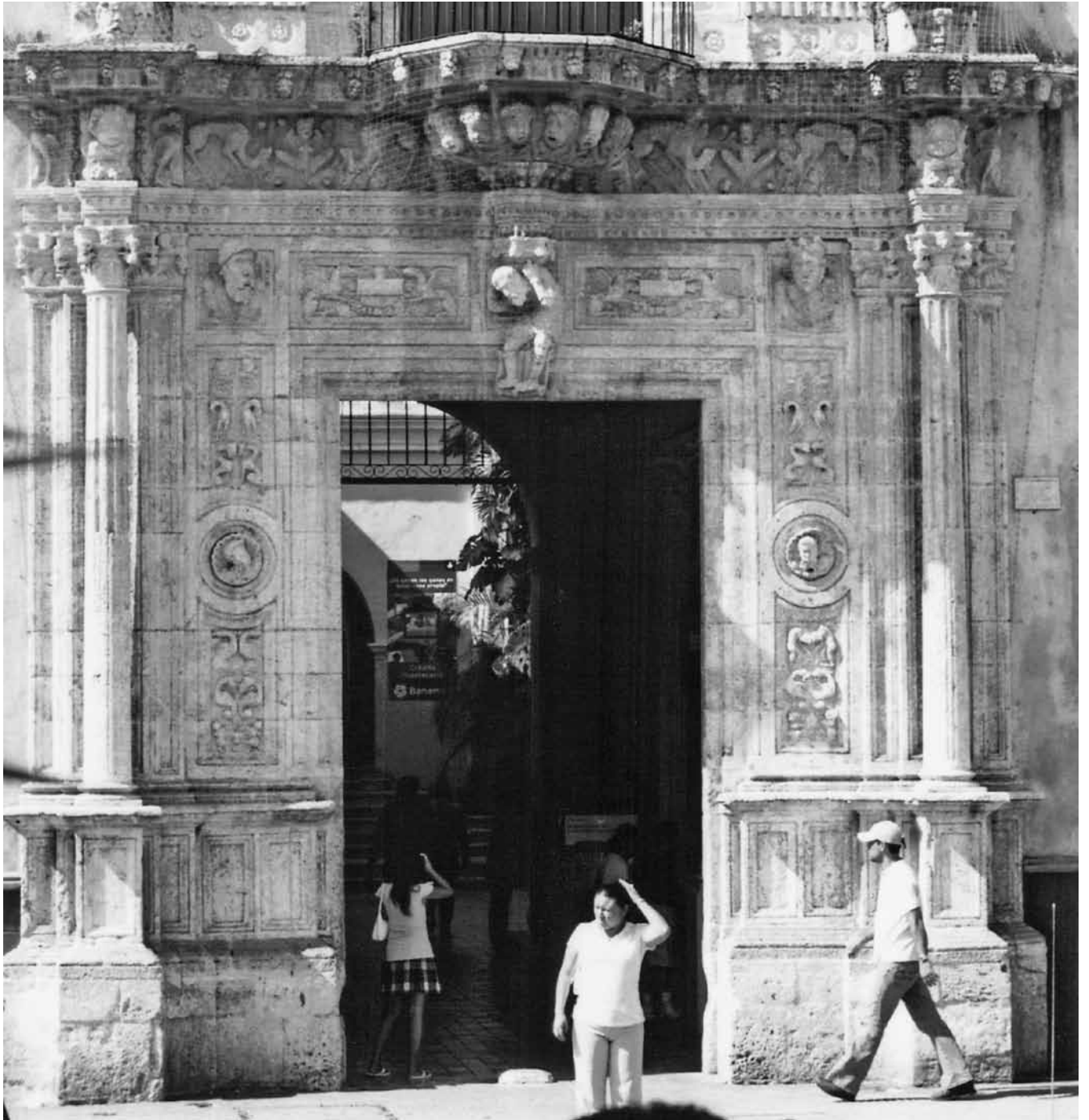
Figure 3. Lower facade, Casa de Montejo (Photo: author).

From the cornice hang pine cones, which are also seen hanging from the larger, otherwise undecorated triangular pediment of the facade. 29