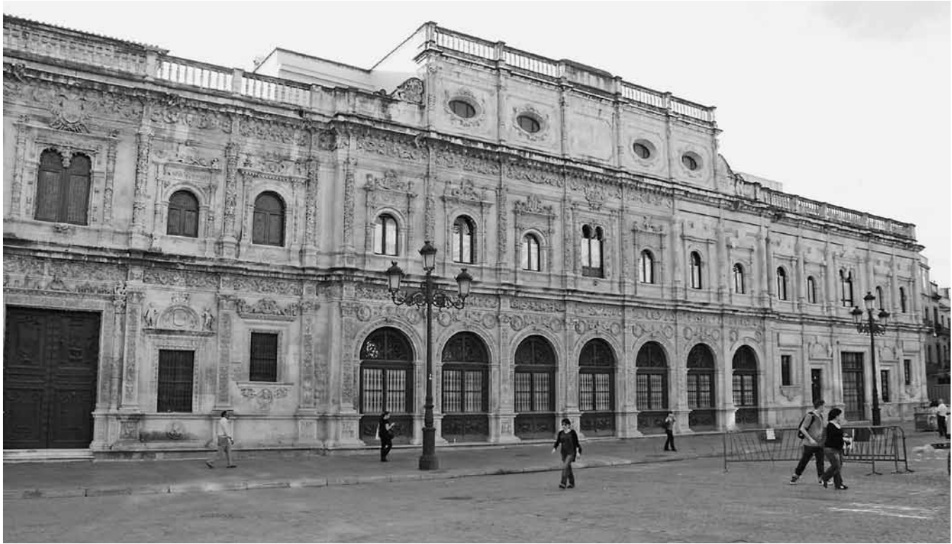
Figure 6. Ayuntamiento, Seville, Spain, ca. 1527–34.

example, in his 1526 treatise Medidas del Romano , Diego de Sagredo introduced principles of Renaissance architecture in a vernacular survey of design and sculptural adornment for Spanish patrons and builders. 35 Additionally, Sagredo suggested that architects should not simply imitate classical forms, and he encouraged experimentation in design, as the ancient Romans did. Sagredo states, “It is true that, in the buildings [of the ancient Romans], there is a great diversity of ornaments, which have been applied without restraint, and seem more like added finery than an essential part of the finished building.” 36 Although he hints at some frivolity in ornament, he is implying that artists should place importance on artistic license and invention in surface decoration. Indeed, he realized that in practice, even the ancient Romans did not always follow the principles set out in theoretical books, such as those by Vitruvius. 37 For example, Sagredo endorsed the baluster as a classical architectural element, which was in accordance with ancient precedent, even though balusters do not appear in Vitruvius. Therefore, he endeavoured to help Spanish patrons and architects formulate a Spanish understanding of the Renaissance idiom, rather than an understanding derived slavishly from the fifteenth- and sixteenth-century Italian architects to whom he alludes in his text. 38 Clearly, Sagredo and his contemporary promoters of the