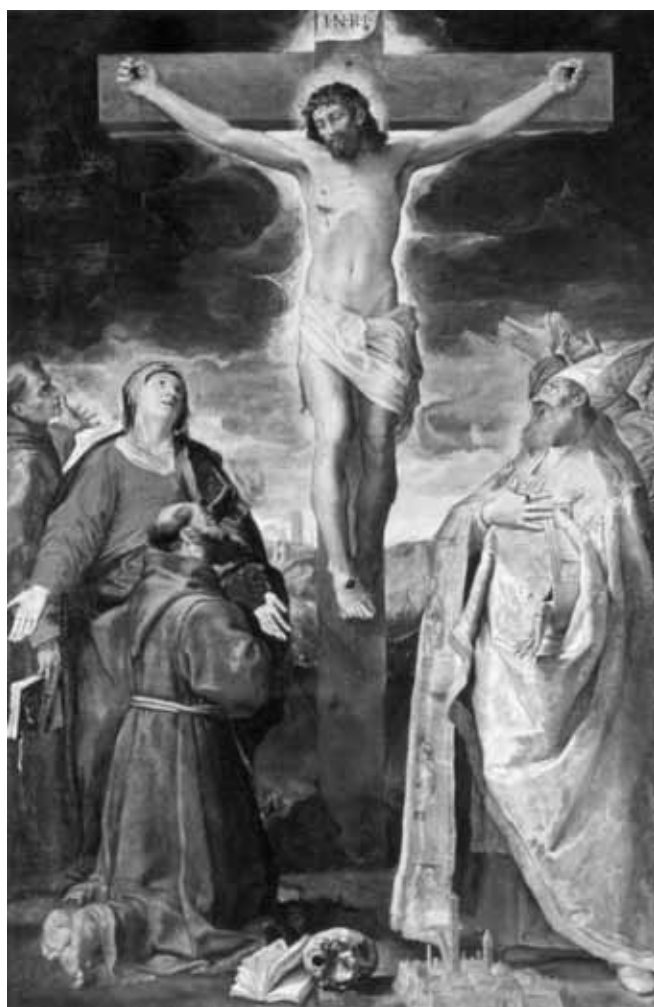
Figure 1. Annibale Carracci, Crucifixion with Saints , 1583. Panel, 305 x 210 cm. Bologna, Sta. Maria della Carità (Soprintendenza per i beni artistici e storici per le province di Bologna, Ferrara, Forlì, Ravenna e Rimini).

in the Counter-Reformation. In the context of the Oratorian-led interest in the archaeological remains of the early Apostolic Church, a new sense of continuity as a testimony to the legitimacy of the Roman Church superseded the Renaissance preoccupation with reconstructing venerable image traditions. Saint Filippo Neri's interest in the Roman catacombs opened a whole new area of ecclesiastical studies, which has subsequently come to be known as Christian archeology; and the methodology of Cardinal Cesare Baronio's Annales Ecclesiastici (1588–1607), in its close attention to chronology and obsessive concern with demonstrating the continuity of the Roman Catholic Church with the early Apostolic Church, was an orchestrated attempt to create a new ecclesiastical historiography. 6 Such ability to match past examples to contemporary imperatives found new urgency and definition in the Counter-Reformation. All these factors