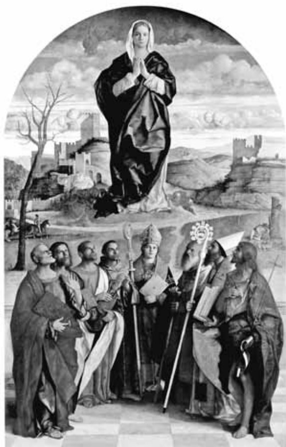
Figure 9. Giovanni Bellini, Assumption with Saints , ca. 1513. Panel, 350 x 225 cm. Venice, Murano, San Pietro Martire (Ministero per i Beni e le Attività Culturali, Venice).

ico's paintings, whether or not based on Rogier's independent knowledge of the Italian tradition, initiated an implicit critique of Robert Campin's and Gentile da Fabriano's excessive pictorial narratives. 42 Aby Warburg's specific conclusions on van der Weyden were products of the same awareness that Italian altar painting unveils a Netherlandish sensitivity in the rendition of devotional themes, as in the art of Ghirlandaio, for example. 43 I argue that the apprehension of historical altarpiece styles in the early modern period was built on the possibility that an exchange of Italian and Netherlandish experiments could be both a powerful testimony to early Christian art and at the same time a substitutional model for novel creations. As evidence suggests, Netherlandish altar painting reverberates with a tragic narrative involving a subtle negotiation between the dictates of naturalism and an adherence to the sacramental significance of Christ's sacrifice. The resourceful solutions to preserve the mystery of