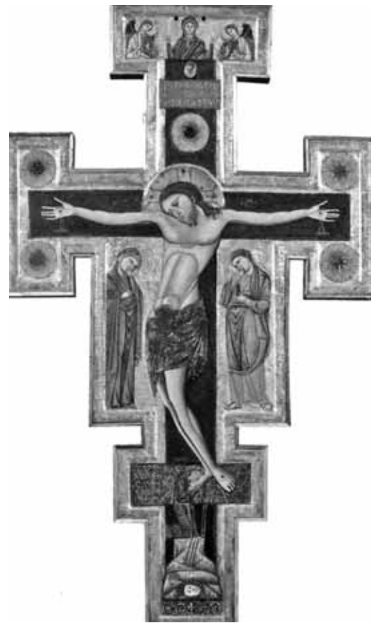
Figure 2. Master of Saint Francis, Crucifix (double-sided), ca. 1260–80. Tempera on panel. Perugia, Galleria Nazionale dell'Umbria (Ministero per i Beni e le Attività Culturali, Rome).

paintings was provided through a most famous collection of Byzantine icons inherited by Lorenzo de Medici from Pope Paul II. 16 The evidence suggests that the collecting of Byzantine icons was an integral feature of the antiquarian culture of Renaissance Italy, thus making icons such as the Duecento Master of Saint Francis's Crucifix a notional creative model for the Crucifixion narrative. The comparison between the Cross and the Crucifixion that began from the same assumption of the icon's value for likeness in the formalist account of Byzantine art is sustained in the sixteenth-century Crucifixion altarpiece by Annibale.