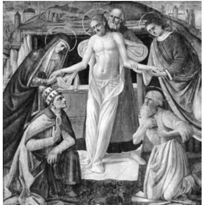
Figure 10. Domenico Ghirlandaio (school), Lamentation , late fifteenth century. Panel, 147 x 141 cm. Badia a Settimo, Sant' Apollonia.

In his Crucifixion with Saints Annibale Carracci was seeking to maintain the discontinuities of time and space evoked by icons by diversifying action and devotional movement within a pictorial composition centered around Christ. This constituted both a potent reminder of the past's discontinuity with the present that was the hallmark of the Renaissance and a renewed awareness of painting as a substitutional conception in the early modern age. Annibale Carracci broadened the Renaissance endeavour to the point that it met the needs of retrospective articulation of the icon, and he also laid the basis for a histor-