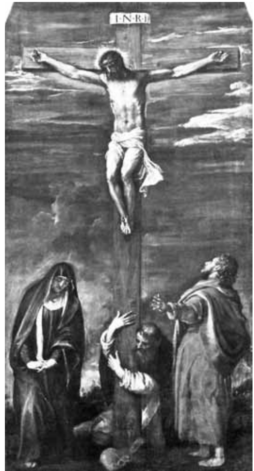
Figure 8. Titian, Crucifixion , 1558. Oil on canvas, 371 x 197 cm. Ancona, San Domenico (Scala, Florence).

It seems no coincidence that El Greco's astute observation that Correggio revived interest in ancient beauty without imitating any classical grandeur is the counterpart of Annibale's praise of Correggio and the beauty of natural forms. 41