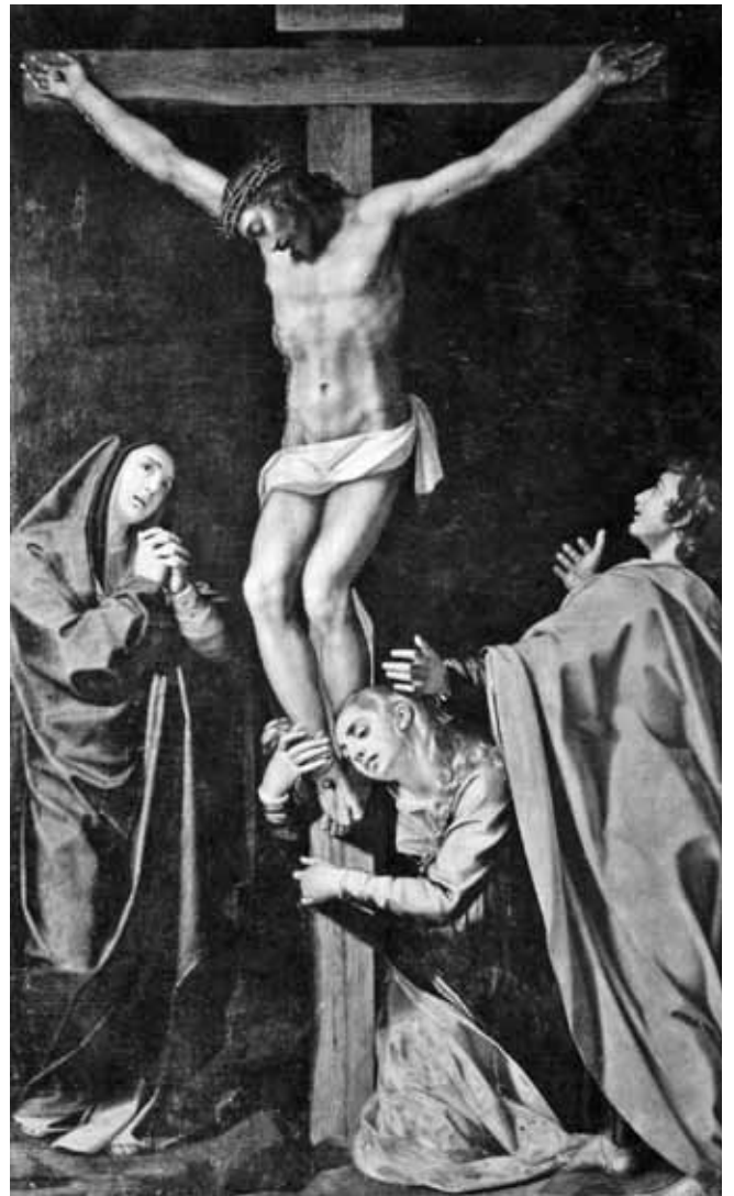
Figure 6. Scipione Pulzone, Crucifixion , 1585–90. Oil on canvas. Rome, Chiesa Nuova (Soprintendenza speciale per il patrimonio storico, artistico ed etnoantropologico e per il polo museale della città di Roma).

As Federico Zeri has recognized, Scipione Pulzone melds altar painting with archaic stylization in his Crucifixion , ca. 1585–90 (fig. 6), for the Oratorians at the Roman Church of Santa Maria in Vallicella. 30 Even though his Crucifixion remains rather inexpressive and laboured, for Zeri, Pulzone deserves credit for having surpassed the fixation with decorum, the classical ideal of fitness to purpose that held sway in the post-Tri-