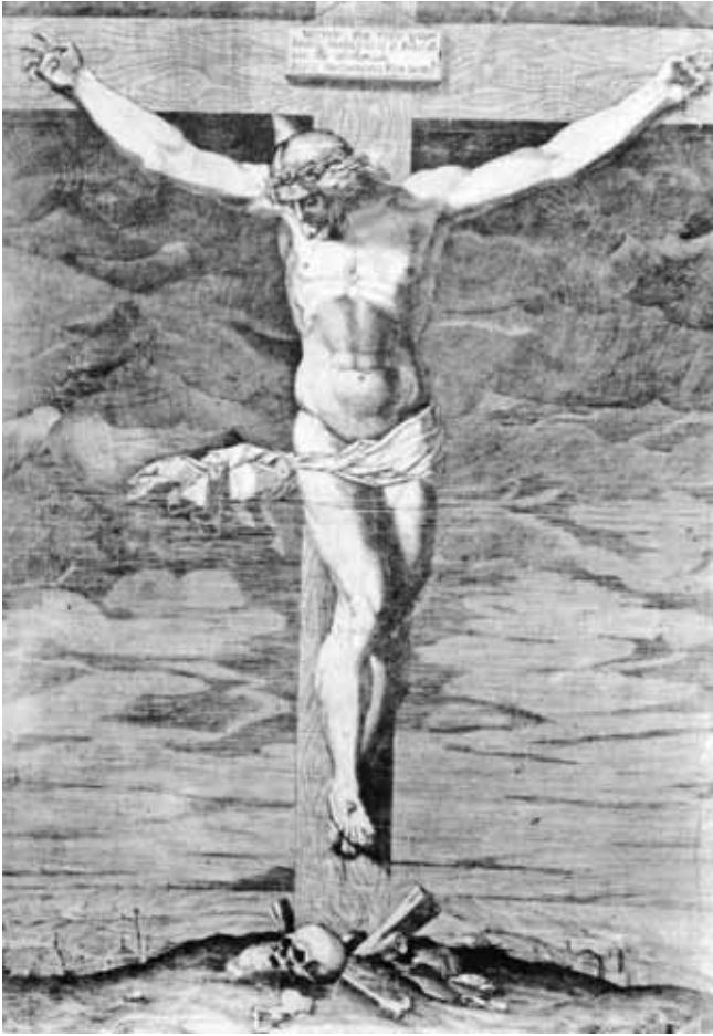
Figure 3. Annibale Carracci, Crucifixion , 1581. Engraving, 49.2 x 34.7 cm. Vienna, Graphische Sammlung Albertina (Albertina, Vienna).

tures of a traditional Crucifixion scene while underscoring the devotional sentiment of the Byzantine icon. The frontal presentation of his Crucified Christ holds the altarpiece's vertical axis and draws attention to a new iconic identity, what I call the restructuring of the Crucifixion icon to mark off holiness in altar painting more clearly than in experiments antedating the post-Tridentine period. Annibale Carracci advanced a simple assertion of the icon in a narrative context by confronting the canonical iconographies of the Crucifixion. To this end he enhanced the colouristic effect of the eclipse at the Crucifixion hour and bathed the Cross in a dramatic counter-light. The body of Christ lit up in the shape of a torch, silhouetted against a tormented horizon, recedes and simultaneously advances in consonance with the icon's mesmerizing sway from visible to invisible matter. The visual narrative of the Crucifixion unravelled mysteries and meanings never exploited in the traditional iconography hitherto.