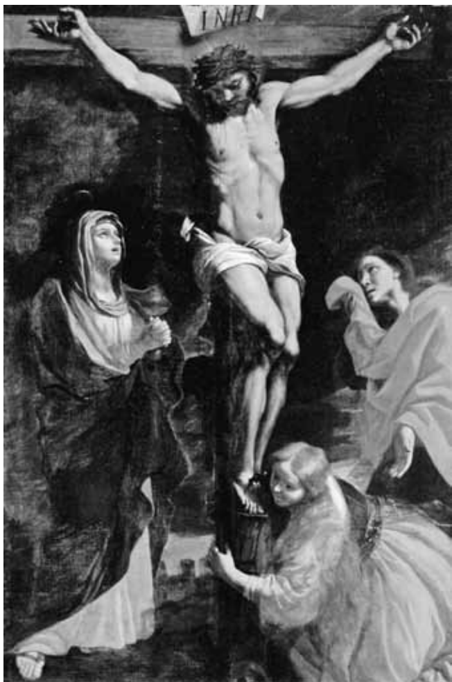
Figure 7. Mattia Preti, Crucifixion , ca. 1682–84. Oil on canvas, 233 × 159 cm. Taverna, Church of San Domenico (Soprintendenza regionale).

of their ecclesiastical patrons, found themselves compelled to abandon the motivating ideas of Renaissance art, thereby preventing an absorption of essential accomplishments from the past. By contrast, the perception that the image of Christ should be placed in the center of a composition and oriented frontally is moderated by Scipione Pulzone's Crucifixion in a manner that distills archaic sources into a post-Tridentine altarpiece. As Stuart Lingo has reasoned, the archaic stylization in Pulzone's altar painting was most relevantly epitomized by a vocabulary of figural prototypes common to a number of the Crucifixions produced in the decades following the termination of the Council of Trent. 32 The archaic quality most accentuated in Pulzone's Crucifixion concerns the posture of the Virgin Mary, who recalls the archaic features used by Michelangelo in the female figures of Rachael and Leah on the tomb of Julius II in San Pietro in Vincoli. Little wonder, therefore,