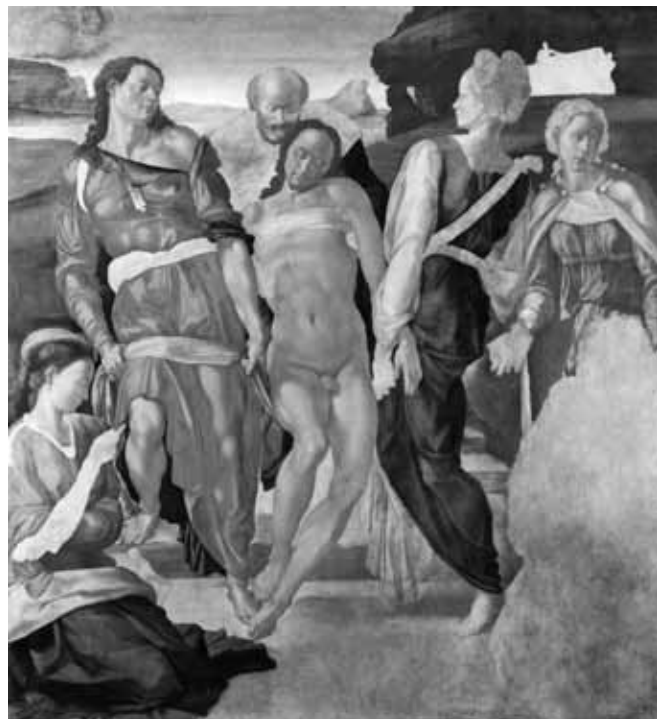
Figure 11. Michelangelo, Entombment , ca. 1500. Panel, 162 x 150 cm. London, National Gallery (National Gallery, London).