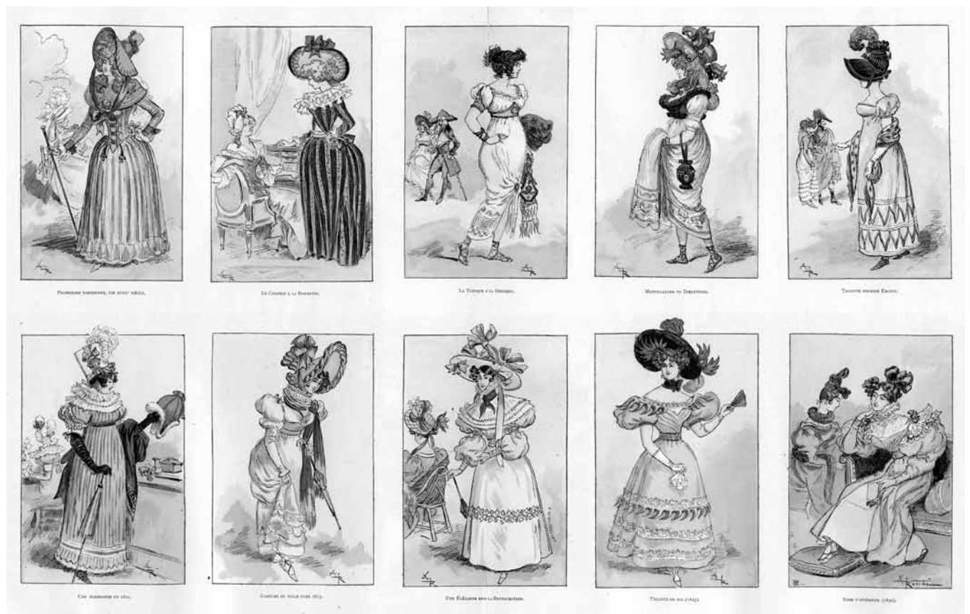
Figure 9. Albert Robida, La Mode et le Costume à Travers le Siècle (1800–1839) . Illustration in L'Exposition de Paris (1900) , vol. 3 (Paris, 1900), supplement no. 25, following p. 196.

tance of the industry to France; as commentators noted, the building was comparable to the Palais du Génie Civil et des Moyens de Transport, which was located directly across the Champ de Mars. 70 The clothing exhibits focused on the current production of fabric and fashion, using display techniques derived from modern department stores. Overall, the displays sought to prove the continued pre-eminence of Paris in world fashion, while simultaneously indicating how far it had advanced from traditional costume. The strength of this industry was attributed to Parisian women since “la persévérance de la femme a sauvé de la ruine une des dernières supériorités que nous demeurant dans les arts de luxe et c’est la France qui continue à dicter la mode aux cinq parties du monde.” 71 Moreover, through this exhibit “la mode française attestera, une fois de plus, la vitalité de son universelle domination.” 72 This French fashion was clearly the haute couture world of Paris. Indeed, the exhibition organizers situated provincial costume as a counter-balance to the heady world of changing Parisian haute couture.