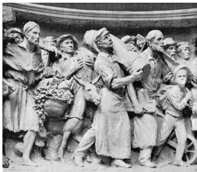
Figure 4. Anatole Guillot, Maquette of Worker's Frieze component of Porte Monumentale . Illustration in L'Exposition de Paris (1900), vol. 2 (Paris, 1900), 4.

their day and would not have worn foreign clothes; likewise, La Parisienne should wear contemporary, fashionable French clothing. 38 This argument doubtless played to the ideology Silverman revealed as a gendered call to patriotism, where women were expected to support the national economy through conspicuous consumption of luxury goods, while simultaneously evoking a modern, up-to-date aesthetic. 39