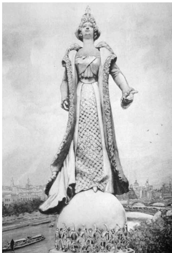
Figure 2. La Parisienne , cover of L'Illustration , 14 April 1900. Collection of the author. Image by Jarrett Duncan.

The general shape and appearance of the gateway was evidently inspired by Binet’s use of and interest in the theories of German botanist Ernst Haeckel. Haeckel promoted Darwinian evolutionary biology, 22 which the French usually called transformism , using the term associated with the French precursor to Darwin, Jean-Baptiste Lamarck. As one account of the gate explained, Binet “has observed the laws of transformism and has noted how, with the lower beings, the natural kingdoms converge and intermingle; finally, and most important of all, he has met Haeckel ( Kunstformen de Natur ) and discovered what an