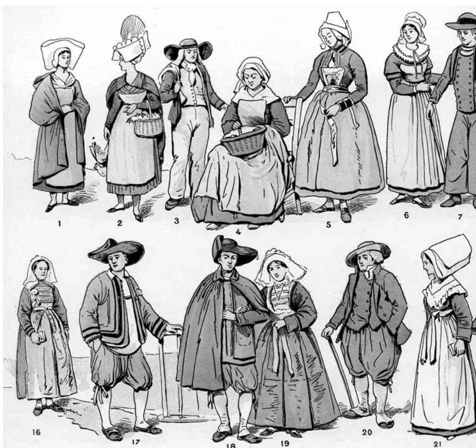
Figure 10. François Courboin, Musée Centennial des Costumes Français . Detail of illustration in L'Exposition de Paris (1900) , vol. 3 (Paris, 1900), supplement no. 33, following p. 260.

to nature and equating them all with peasants. There are no flâneurs in the provincial backgrounds. Both official exhibitions and popular illustrations depicted all provincials as peasants living in an unchanging world, thereby transforming provincial clothing into folk costume. The Arlésienne , that quintessential woman of Provence, thus carried the symbolic weight of a supposedly unchanging and unchangeable tradition. 74 Provincial women stood in stark contrast to the Parisienne in the clothing displays, revealing and reinforcing a boundary that was also demarcated in the exposition's art exhibits.