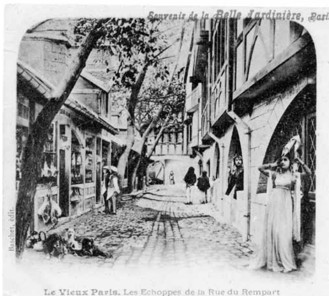
Figure 6. Postcard illustrating Le Vieux Paris, Exposition Universelle, 1900 . Collection of the author. Image by Jarrett Duncan.

er and man as producer, 52 a myth that relied on the bourgeois ideology that middle-class women did not work for wages. 53