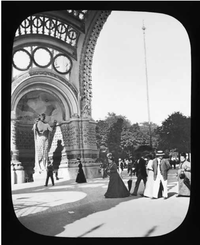
Figure 5. Joseph Hawkes, Paris Exposition: Place de la Concorde, entrance gate, Paris, France, 1900 . Lantern slide, 10.16 x 8.26 cm. Brooklyn Museum Archives, Goodyear Archival Collection, visual materials (6.1.015): Paris Exposition lantern slides.