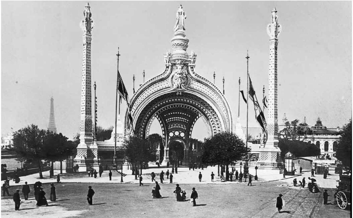
Figure 1. Joseph Hawkes, Paris Exposition: main entrance gate, Paris, France, 1900 . Lantern slide, 8.26 x 10.16 cm. Brooklyn Museum Archives, Goodyear Archival Collection, visual materials (6.1.015): Paris Exposition lantern slides.

for debates over decentralization and the role of “les provinces” in the nation. 8 Decentralization has sometimes been viewed as a purely right-wing political ideology, but in the 1890s, along with regionalism, it crossed political boundaries and was fundamentally concerned with how the nation outside the Île-de-France might define itself. In 1895, Parliament appointed a Commission décentralisatrice to study how decentralization might be implemented; La Revue socialiste claimed that “decentralization is the order of the day”; and naturalist writer Jean Ajalbert called it the year’s favourite “tarte à la crème politico-littéraire.” 9