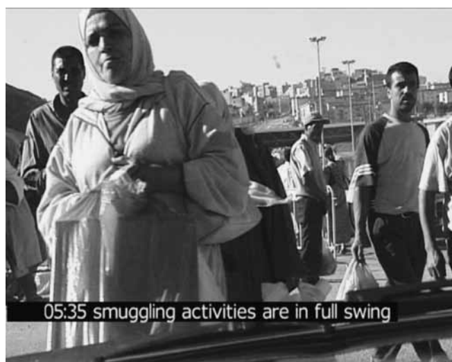
Figure 9. Ursula Biemann and Angela Sanders, Europlex , 2003. Video still, 20 min. (artwork © Ursula Biemann).

We prefer to think of buildings as solid, of home as a place of safety, of ourselves as separate from our neighbours, and of our bodies as made of living flesh not inorganic atoms. A traumatic event demonstrates how untenable, or how insecure, these distinctions and these assumptions are. It calls for nothing more or less than the recognition of the radical relationality of existence. 66