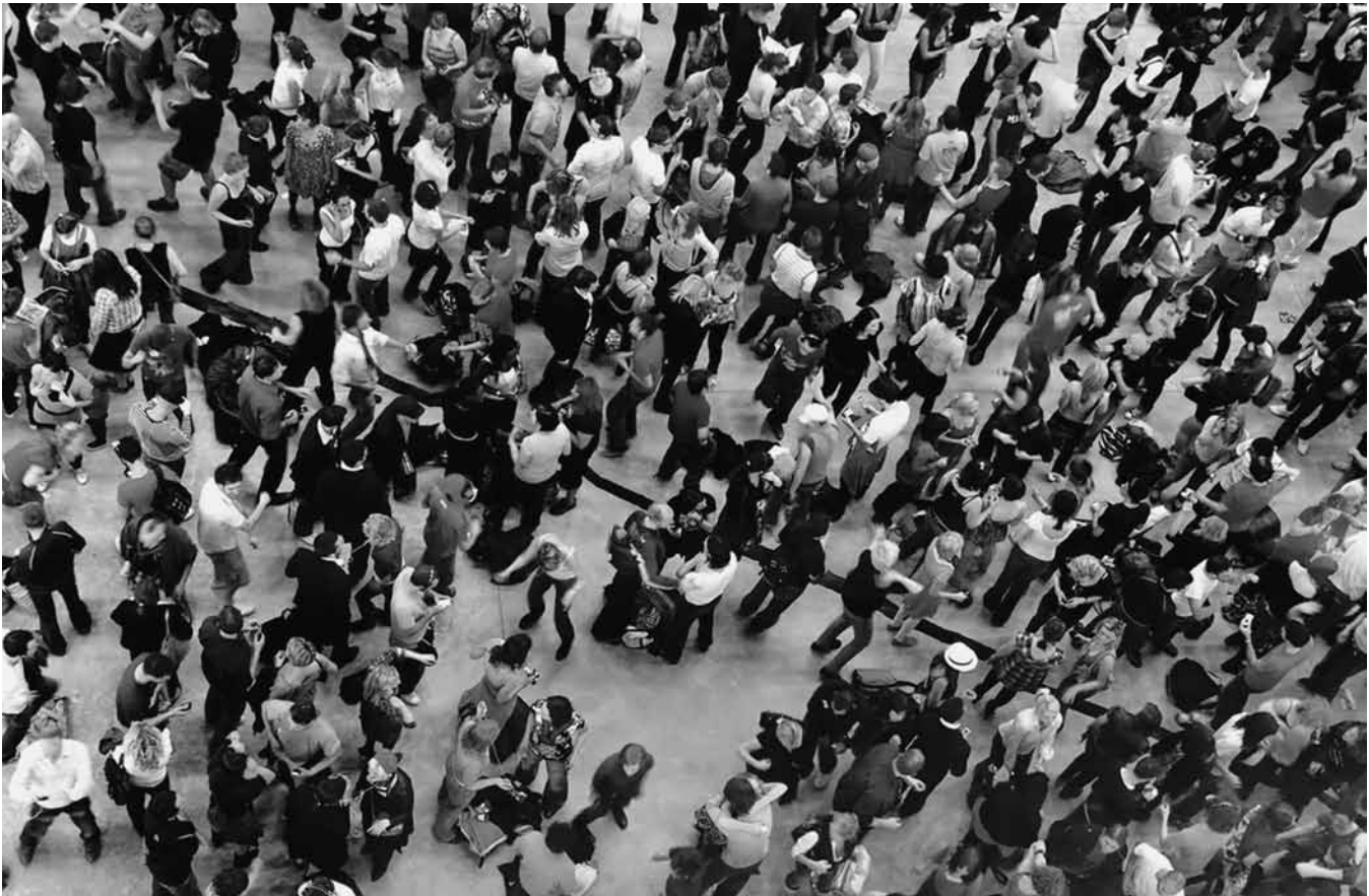
Figure 10. Dean Ayres, Dancing on the Edge , 2007 (photograph © Dean Ayres, www.flickr.com/photos/deano/ ).