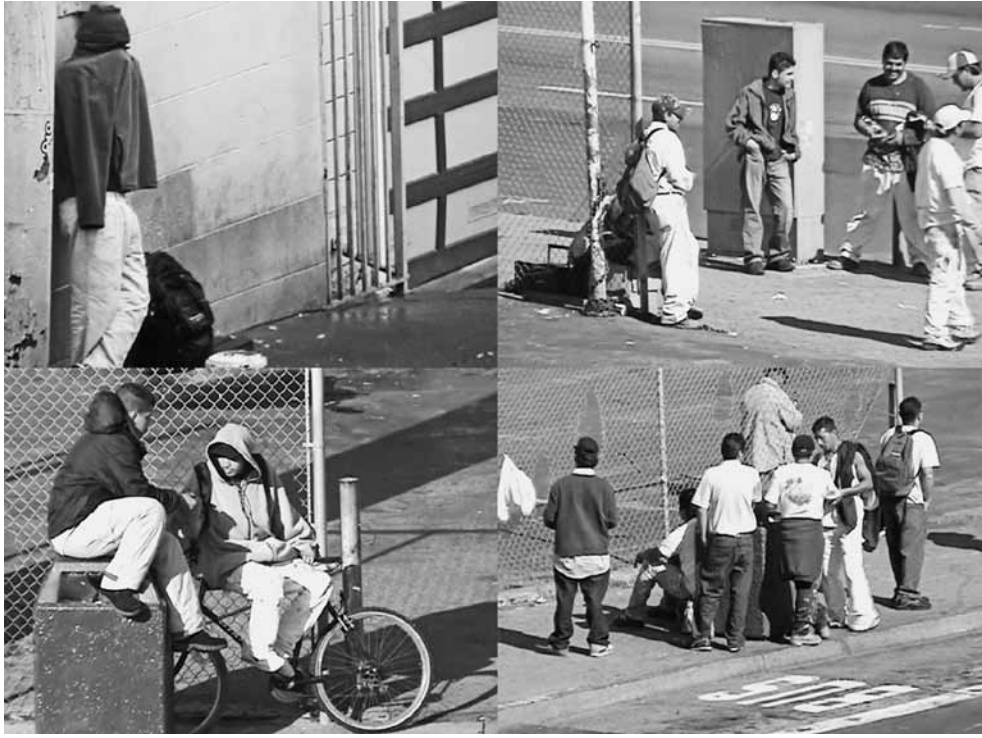
Figure 3. Tony Labat, Day Labor: Mapping the Outside (Fat Chance Bruce Nauman), 2006. Surveillance station, 2-channel projection, LCD monitors, dimensions variable, installation detail (artwork © Tony Labat).

that “the world is practically divided between curating cultures and curated cultures,” 35 still ring true.