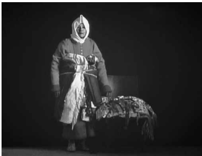
Figure 5. Yto Barrada, The Smuggler , Tangier, 2006. Video still, 11 min. (artwork © Yto Barrada).

gler's demeanour and facial expressions evince an unmistakably dignified desire to demonstrate the proper techniques for her trade. At another level, however, is revealed the mundane daily struggle of fashioning a living in the Gibraltar region; the woman's diminutive frame seems to groan with every layer added, and at one point a young girl appears from beyond the frame to assist with the wrapping.