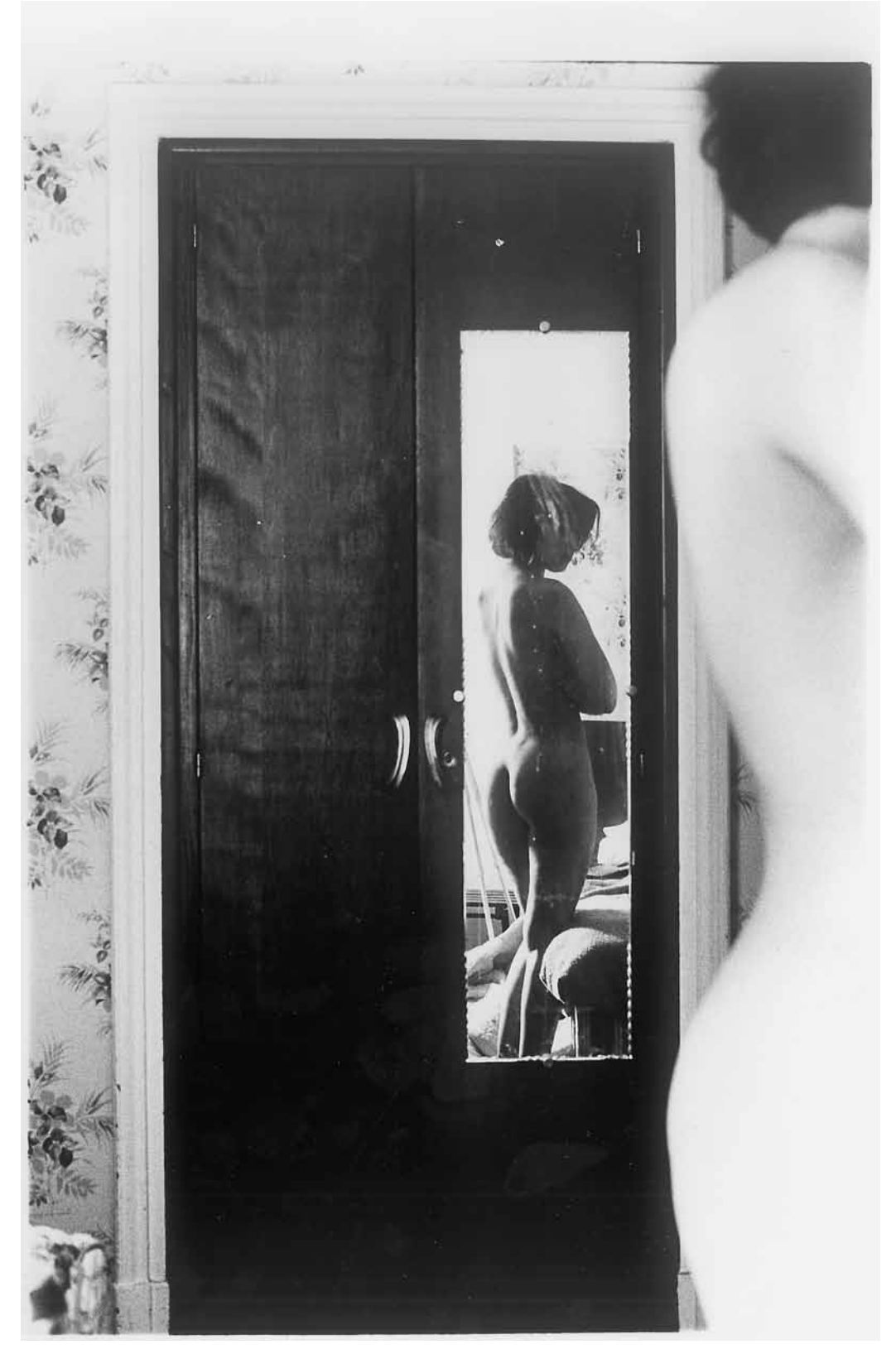
Figure 2. Alix Cléo Roubaud, La Bourboule, chambre 14 (Photo courtesy Jacques Roubaud and Éditions du Seuil).