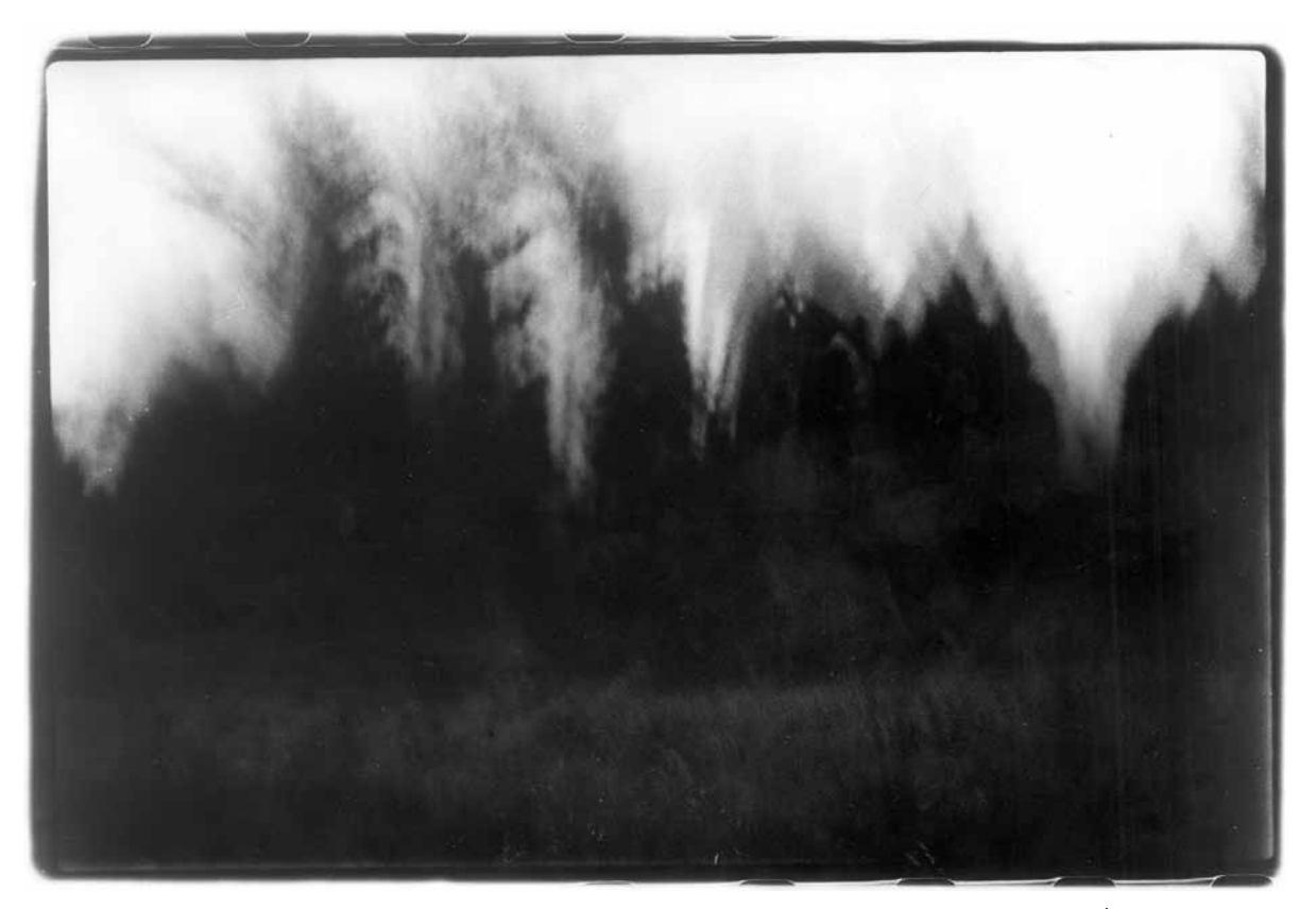
Figure 4. Alix Cléo Roubaud, Quinze minutes la nuit au rythme de la réspiration (Photo courtesy Jacques Roubaud and Éditions du Seuil).

aesthetic that only became fully formalized in art after her death. But, subtended to these bodily explorations, oscillating between subjective and objective views, was the presence of a chronic illness that profoundly limited her ability to work. At a symbolic level, air and breath would also seem to be a viable way of negotiating such boundaries, and indeed Roubaud's work is most profound when her struggle for air is literally mapped onto her struggle for self-expression in photography.