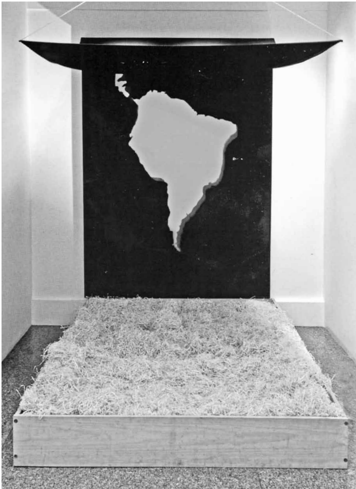
Figure 2. Antonio Manuel, Soy Loco por ti (I Am Crazy for You) , 1969. Wood, cloth, plastic, grass, rope. Collection of the artist.