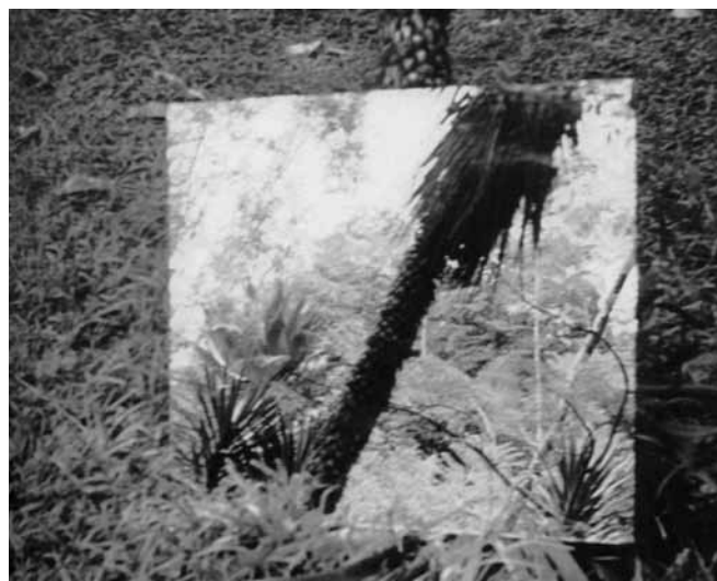
Figure 9. Luciano Gusmão, Reflexões ( Reflections ), 1970. Mirror.

that contradiction is insoluble since the background is in itself the same thing as perceiving; everything we perceive is on a background.... [However], in the non-object, since the problem of representation is avoided, the problem of the figure-background is avoided as well. The background, on which the non-object is perceived, is not a metaphorical background of abstract expression, but is real, actual space—the world. 48