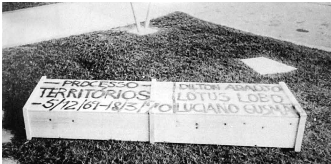
Figure 8. Dilton Araújo, Luciano Gusmão, Lotus Lobo, Territórios (Territories) , 1969. Installation view at Parque Municipal, Belo Horizonte. Wooden box containing the remains of the installation at Museu de Arte da Pampulha.

Information , which opened just months after Do Corpo à Terra , included many American and European land artists whose work was conceptually and formally similar to that of Oiticica. 45