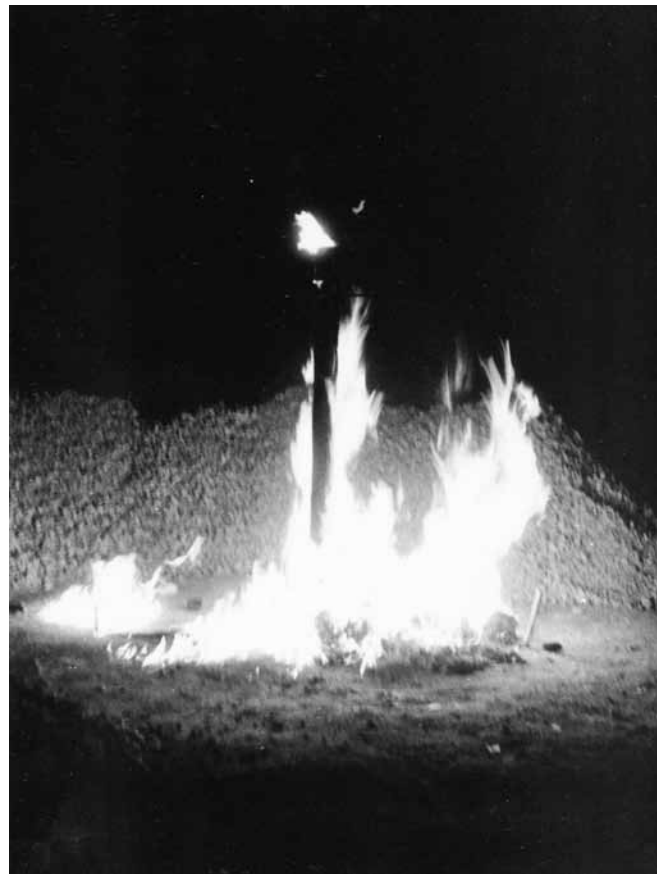
Figure 4. Cildo Meireles, Tiradentes: Totem-Monumento ao Preso Político ( Tiradentes: Totem-Monument to the Political Prisoner ), 1970. Wooden pole, white cloth, thermometer, ten live chickens, gasoline, fire (Photo: Luiz Alponus Guimarães).

Do Corpo à Terra ( From Body to Earth ), an outdoor exhibition held on 17–21 April 1970 in Belo Horizonte, incorporated the formal vocabulary introduced in the Salão da Bússola with the surrounding landscape. Concurrent with Objeto e Participação ( Object and Participation ), a group exhibition organized by Mari'Stella Tristão at Belo Horizonte's newly inaugurated Palácio das Artes, Do Corpo à Terra was organized by Frederico Moraes at the nearby Parque Municipal. It presented both a radicalization of the phenomenological experiments exhibited by Manuel and Meireles in the Salão da Bússola and a fulfillment of the unrealized potential of Territórios for land art. Indeed, as the exhibition's title made clear, landscape intervention and corporeal performance were ultimately linked in Do Corpo à Terra .