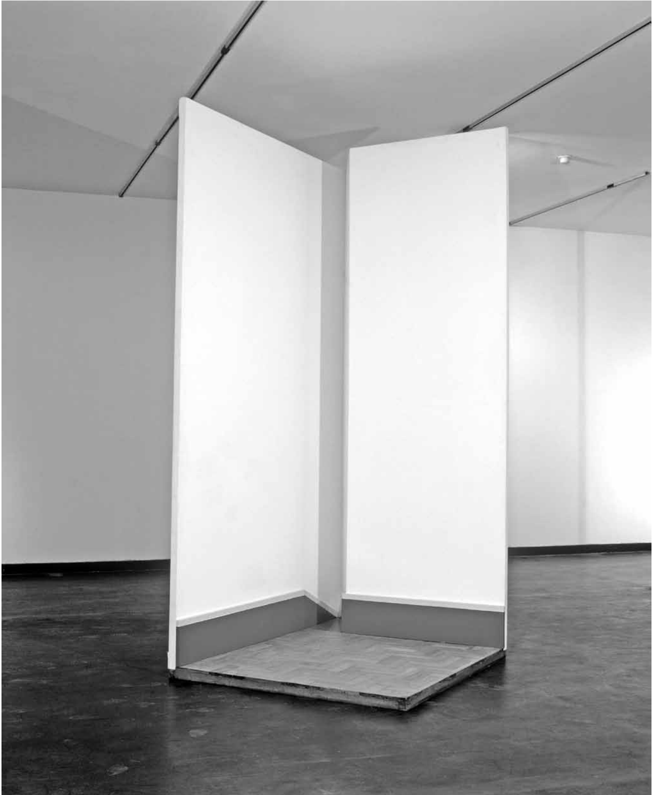
Figure 1. Cildo Meireles, Espaços Virtuais ( Virtual Spaces ), from Cantos ( Corners ) series, 1967–68. Wood, canvas, paint, woodblock, flooring, 301.5 x 185 x 135 cm. Rio de Janeiro, Museu de Arte Moderna.