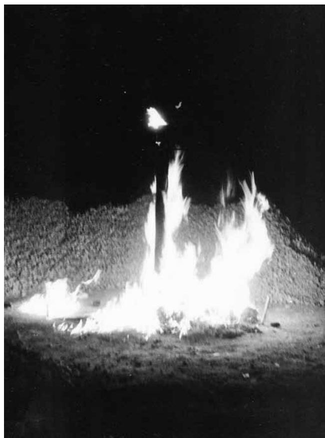
Figure 4. Cildo Meireles, Tiradentes: Totem-Monumento ao Preso Político ( Tiradentes: Totem-Monument to the Political Prisoner ), 1970. Wooden pole, white cloth, thermometer, ten live chickens, gasoline, fire (Photo: Luiz Alponus Guimarães).

Do Corpo à Terra ( From Body to Earth ), an outdoor exhibition held on 17–21 April 1970 in Belo Horizonte, incorporated the formal vocabulary introduced in the Salão da Bússola with the surrounding landscape. Concurrent with Objeto e Participação ( Object and Participation ), a group exhibition organized by Mari'Stella Tristão at Belo Horizonte's newly inaugurated Palácio das Artes, Do Corpo à Terra was organized by Frederico Moraes at the nearby Parque Municipal. It presented both a radicalization of the phenomenological experiments exhibited by Manuel and Meireles in the Salão da Bússola and a fulfillment of the unrealized potential of Territórios for land art. Indeed, as the exhibition's title made clear, landscape intervention and corporeal performance were ultimately linked in Do Corpo à Terra .