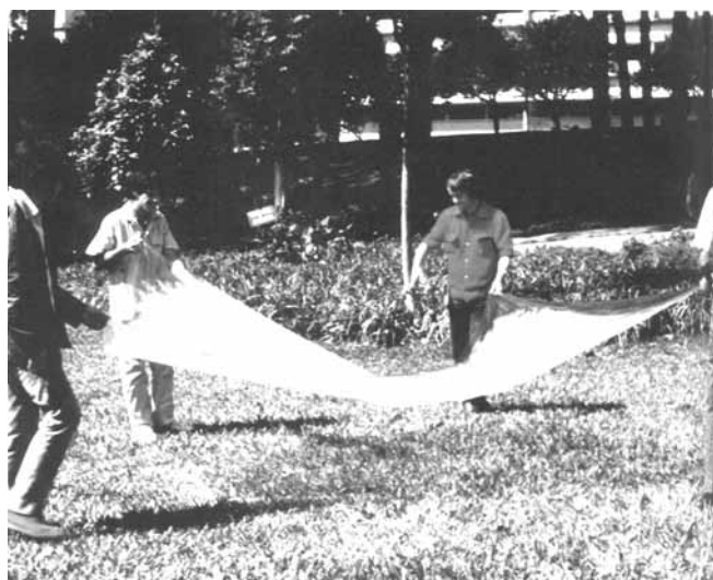
Figure 10. Luciano Gusmão, Transpiração ( Transpiration ), 1970. Plastic sheet.

Gusmão built on formal lessons learned from the Neoconcretists, but his work simultaneously paralleled reversibility, an idea put forth in land art, in that the work can easily be undone by removing the mirrors. This is explored in another solo work Gusmão contributed to the exhibition, Transpiração ( Transpiration , 1970; fig. 10). He laid a sheet of plastic on the park's lawn in order to trap the sweating of the grass. The work is reversible, as the condensation that is captured on the plastic sheet could be transferred back to the grass. In this way, Transpiração parallels works by artists such as Hans Haacke, whose Condensation Cube (1963–65) similarly captured environmental effects, albeit with a more explicit relationship to the gallery setting. 49 Haacke's explorations of biological systems were done, he stated, with "the explicit intention of having their components physically communicate with each other, and the whole communicate physically with the environment." 50 As Gusmão was trained as a scientist, such interests would very much intersect with his own. 51