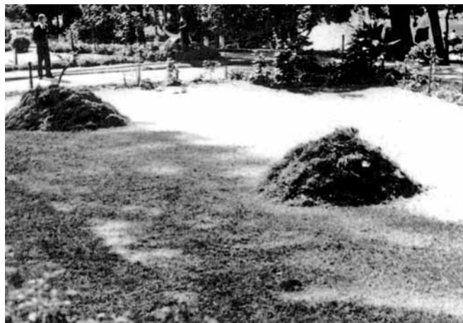
Figure 12. Frederico Morais, 12. CONTRA-ARTE/CONTRA-NATUREZA (12. AGAINST-ART/AGAINST NATURE ) from Quinze Lições sobre Arte e História da Arte—Apropriações, Homenagens e Equações (Fifteen Lessons on Art and Art History—Appropriations, Homages, and Equations) series, 1970. Photomontage.