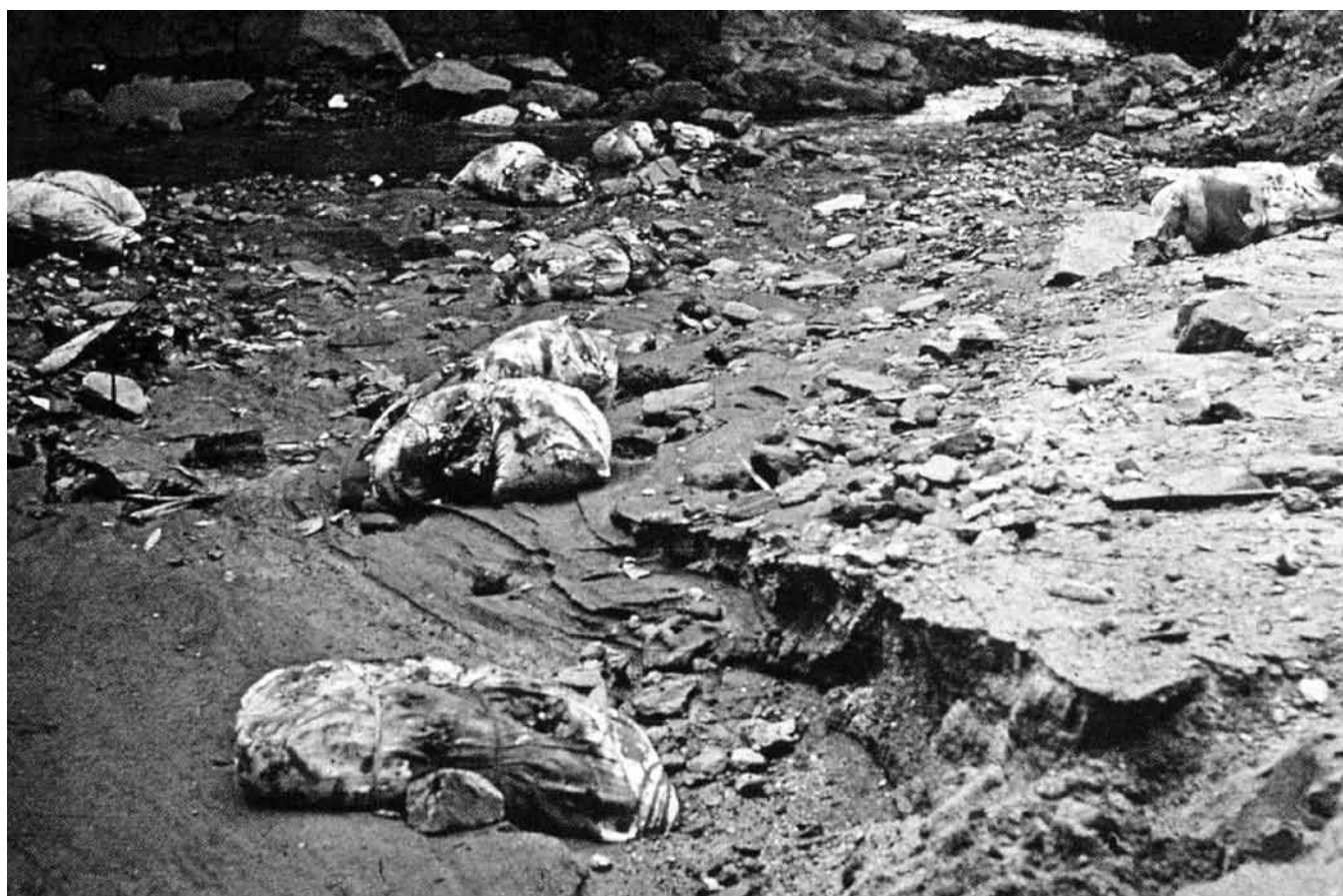
Figure 5. Artur Barrio, Situação.....T/T,I..... ( Situation..... T/T,I..... ), 1970. Blood, meat, bones, clay, foam rubber, cloth, bags. Minas Gerais, Inhotim Centro de Arte Contemporânea (Photo: César Carneiro).

mimicking of state-sponsored crimes to put into high relief the violent suppression that had again befallen Brazil.