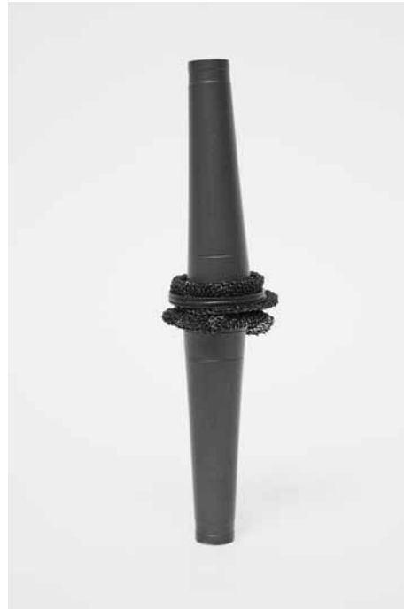
Micro (One on One) , 2014