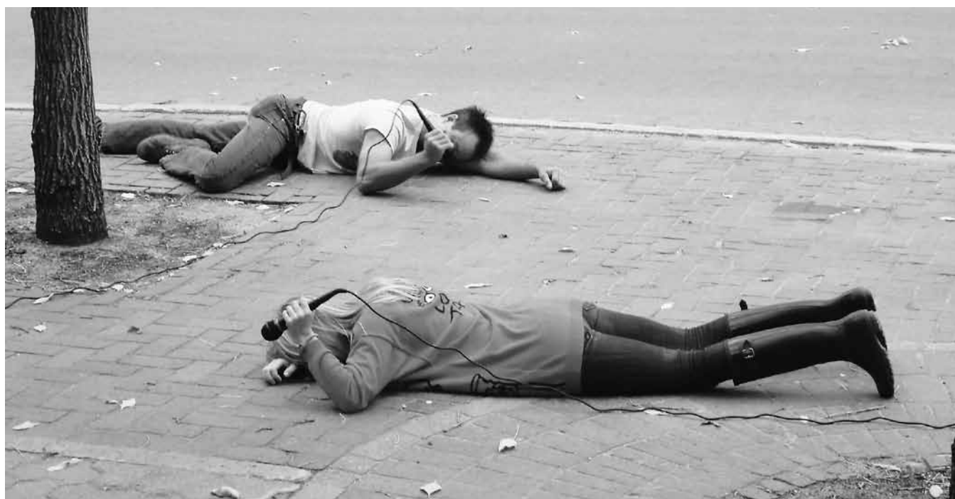
Hit Parade (Winnipeg), 2011

The Micro Series consists of two principal components: the first, alluded to above, is a structural element that translates into the staging of simple actions that count, repeat, and parcel out time. The second component is more tangible, and it could not be more concrete: a microphone. In this series the microphone is foregrounded; it is exploited not only sonically but also as an object and image. In other words, the microphone's iconicity is explicitly explored. At its origin, as noted in Chambers Concise Dictionary , the word microphone meant “an instrument for