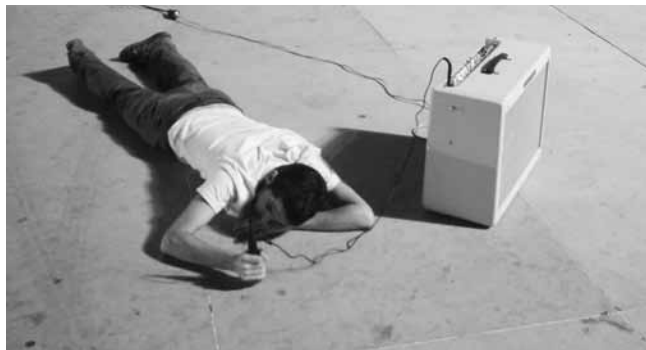
Hit Parade (Porto), 2011

What if every moment of the day, and of our lives, were punctuated? Every gesture marked? What if the infinitesimally small were amplified to become noticeable, recordable, replayable? To “saturate every atom,” as Woolf exhorts, would be to imprint the everywhere and everytime of everything, to suffuse space until it suffocates. The Micro Series asks these questions, but adds an element of absurdity like the one suggested by the idiosyncratic and eccentric composer Wölfl in the second epigraph. With the Oberon he was attempting to devise a numbering system that would encompass infinity; in The Micro Series I settle for numbers that allude to infinity but are infinitely more manageable. The numbers (e.g., one thousand, one million) that I use serve as arbitrary and abstract constants, and the concrete and repetitive actions performed to attain them establish an infinite variety of microgestures among the seemingly indistinguishable actions. In short, the difference in repetition is made manifest. The goal is a segmentation of the mundane to reveal the extraordinary in the ordinary.