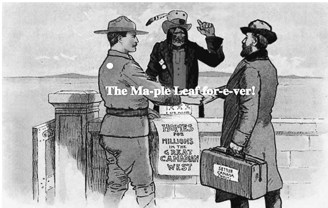
Video still, Leaf Forever , 4'38" 2012

Also in process is my performance work, Unsettling , based on the vermillion-coloured horse-drawn exhibition wagons used by Canadian land agents working farm to farm and door to door, recruiting settlers one at a time. A vermillion costume containing and displaying static and time-based media, Unsettling appropriates the capital in the personal touch. Colonial recruiters worked face to face and I do too, as I invite viewers to hunt through my clothing for small video projections and various other samples of colonial booty. This offers a close physical relationship between the viewer, the source material, and the appropriator/subverter/maker/performer—me. The small and intimate operation of Unsettling is crafted to assert that it is not only possible, but also necessary , to imagine decolonization in personal, tiny, but doable ways.