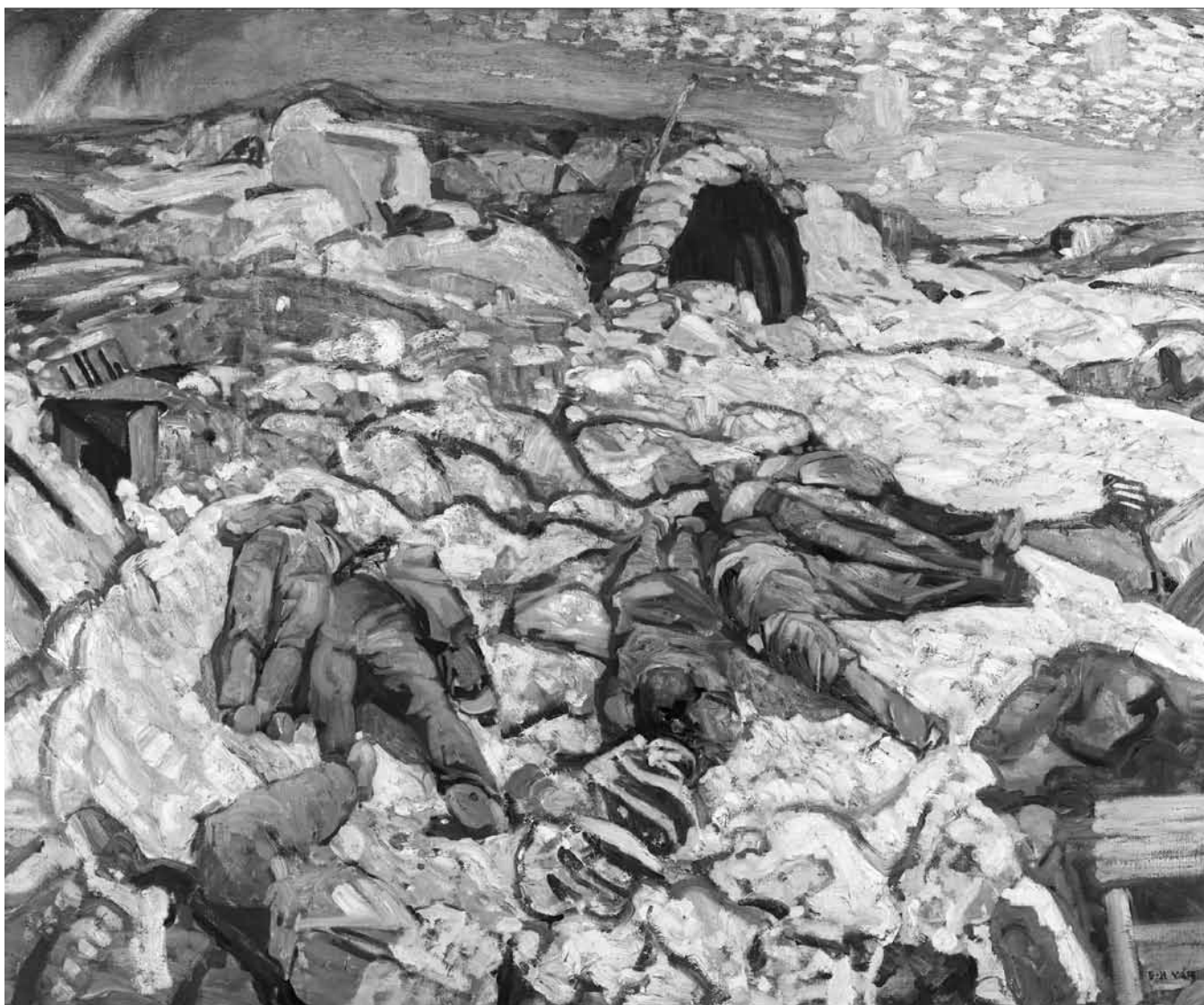
Figure 1. Frederick Varley, The Sunken Road , 1919, oil on canvas, 132.7 x 162.7 cm, Canadian War Museum, Beaverbrook Collection of War Art, 19710261-0771.