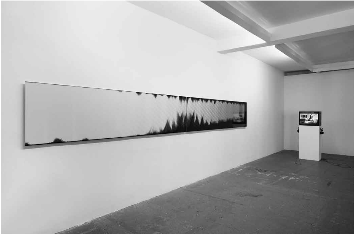
Figure 3. Adam Broomberg and Oliver Chanarin, The Day Nobody Died: Seeing is Believing , 2008. Installation shot, KW Institute of Contemporary Art, Berlin, 2011.

photographs seem to have failed: they reverse or invert our expectations and arrive at an abrupt conclusion. As a means of representation, photography itself seems to have failed, to have arrived at an end suddenly, without catharsis, without indicating something other, and before completing what is typically expected of it. Before referring to anything or anywhere else, these photographs refer to themselves. The Day Nobody Died highlights what John Tagg calls “the poverty of photography:” 13 the operations of the medium have been separated from, or put in conflict with, procedures that normally add meaning to images.