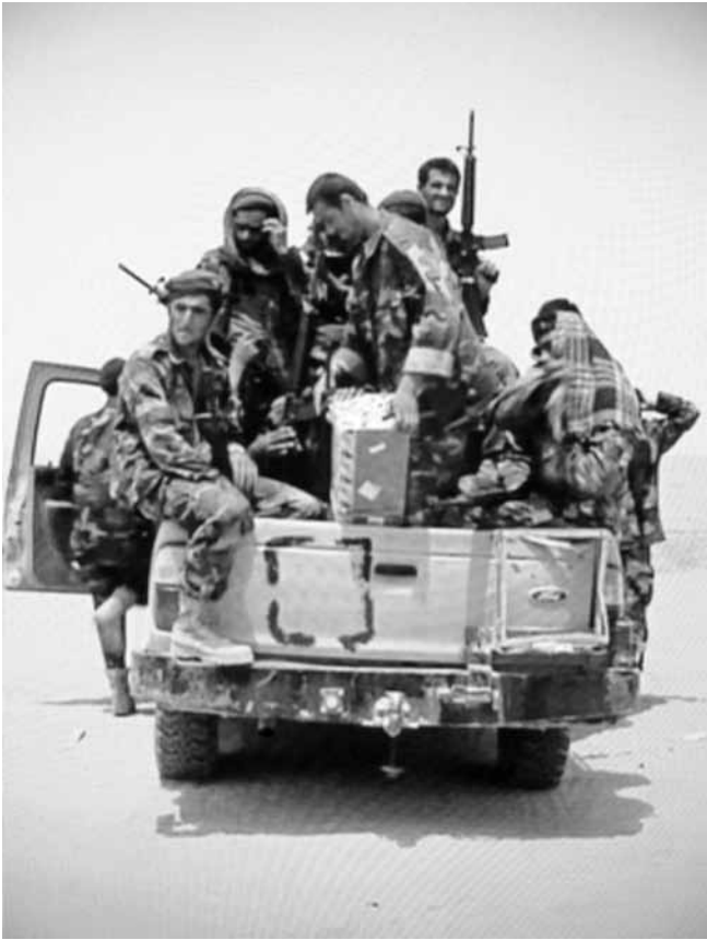
Figure 6. Adam Broomberg and Oliver Chanarin, The Day Nobody Died , 2008, 23:07. Film Still.

of interpreting photographic reproduction and circulation. Koepnick argues that photographs that subvert expectations in this way invite us “to explore why and how we have come to encounter photographs as authenticating media of history and memory—as prostheses of perception and recollection—in the first place.” 25