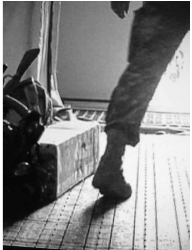
Figure 1. Adam Broomberg and Oliver Chanarin, The Day Nobody Died , 2008, 23:07. Film Still.

Although The Day Nobody Died is a series of abstract stains, it is irreducibly photo-graphic: at a specific time and place, particles of light have been directed toward, and have inscribed themselves on, a sensitized surface. The works are markers of events without any accompanying coded information about the events in question beyond their titles, and the fact that the photographic paper was present at the time of each event's occurrence. Measured against their individual titles, the photographs show themselves to be inadequate records, errant inscriptions with no clear information to convey. This series directs us toward thinking of photography's own conditions as a medium at the same time that it investigates the medium as a visual and evidentiary record. The disjunction that characterizes the project produces an excess: the event of photographic exposure overpowers photography's role as a transmitter of legible or coded information. Yet, these photographs remain tied to the sensible event of their production (their emergence through light), and "when you look at these photographs...it becomes impossible to forget that they were made during an embed; whereas a traditional photojournalistic image attempts to obscure this fact." 8 The photo-graphic stain preserves the events as affective signals