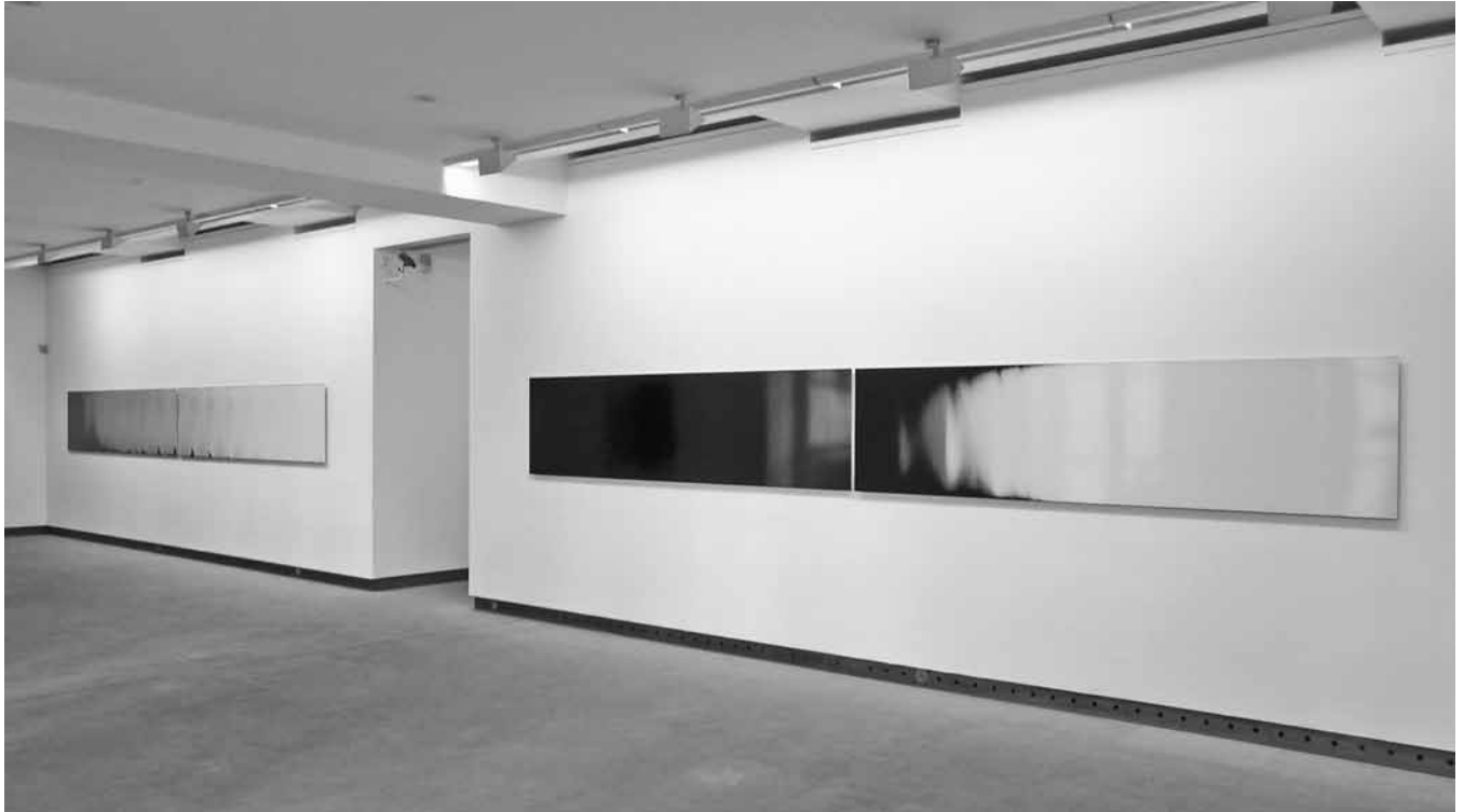
Figure 8. Adam Broomberg and Oliver Chanarin, The Day Nobody Died , 2008. Installation shot, Galerie Karsten Greve, Paris, 2009.

and in the moment its own ground.” 46 By refusing semblance and opening instead toward the groundlessness of imagination, The Day Nobody Died draws attention to the mechanisms and procedures through which the real is constructed and subsequently experienced.