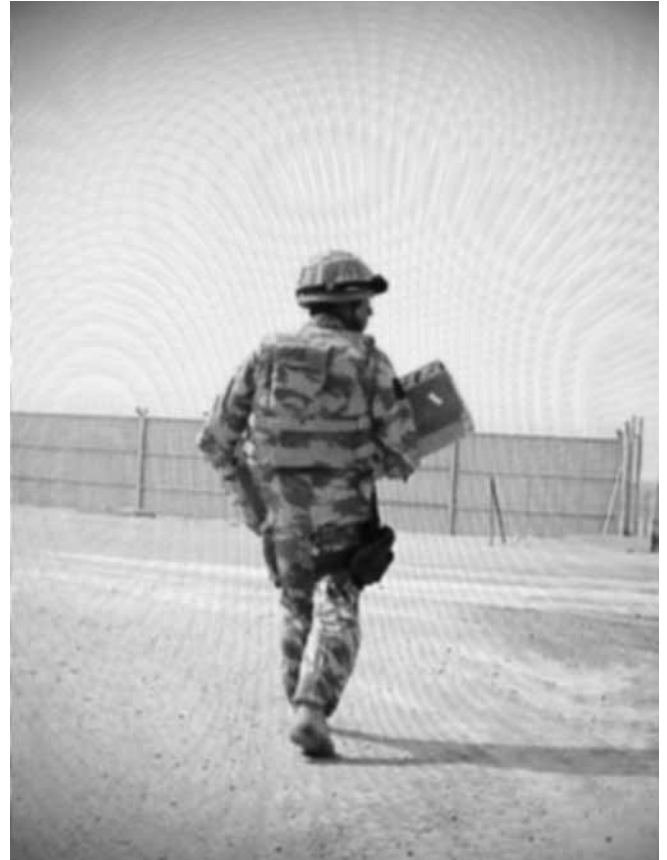
Figure 7. Adam Broomberg and Oliver Chanarin, The Day Nobody Died , 2008, 23:07. Film Still.

Nancy’s approach to the image in general and to the photographic image in particular focuses on the relationship between force and violence. His understanding of force and violence as they relate to the image and photography answer Butler’s call to attend to the “how” of war photography, and also help to clarify Batchen’s call for a war photography that incorporates questions about the nature of the image by refusing, or arresting, certain characteristics of photography. Ultimately, recalling Reinhardt, The Day Nobody Died is concerned with photography’s complicity with the instigation and perpetuation of militarized violence and with the ways in which photography has allowed the