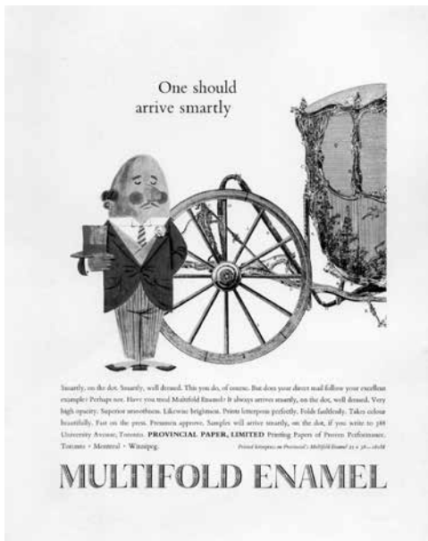
Figure 1. "One should arrive smartly," Provincial Paper advertisement ca. 1959. O.K. Schenk, art direction and illustration.