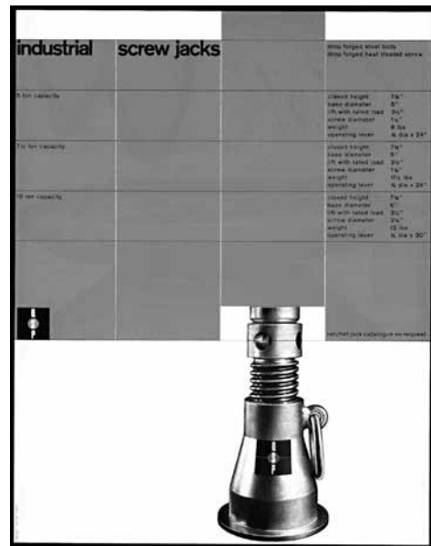
Figure 2. "Industrial screw jacks," page from an industrial goods catalogue ca. 1958. Ernst Roch, design.