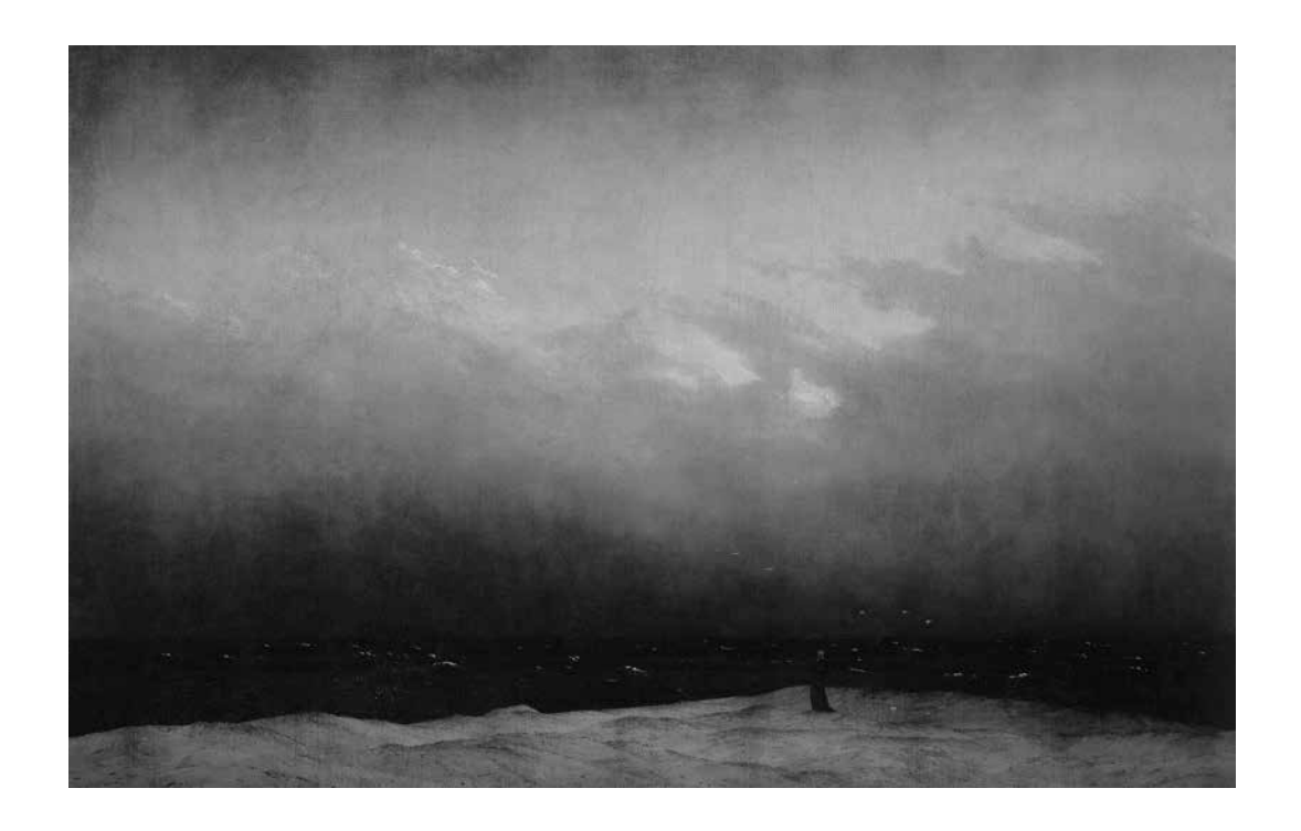
Figure 2. Caspar David Friedrich, Monk by the Sea, 1808–10. Oil on canvas, 110 x 171.5 cm. Nationalgalerie, Staatliche Museen, Berlin.