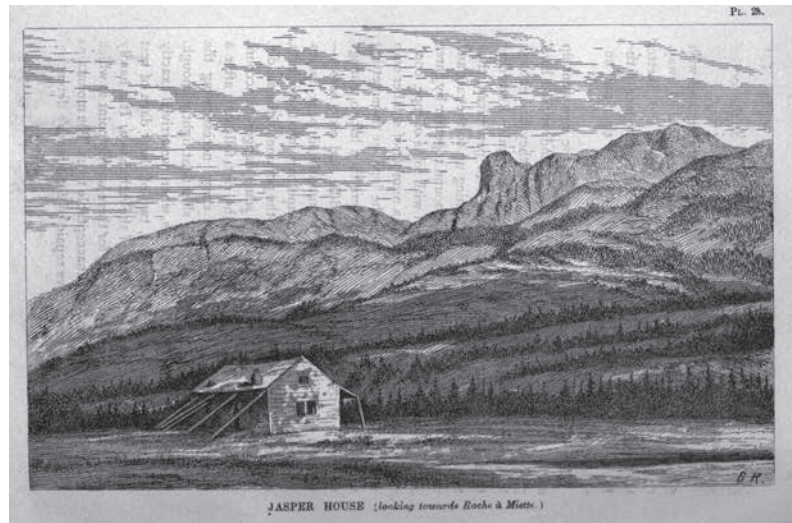
Figure 4. Jasper House (looking toward Roche à Miette), after a photograph by Charles Horetzky, in George Monro Grant, Ocean to Ocean (Toronto, 1873), pl. 28. 20.5 × 15 cm.

in the Fort Garry to Jasper House Album , part of the Sandford Fleming fonds at Library and Archives Canada; in the Photographic Albums of Canadian Settlement , part of the Department of the Interior fonds, also at Library and Archives Canada; and in the Peace River Album held at Vancouver Public Library. These are collections and albums that served purposes private, public, and governmental quite different than Grant's publication, with Horetzky's photographs finding a unique reading in each. 28