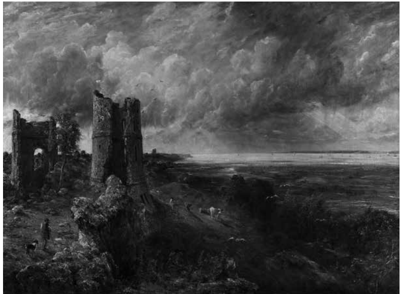
Figure 1. John Constable, Hadleigh Castle, The Mouth of the Thames – Morning after a Stormy Night, 1829 . Oil on canvas, 121.9 x 164.5 cm. New Haven, Yale Center for British Art, Paul Mellon Collection.

especially when it comes to Constable's late work, stressing its complexity and conflicting aspects, 373. For a subtle reading of Constable's late landscape painting as autobiographical project within a broader study of the impact of economic and social changes on the perception of the English countryside during the long eighteenth century, see Ann Bermingham, Landscape and Ideology: The English Rustic Tradition, 1740–1860 (Berkeley/Los Angeles, 1986), 87–155, esp. 128–29.