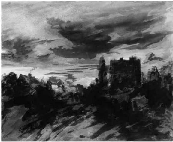
Figure 9. John Constable, A House, Cottage, and Trees by Moonlight , ca. 1830–36. Sepia and grey wash, 18.7 × 22.8 cm. London, Victoria and Albert Museum.

framework of thought had to be opaque. The truthfulness of Constable's naturalism was therefore signalled by the unbridgeable gap between the physiological process of sensation and mental perception. That sensuous feelings did not bear any resemblance to the objects causing them, moreover, left room for the artist's imagination, as Knight had already stressed. Thus, Constable could exploit the figurative impulse of the perceptual process revealed by Berkeley, Reid, Knight, and Alison in order to convey more than merely optical phenomena. He could impart the noisy, rambunctious atmosphere of East Bergholt Fair | fig. 8 | to the viewer, or imbue a landscape with his own feelings as in his late bistre drawings, | fig. 9 | thus giving pictorial expression to subjective experiences independent of external senses. From this perspective, Constable's late "expressionistic" oeuvre appears quite consistent with the naturalist aesthetics the artist developed in the first decades of his career. ¶