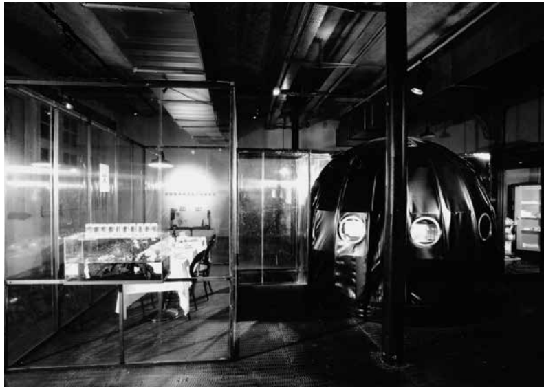
Figure 2. Tissue Culture & Art Project, Disembodied Cuisine , installation, L'art biotech , March 14–May 4, 2003, Le Lieu unique, Nantes, France, 2003.