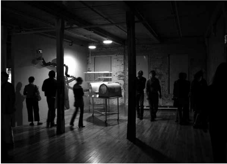
Figure 1. Kathy High, Embracing Animal , 2005–2006, installation shot, Becoming Animal: Art in the Animal Kingdom , May 2005–February 2006, Massachusetts Museum of Contemporary Art.