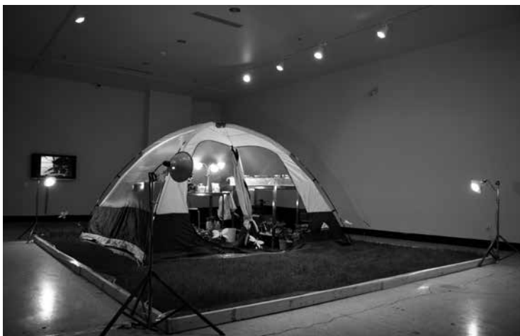
Figure 8. Jennifer Willet, InsideOut: Laboratory Ecologies , 2008, installation, Art Gallery of Alberta, 2008.