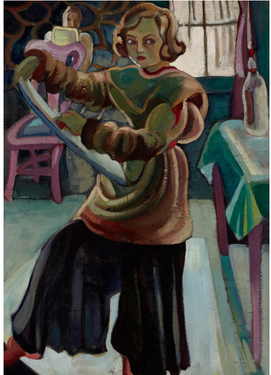
Figure 3. Pegi Nicol MacLeod, Costume for a Cold Studio (Self-Portrait) , ca. 1930. Oil on canvas, 43.1 x 38.1 cm. Robert McLaughlin Gallery.