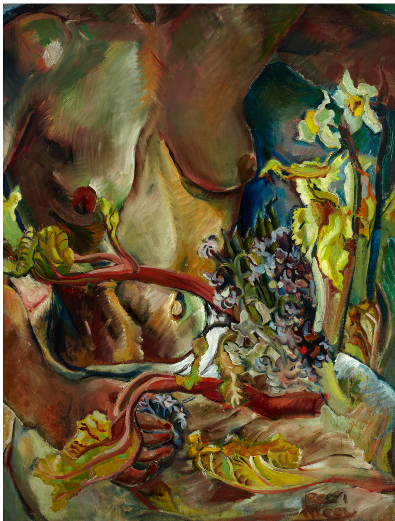
Figure 5. Pegi Nicol MacLeod, Torso and Plants , ca. 1935. Oil on canvas, 90.9 × 68.7 cm. Robert McLaughlin Gallery.